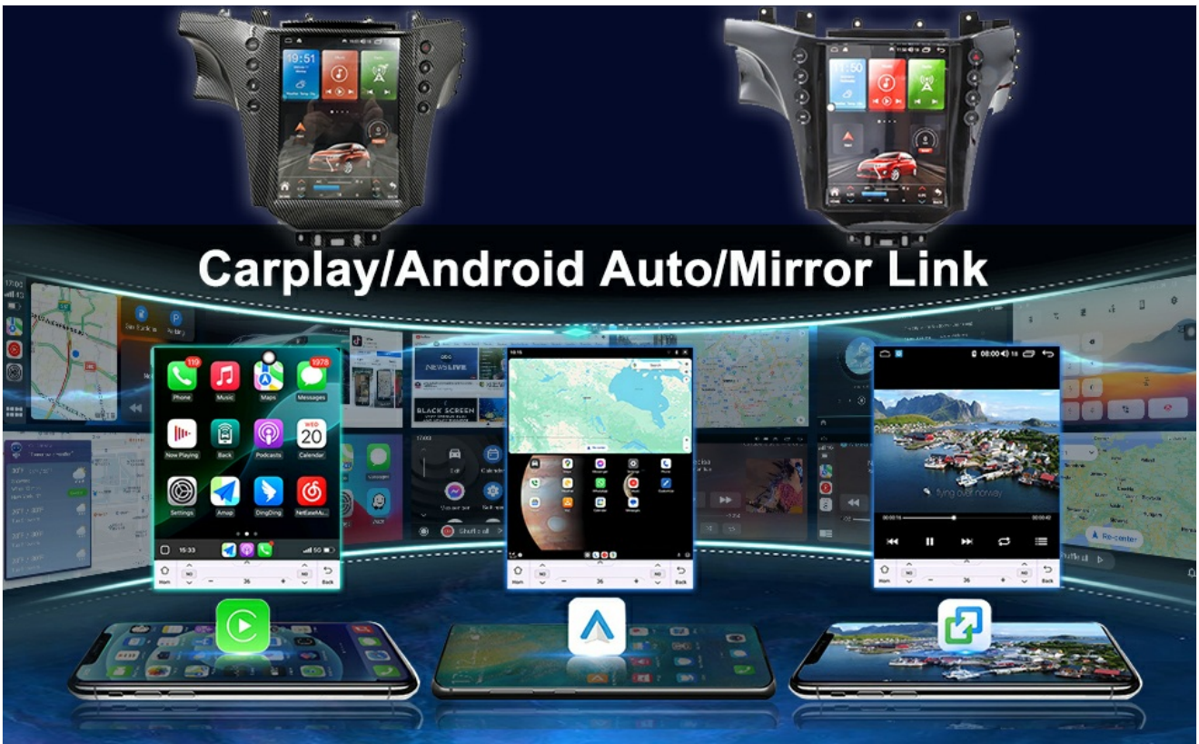
Image: Shows the various smartphone integration options including CarPlay, Android Auto, and Mirror Link.