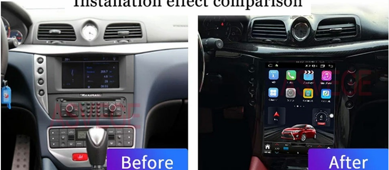
Image: Visual representation of the improved aesthetic and functionality post-installation.