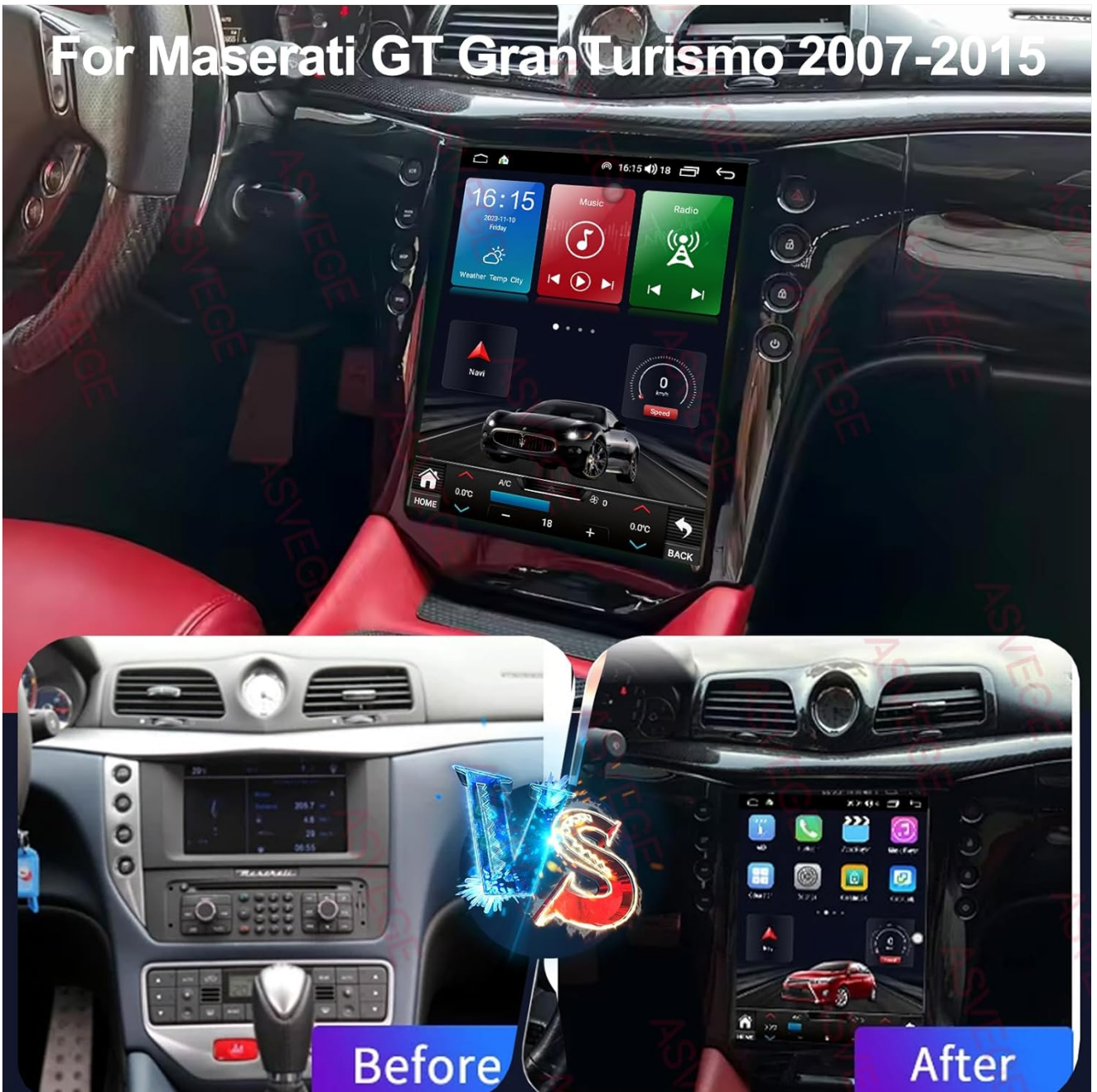
Image: Comparison of the dashboard before and after installing the new head unit.