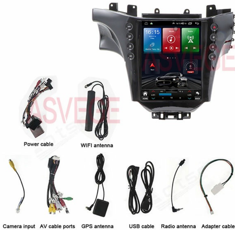
Image: The main unit and various cables and accessories.