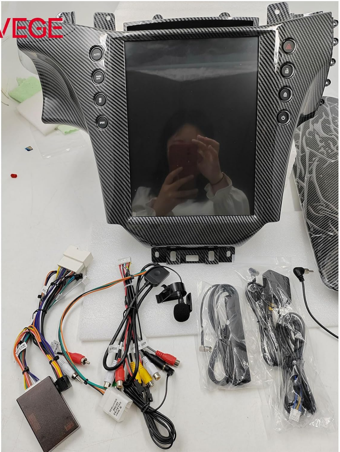
Image: All components included with the ASVEGE 12.1-inch Car Radio.