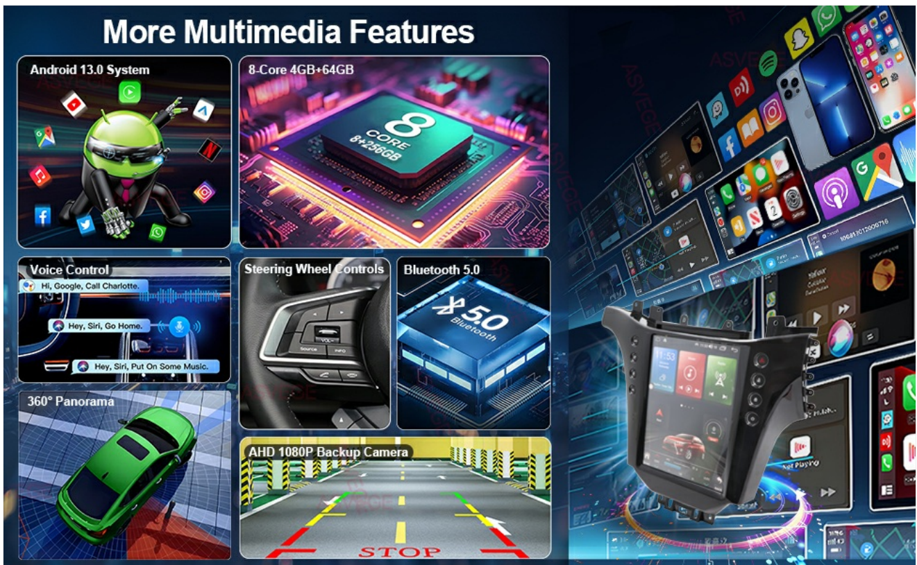
Image: Overview of multimedia features including Android system, 8-core processor, voice control, steering wheel controls, Bluetooth 5.0, 360-degree panorama, and AHD backup camera support.

Play music and videos from various sources, including USB drives, internal storage, or streaming services via internet connection. The unit supports a wide range of audio and video formats.