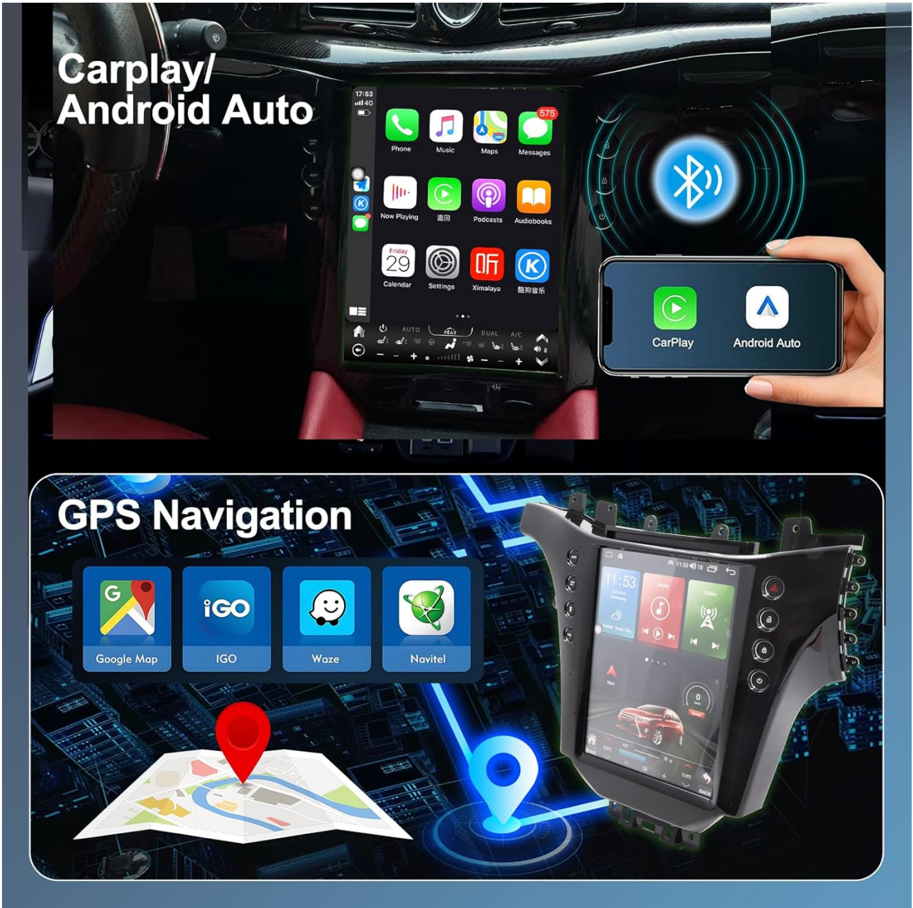
Image: Demonstrates CarPlay, Android Auto, and GPS navigation capabilities.