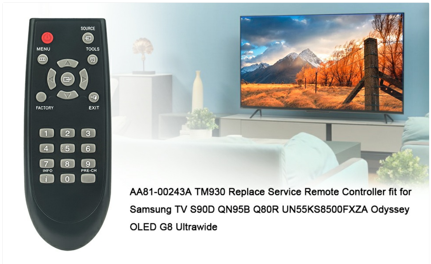
AA81-00243A TM930 Replace Service Remote Controller fit for Samsung TV S90D QN95B Q80R UN55KS8500FXZA Odyssey OLED G8 Ultrawide

Image: The service remote positioned next to a modern Samsung television, visually representing its intended use and compatibility with various Samsung displays.