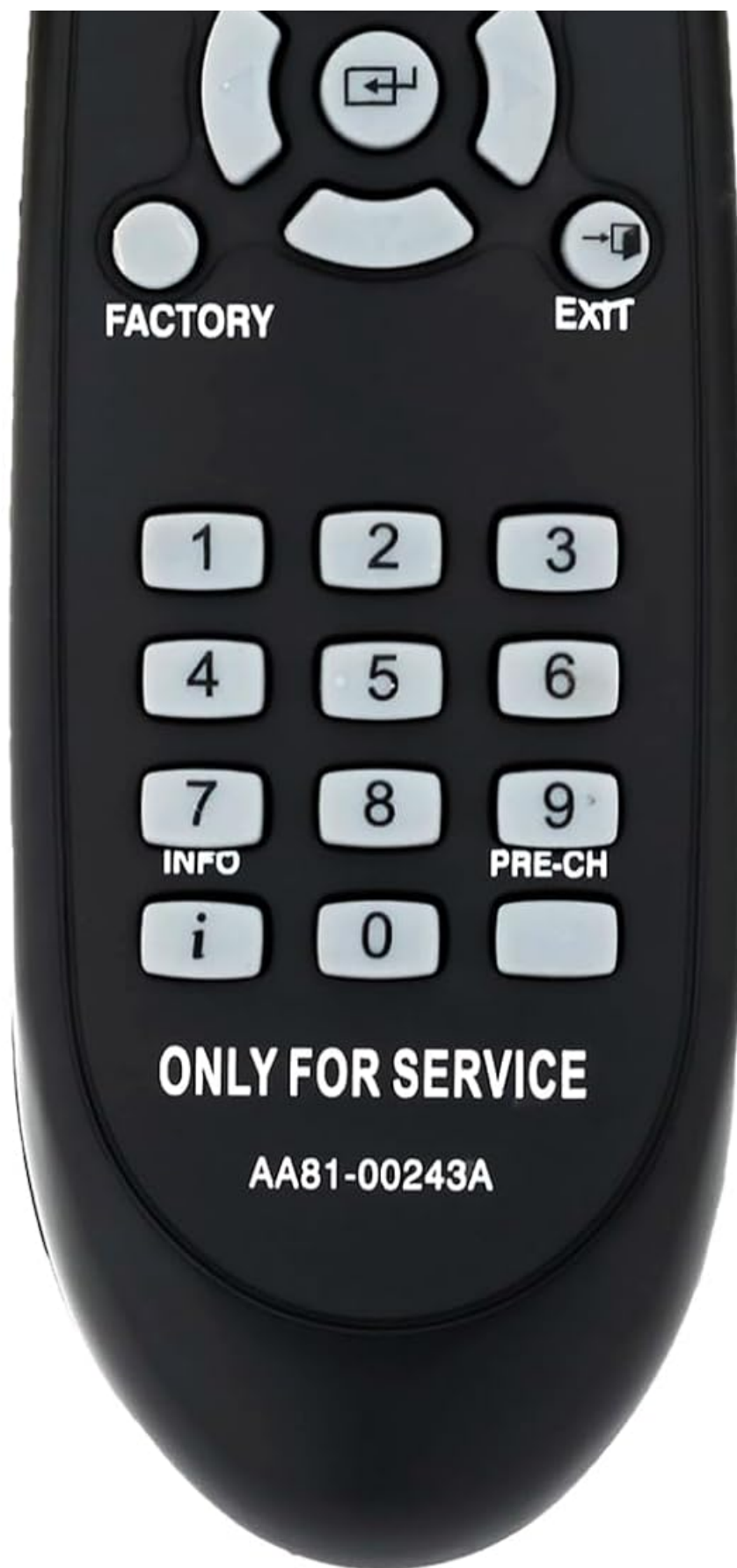
Image: Top-down view of the remote control, illustrating its physical dimensions (length and width).