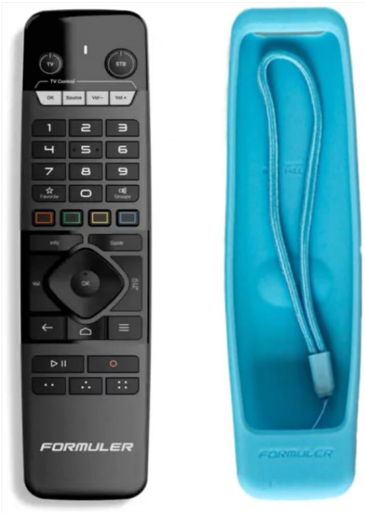
Image 2.1: The Formuler GTV-IR1 remote control shown alongside its protective blue silicone cover. The remote features a standard button layout for navigation and control.

The remote is ergonomically designed for comfortable handling and includes a bonus silicone cover for added protection and grip. The silicone cover may come in various colors such as black, mint, blue, or orange.