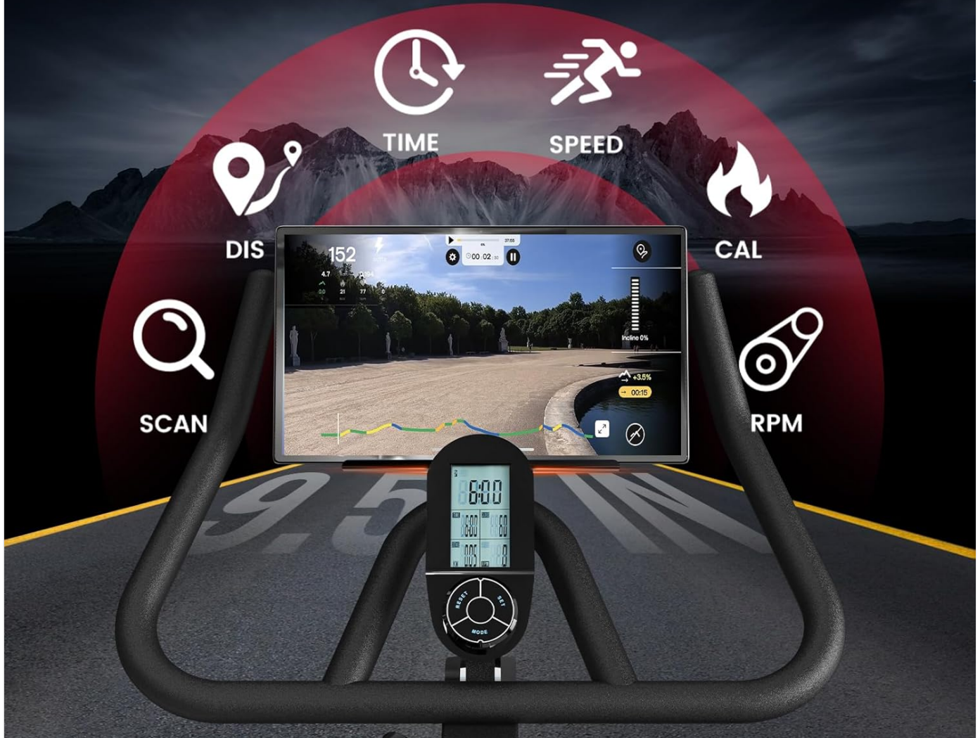
Image: View of the smart digital display and the spacious 9.5-inch tablet holder.