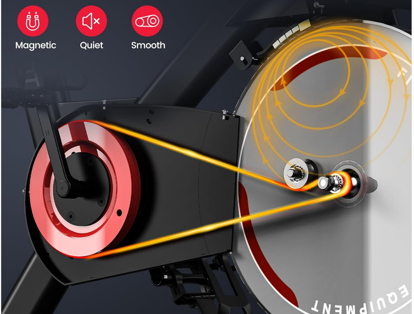
Image: Illustration of the magnetic resistance and quiet belt drive system.