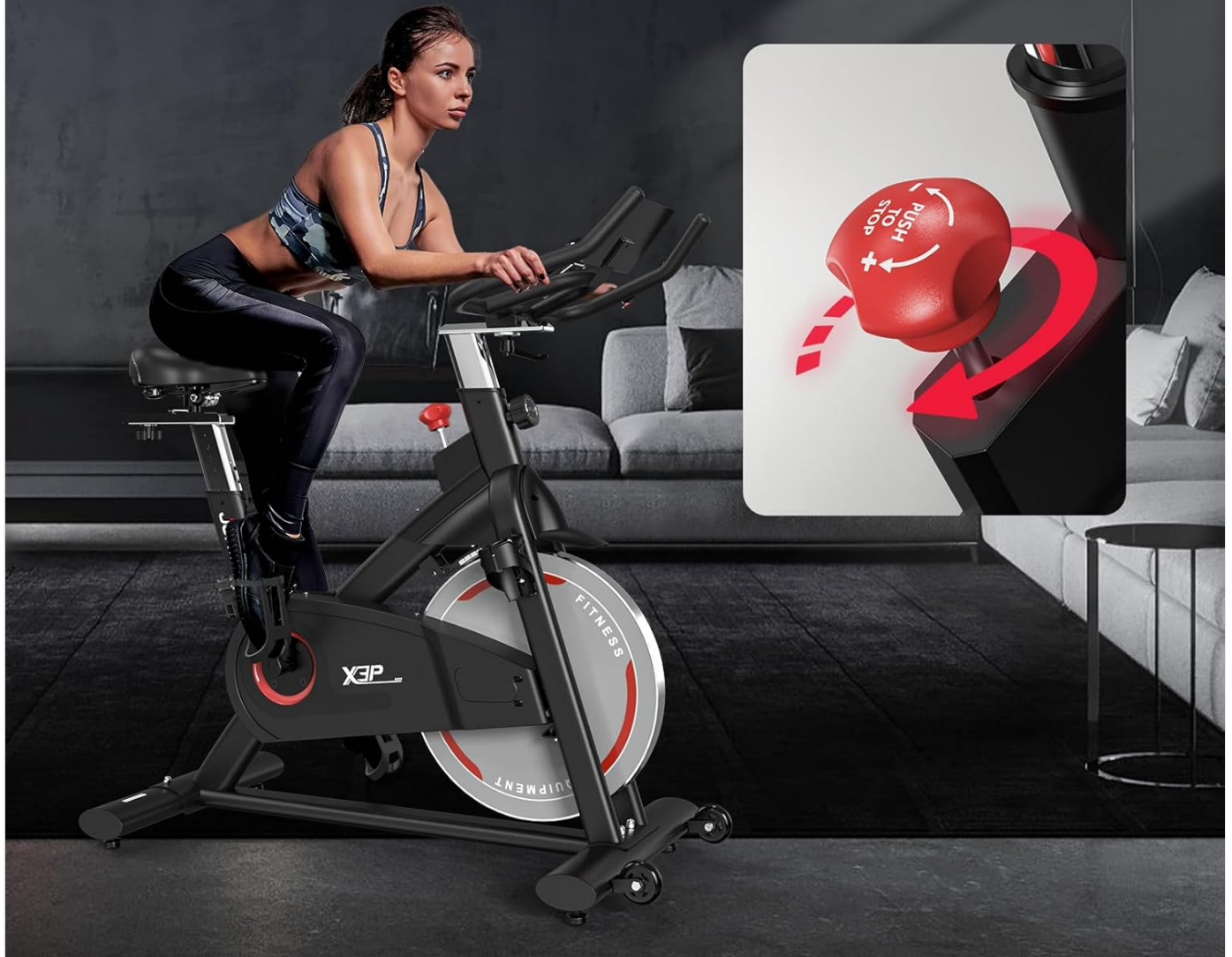
Image: Close-up of the micro-adjustable resistance knob and emergency stop feature.