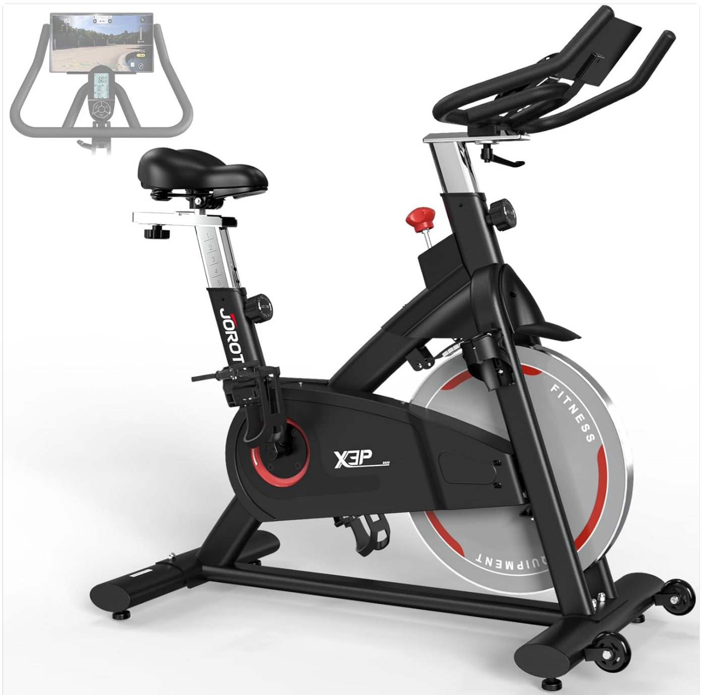
Image: Fully assembled JOROTO X3P Exercise Bike with tablet holder.