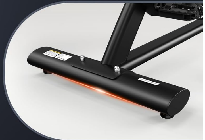
Image: Details on multi-grip handlebars, chrom-plating adjustable tube, and widened foot tube for stability.