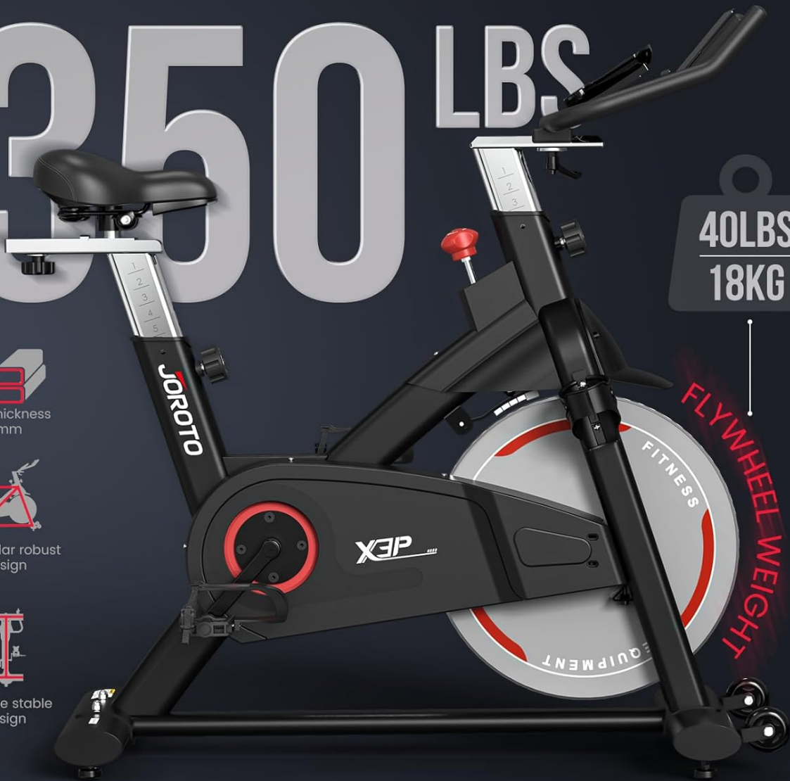
Image: Highlights the bike's stability, 350 lbs weight capacity, and 40 lbs flywheel weight.