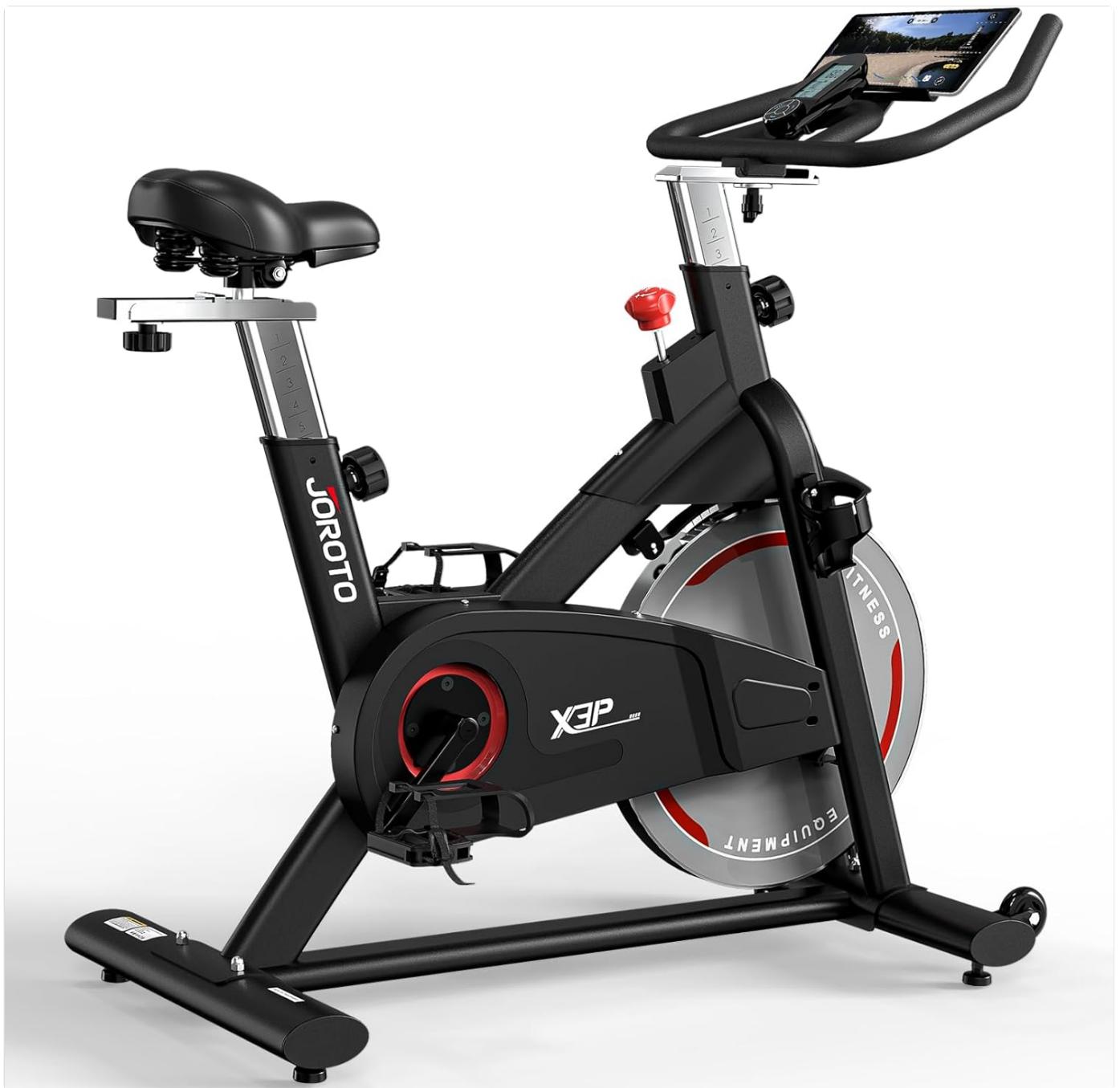
Image: Side view of the JOROTO X3P Exercise Bike.