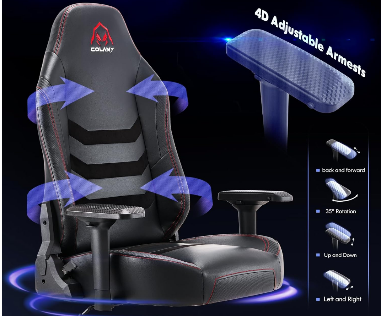
Image: Detailed view of the 4D adjustable armrests and their range of motion.