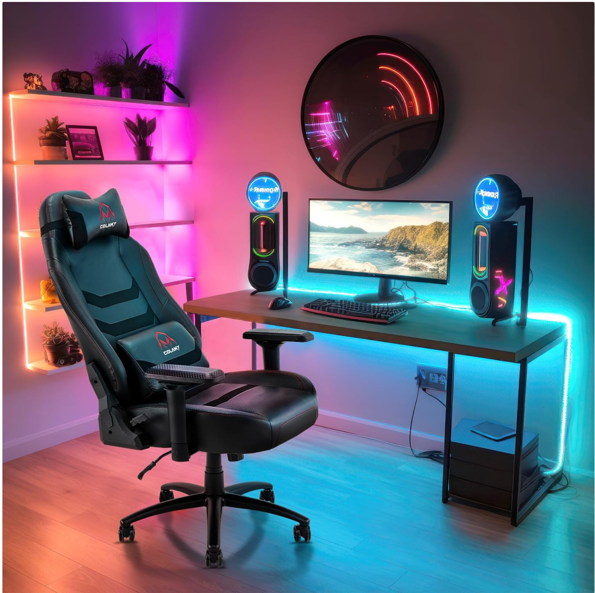
Image: Fully assembled COLAMY Gaming Chair in a typical gaming environment.