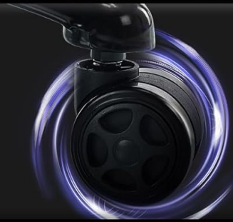
Image: Illustration of key components including the Class 4 gas cylinder, heavy-duty metal base, and scratch-free PU casters.