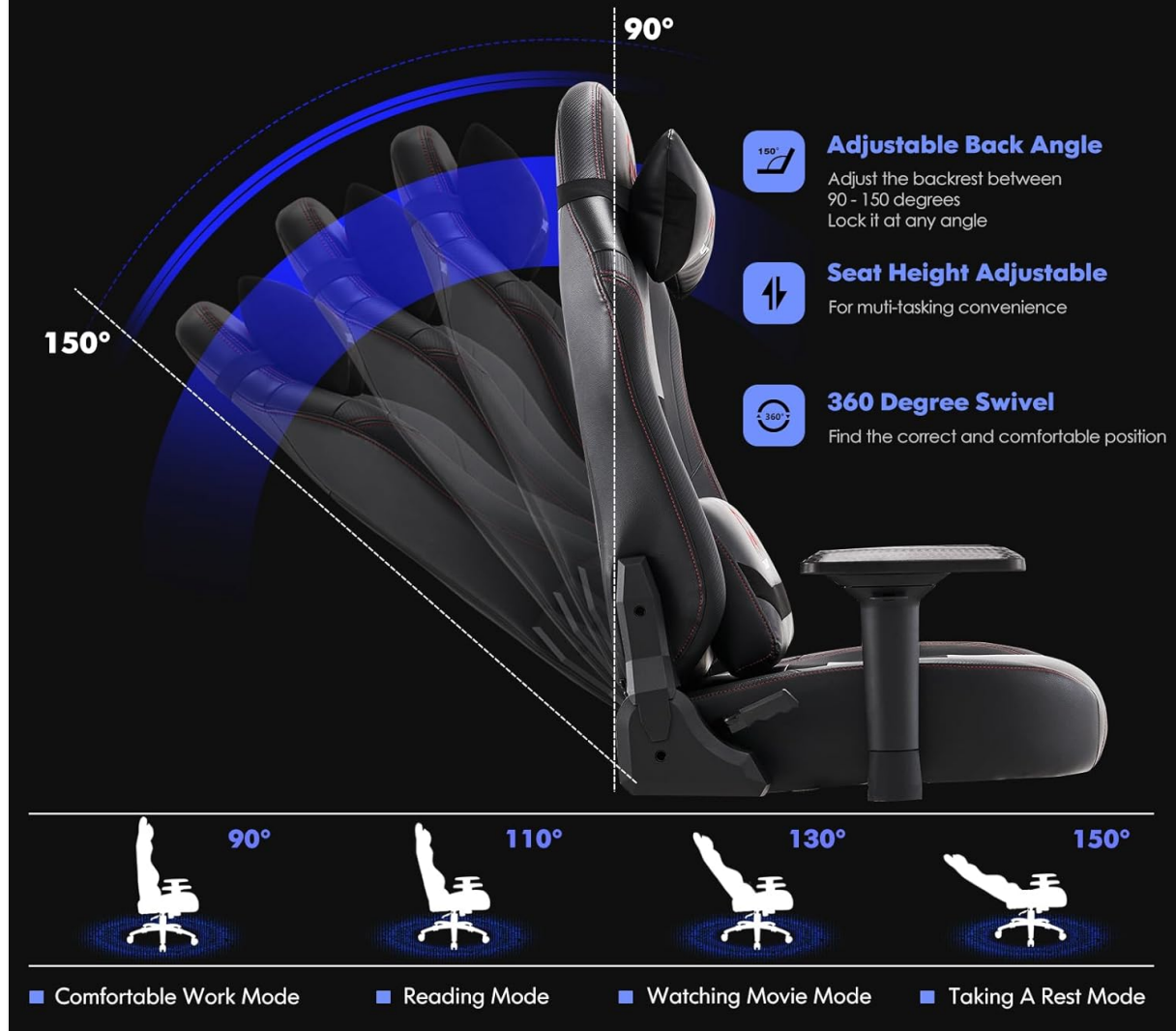
Image: Visual representation of seat height adjustment and recline angles (90-150 degrees).