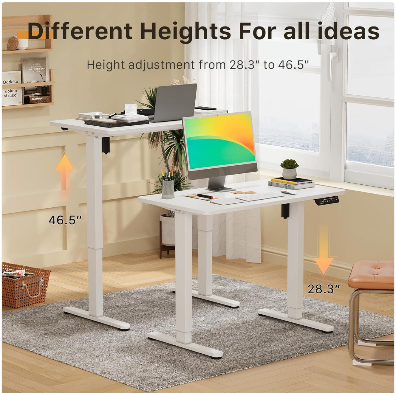
Image: Visual representation of the desk's height adjustment range, from 28.3 inches to 46.5 inches, suitable for various working postures.