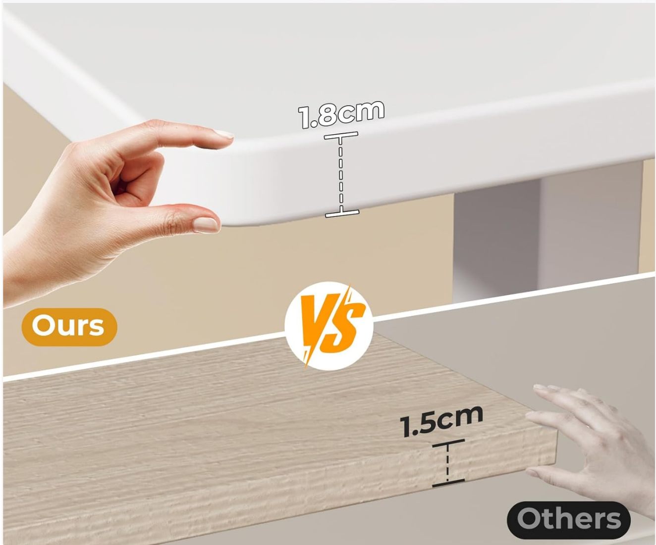
Image: Comparison showing the 20% thicker desktop of the JOY worker desk, contributing to increased durability, improved stability, and better aesthetics.

🛡️ Increased Durability 🏠 Improved Stability ❤️ Better Aesthetics