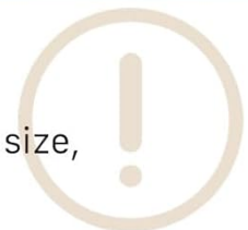
Image: Detailed dimensions of the JOY worker 35" x 20" Electric Standing Desk, showing its compact size and 176 lbs weight capacity.

The 40.9" refers to the box size, while the desk itself is 35".