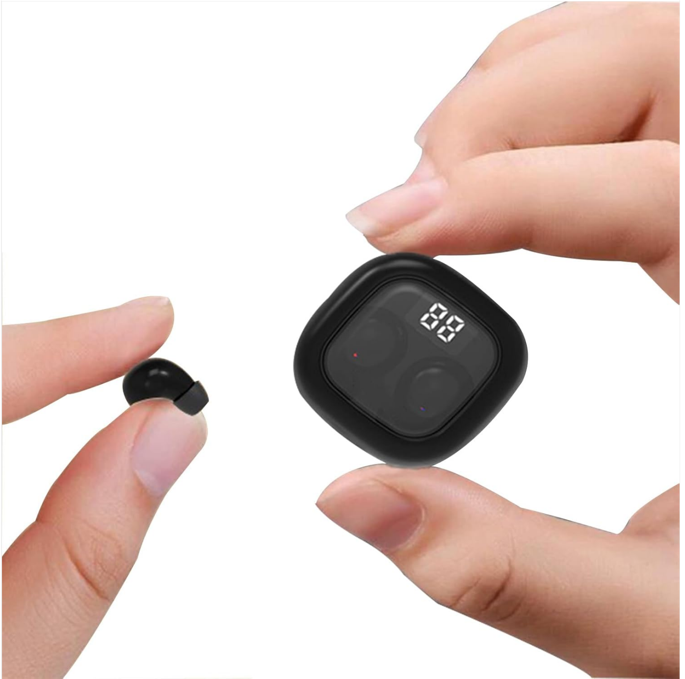
Figure 1: The Xmenha SK19 earbuds and their compact charging case.