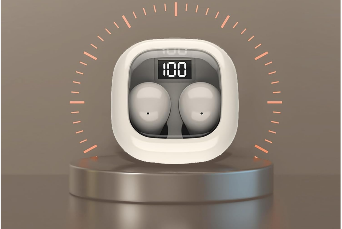
Figure 4: Battery life indicators for the earbuds and charging case.