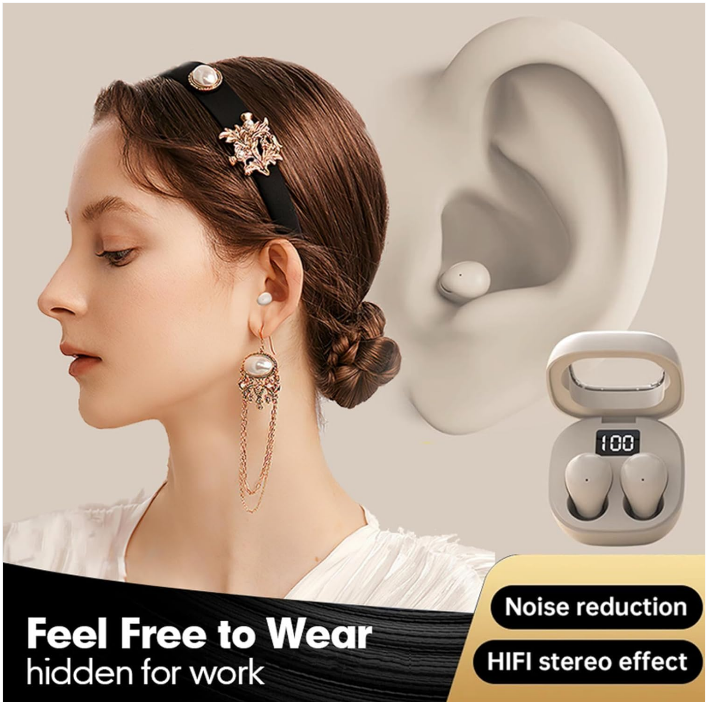
Figure 3: The discreet profile of the earbud when worn, making it hardly noticeable.