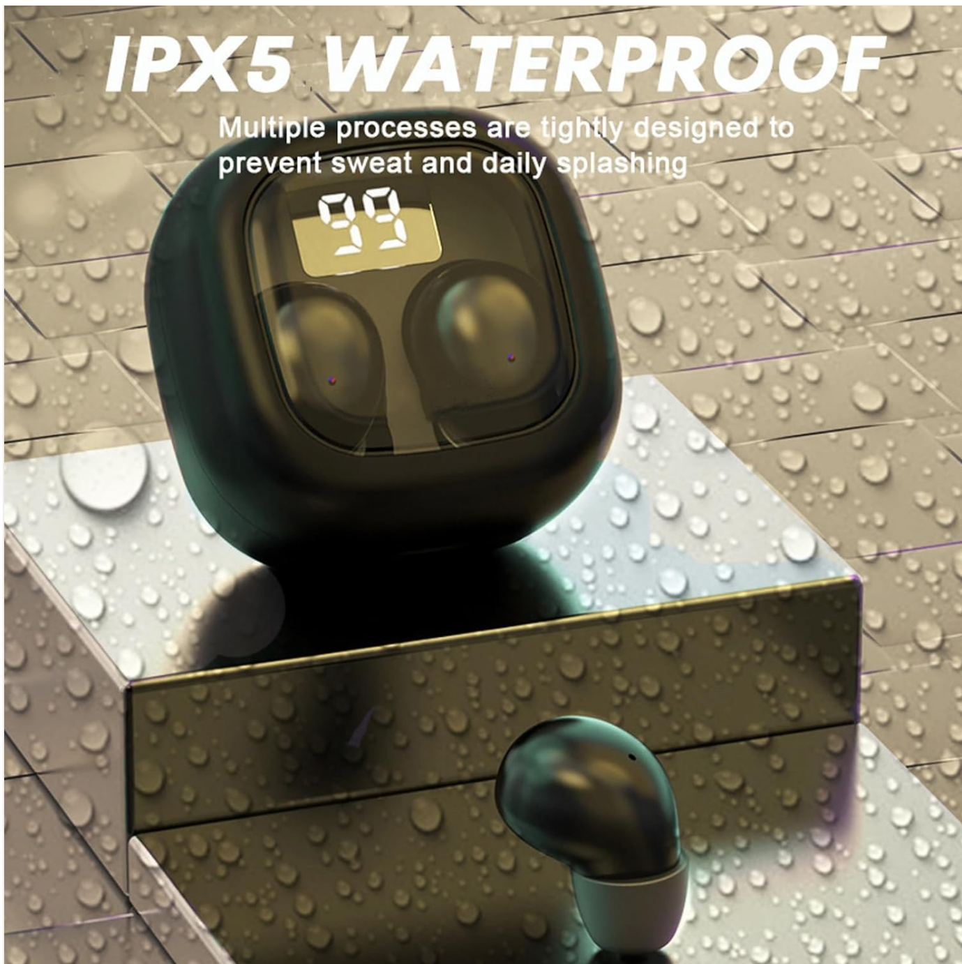
Figure 6: The IPX5 waterproof rating ensures protection against sweat and splashes.

Multiple processes are tightly designed to prevent sweat and daily splashing