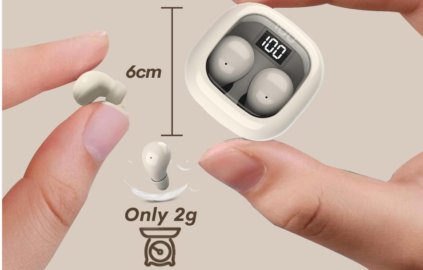
Figure 2: Illustration of the earbuds' small and lightweight design, highlighting their portability.

Extremely compact and portable, the earphones are lightweight and compact, making them almost unnoticed by people