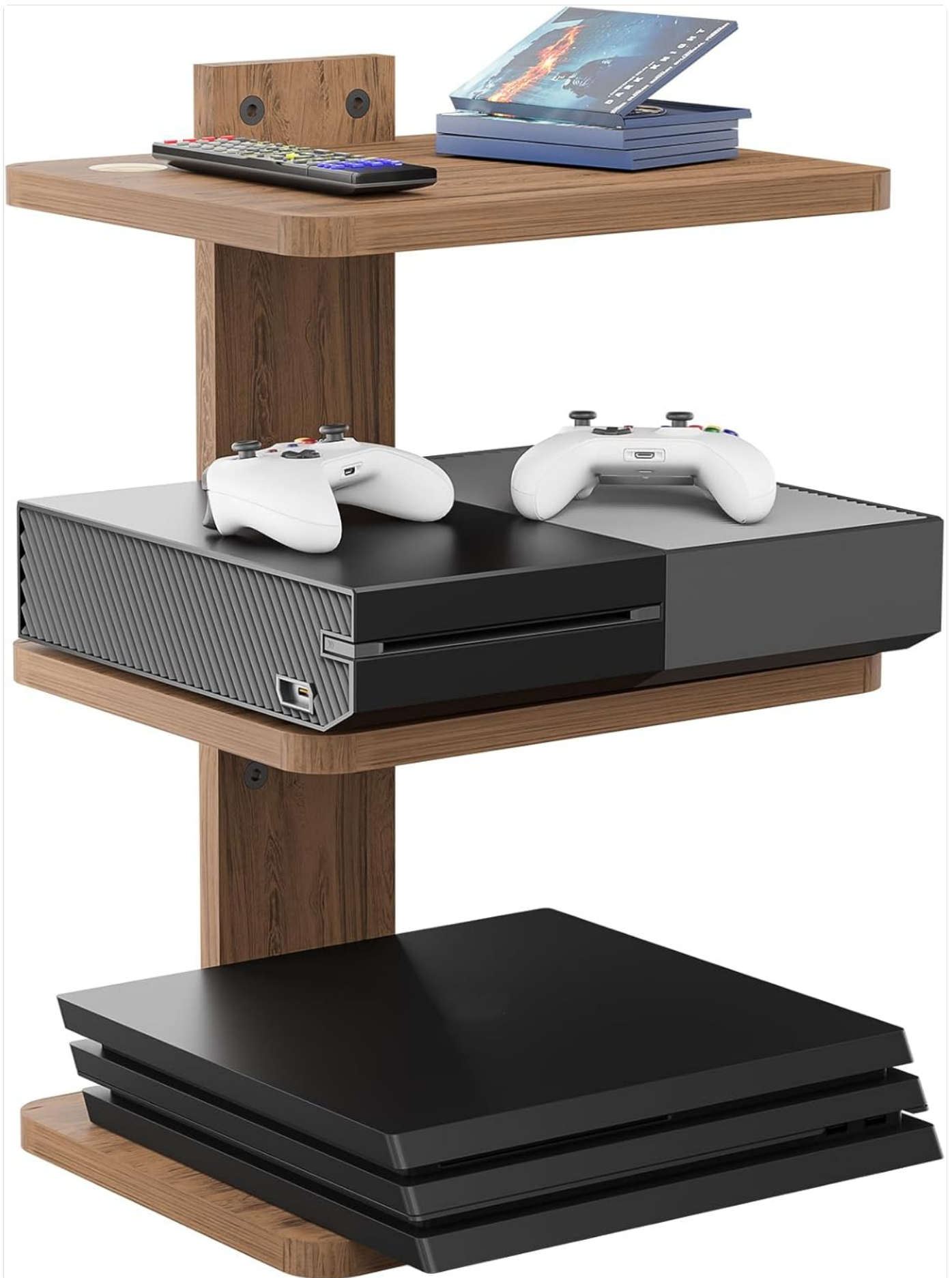
Image: The WALI 3-Shelf Floating TV Shelf, showcasing its capacity to hold various entertainment devices like gaming consoles and a remote control.

Each strengthened wooden shelf measures 13.8 x 11 inches and is 0.7 inches thick, capable of supporting a maximum weight of up to 10kg (22 lbs). The thoughtful design includes dual wire holes on both sides for efficient cable