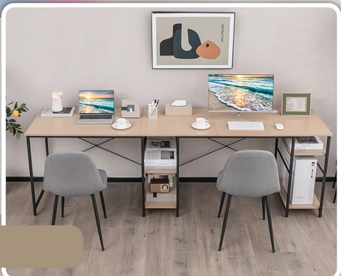
Figure 6.1: High-quality engineered wood for easy cleaning and durability.