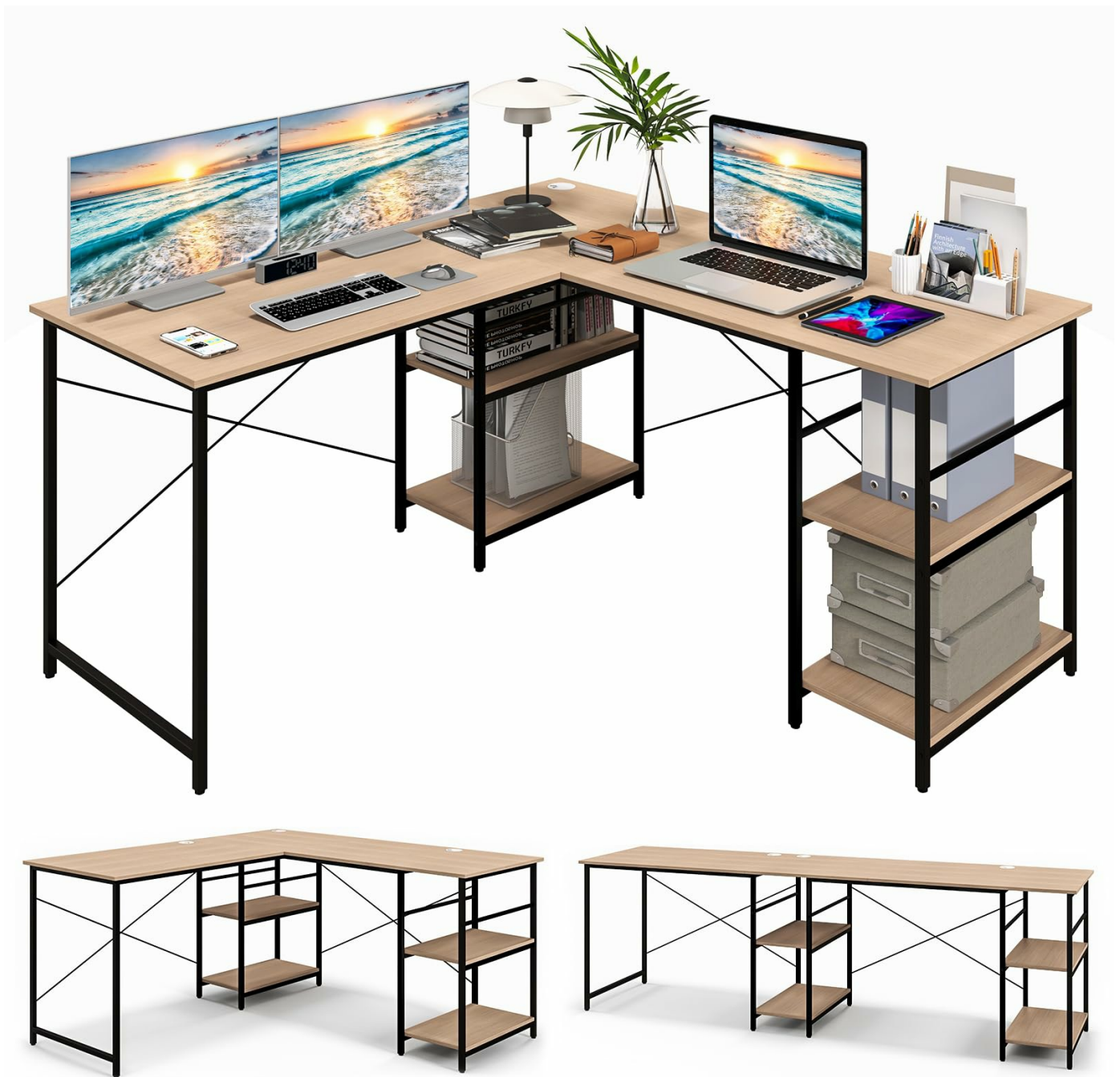
Figure 2.1: GOPLUS L-Shaped Desk in a natural finish, showcasing its design in a home office setting.