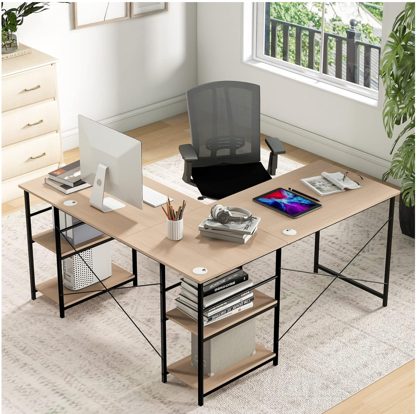
Figure 3.1: Product dimensions and weight capacity.