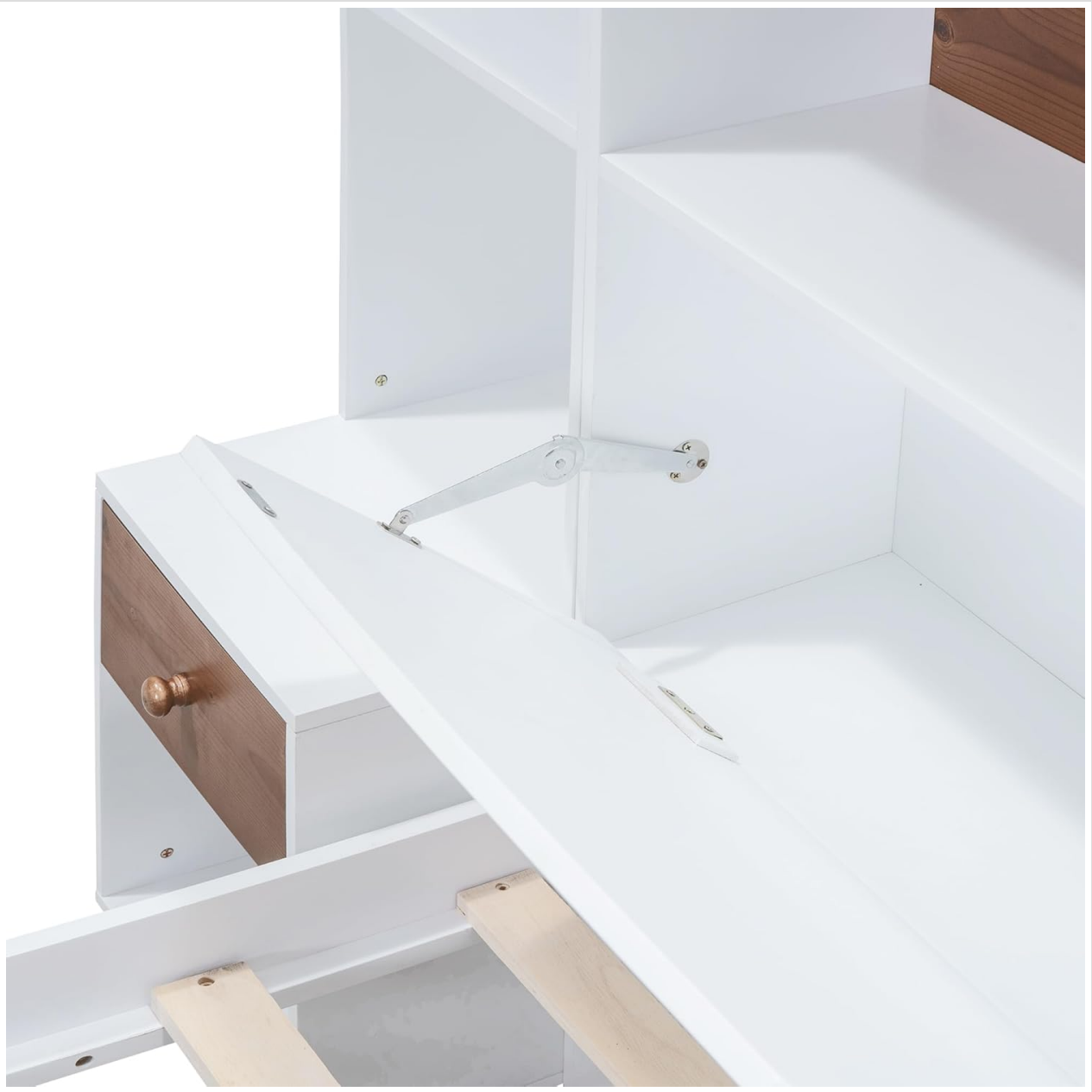
Image: Close-up view of the headboard's flip-top storage compartment, showing the opening mechanism.