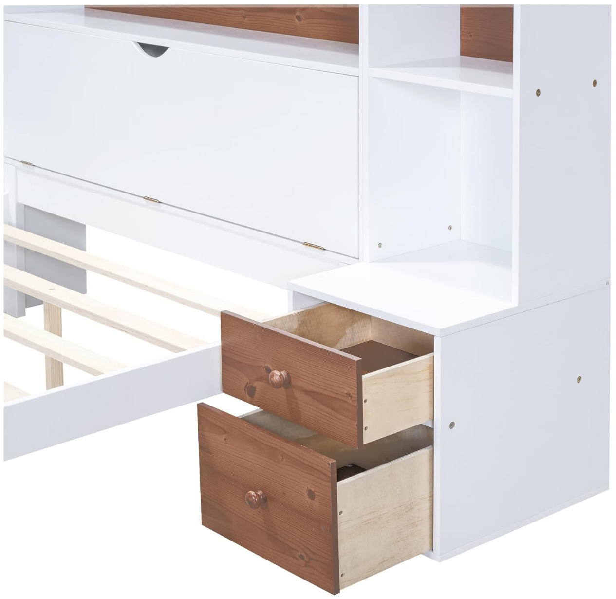
Image: Close-up view of the nightstand drawers, showing their construction and capacity.