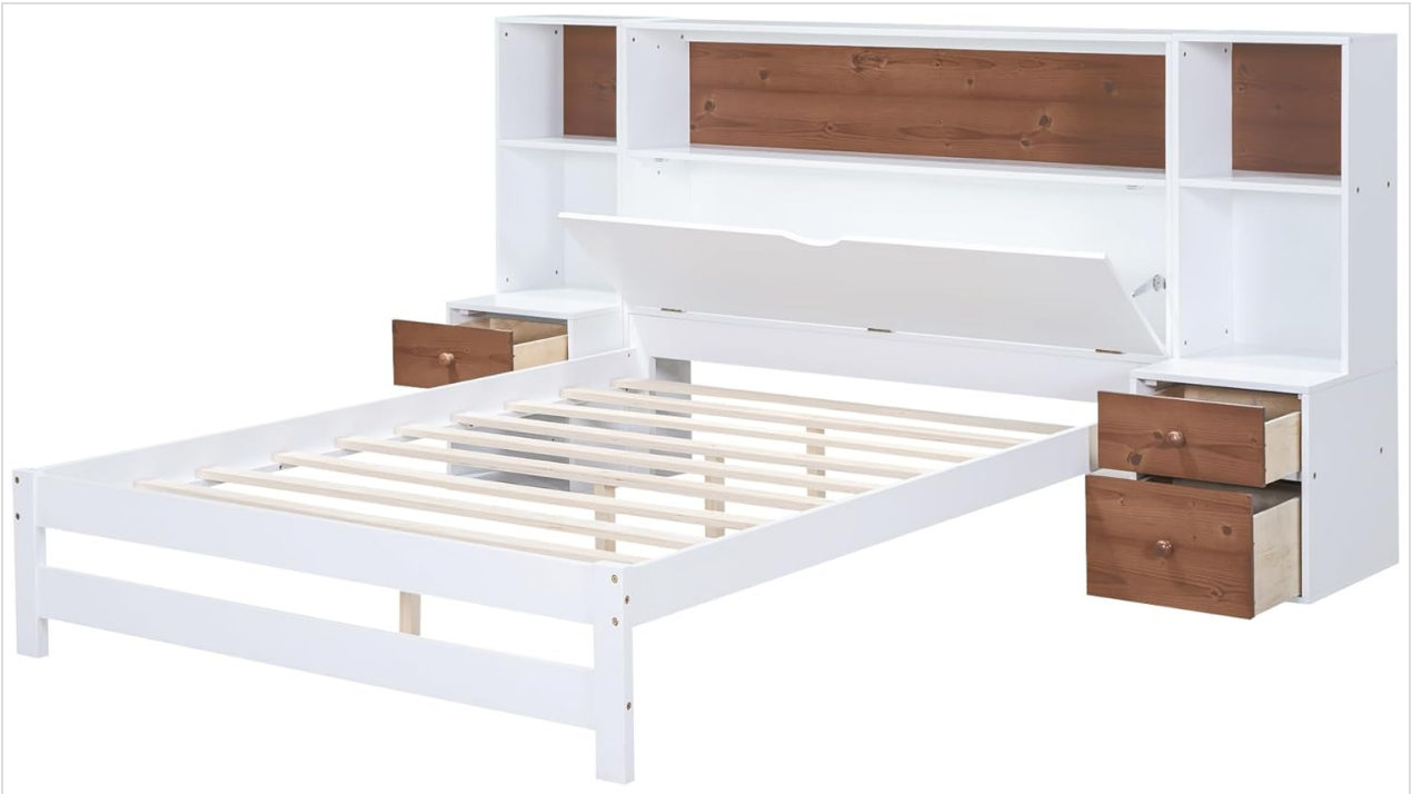
Image: The bed frame with wooden slats installed, illustrating the foundation for the mattress.