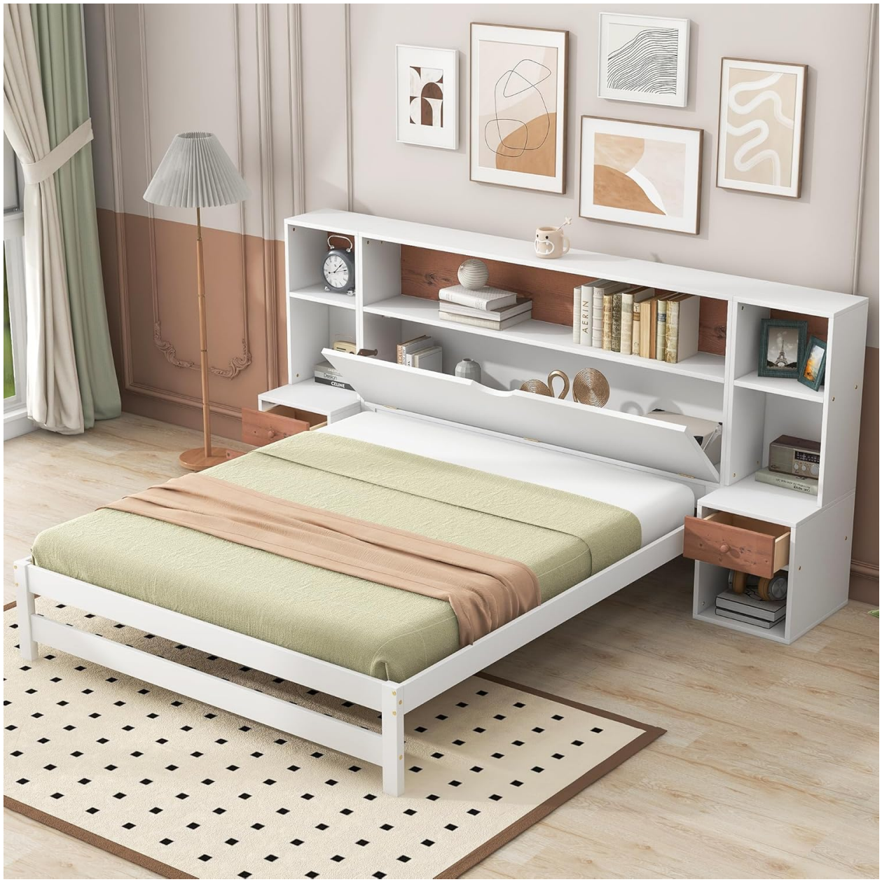
Image: Fully assembled Full Size Captain Bed, showcasing the integrated headboard with shelves and nightstands.