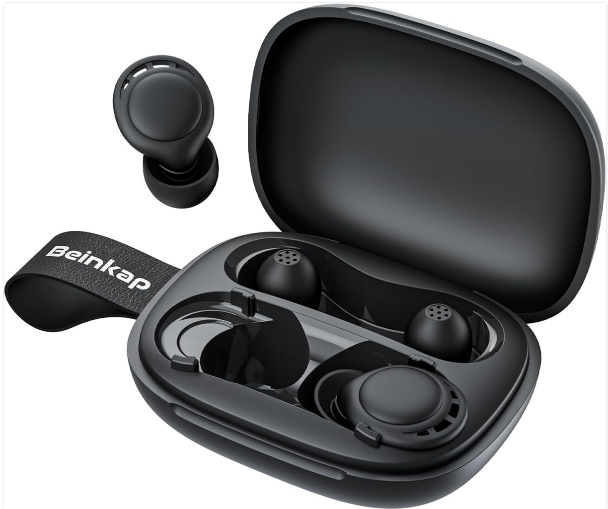
Image: Beinkap NC06 Noise Reduction Earplugs shown with their open storage case, displaying the earplug bodies and the various ear tip options. This image illustrates the complete product package.