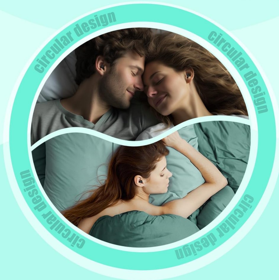
Image: An illustration showing individuals sleeping comfortably with Beinkap NC06 earplugs. The image highlights the circular design of the earplugs, indicating they are suitable for side sleepers without causing ear pressure.