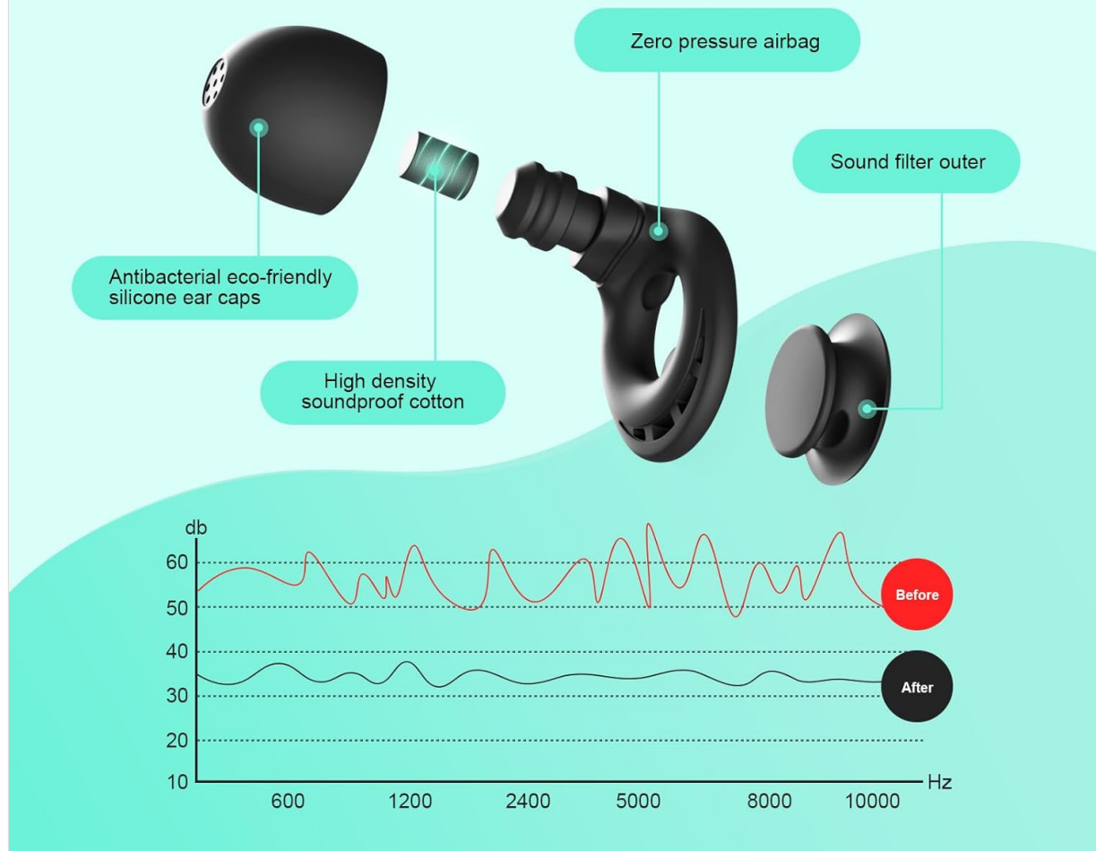
Image: An exploded diagram of the Beinkap NC06 earplug, highlighting its innovative acoustic structure including zero pressure airbag, sound filter outer, antibacterial eco-friendly silicone ear caps, and high-density soundproof cotton. Below the diagram, a graph illustrates the noise reduction effect, showing sound levels before and after using the earplugs.