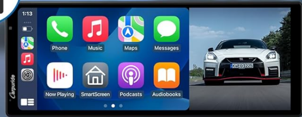
Apple Carplay + Camera