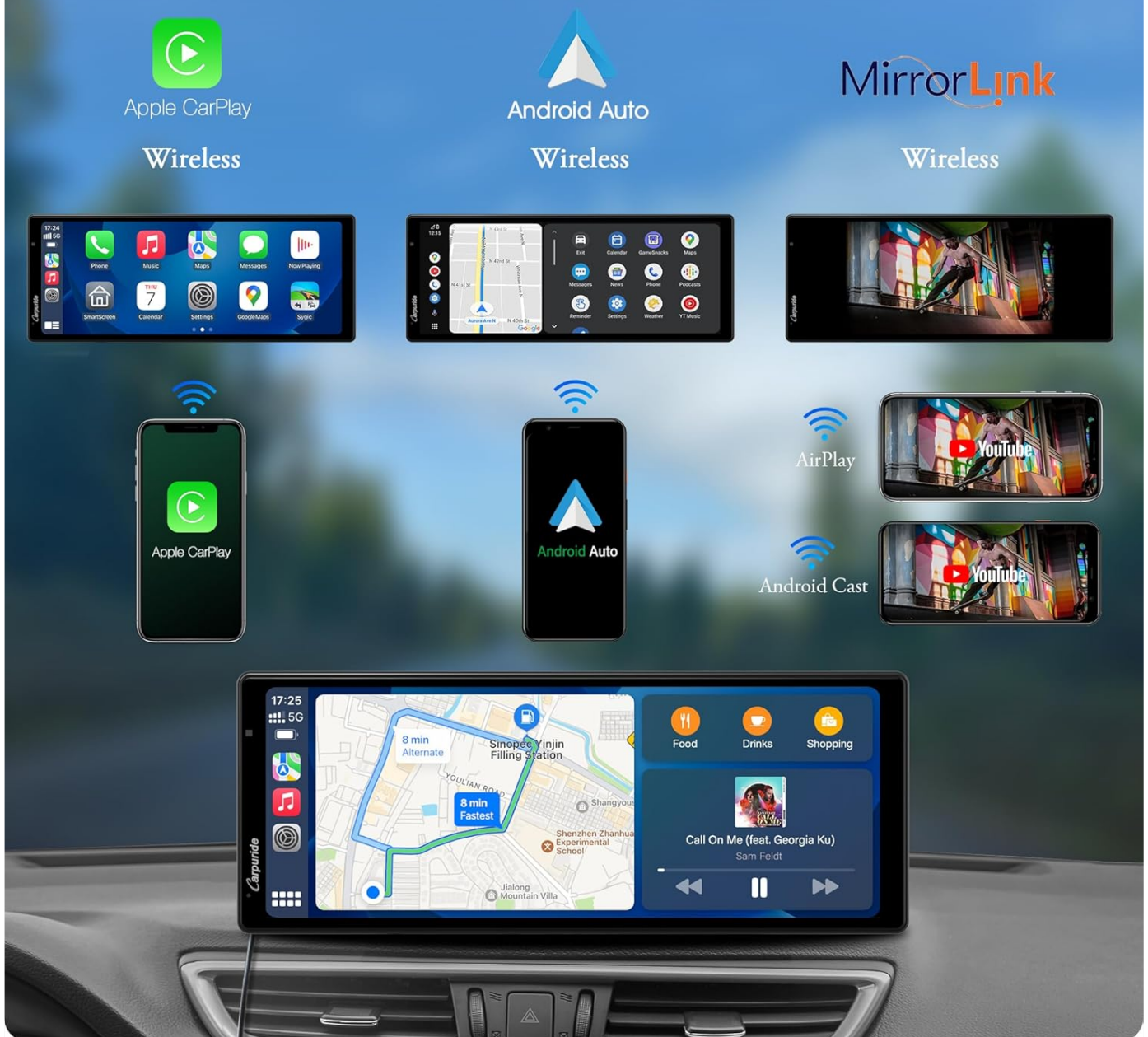
Figure 5.1: Wireless CarPlay, Android Auto, and Mirror Link