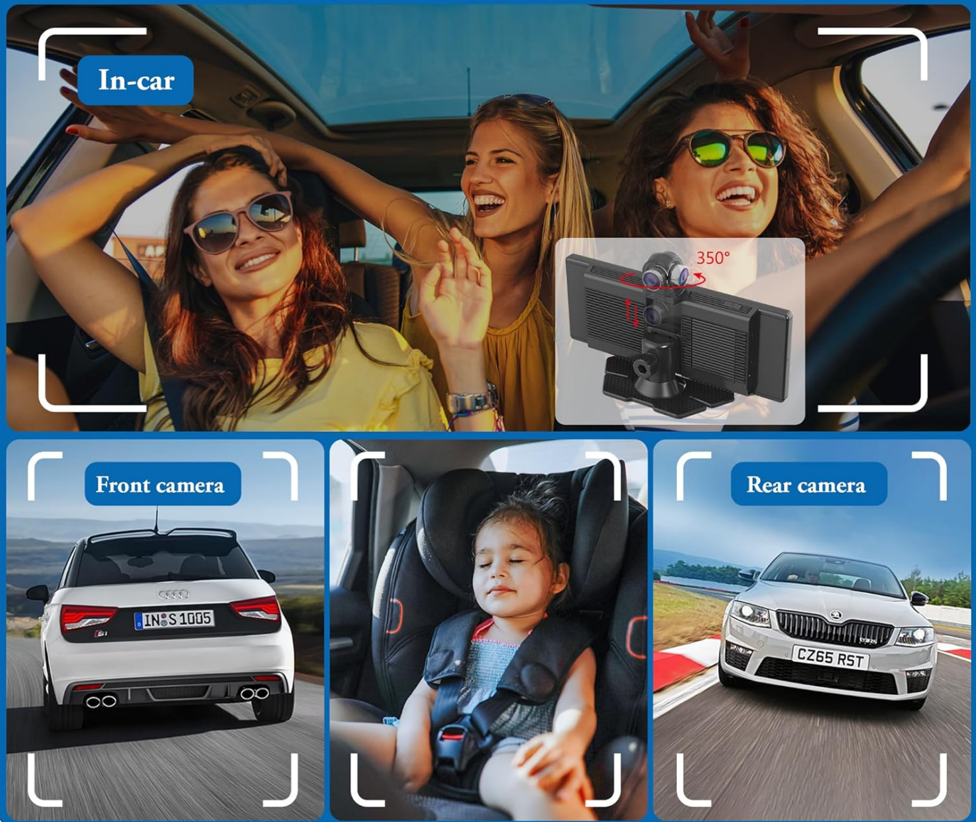
Figure 5.8: Rotating Front Camera

Multiple different uses, not only as a driving recorder, but also as an in car camera, always caring for the safety of the baby in the back seat