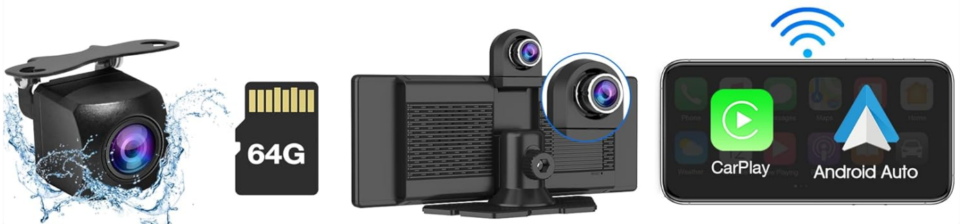
Figure 1.1: CARPURIDE W903 Portable Touchscreen System