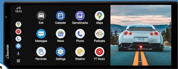
Android Auto + Camera