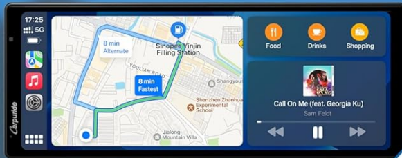
Navigation + Music

Equipped with 1080P HD front and rear camera & 64G TF card