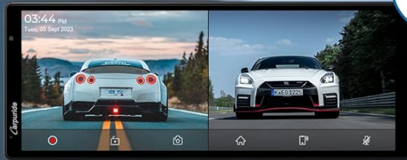
Front Camera + Rear Camera