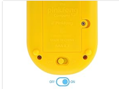
Figure 2: On/Off switch location.

After installing the batteries, locate the On/Off switch on the back of the smart phone toy. Slide the switch to the "On" position to activate the toy.