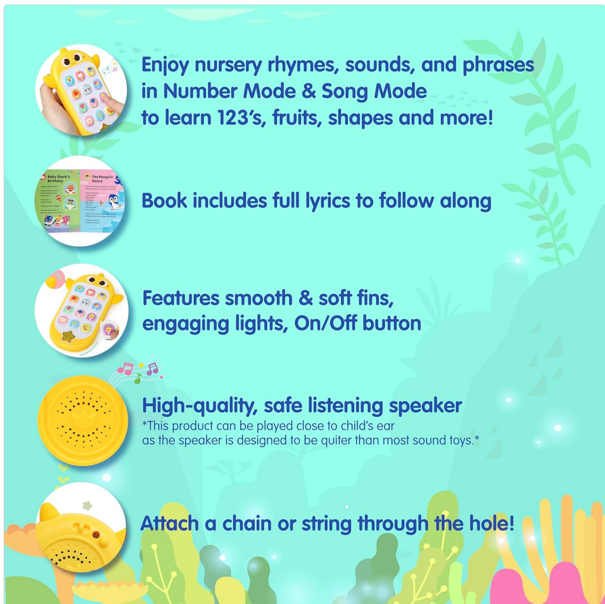
Figure 5: Additional toy features.

Description: This image focuses on specific design elements of the Baby Shark smart phone toy, including its soft fins, the speaker grille, and a small hole for attaching a chain or string, illustrating its child-friendly and portable design.