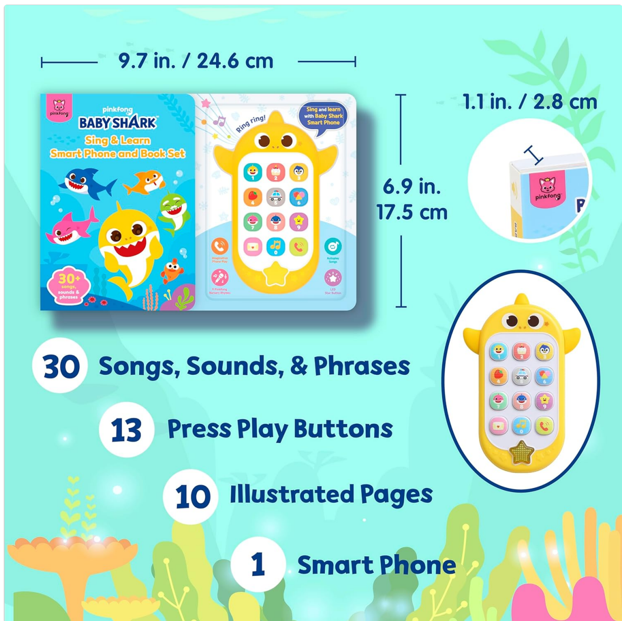
Figure 6: Product dimensions.

Description: This image illustrates the key dimensions of the Pinkfong Baby Shark Sing & Learn Smart Phone and Book Set, including the length, width, and height of both the book and the smart phone toy, providing a clear visual reference for its size.