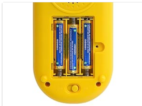
Figure 1: Battery compartment with three AAA batteries.