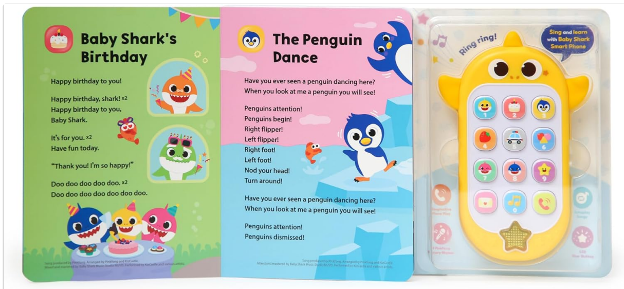
Figure 4: Smart phone and lyrics book.

Description: This image displays the yellow Baby Shark smart phone toy next to the colorful lyrics book. The book is open to show some of the song lyrics, demonstrating how the two components work together for an enhanced learning experience.