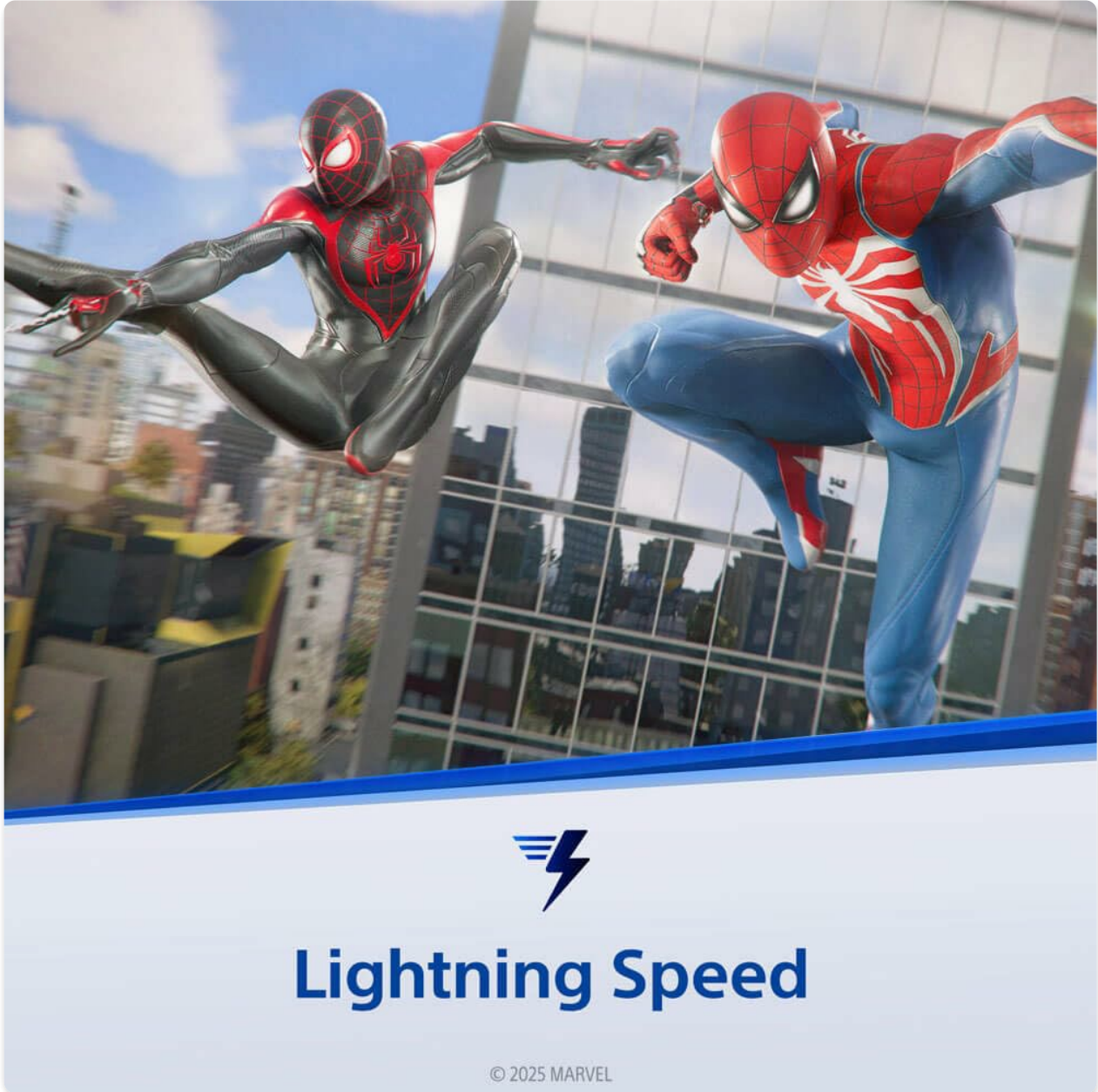
Image: Visual representation of stunning game graphics.