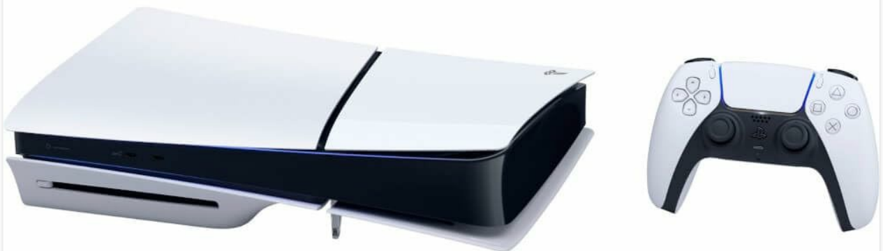
Image: PlayStation 5 Slim console and DualSense controller in horizontal orientation.