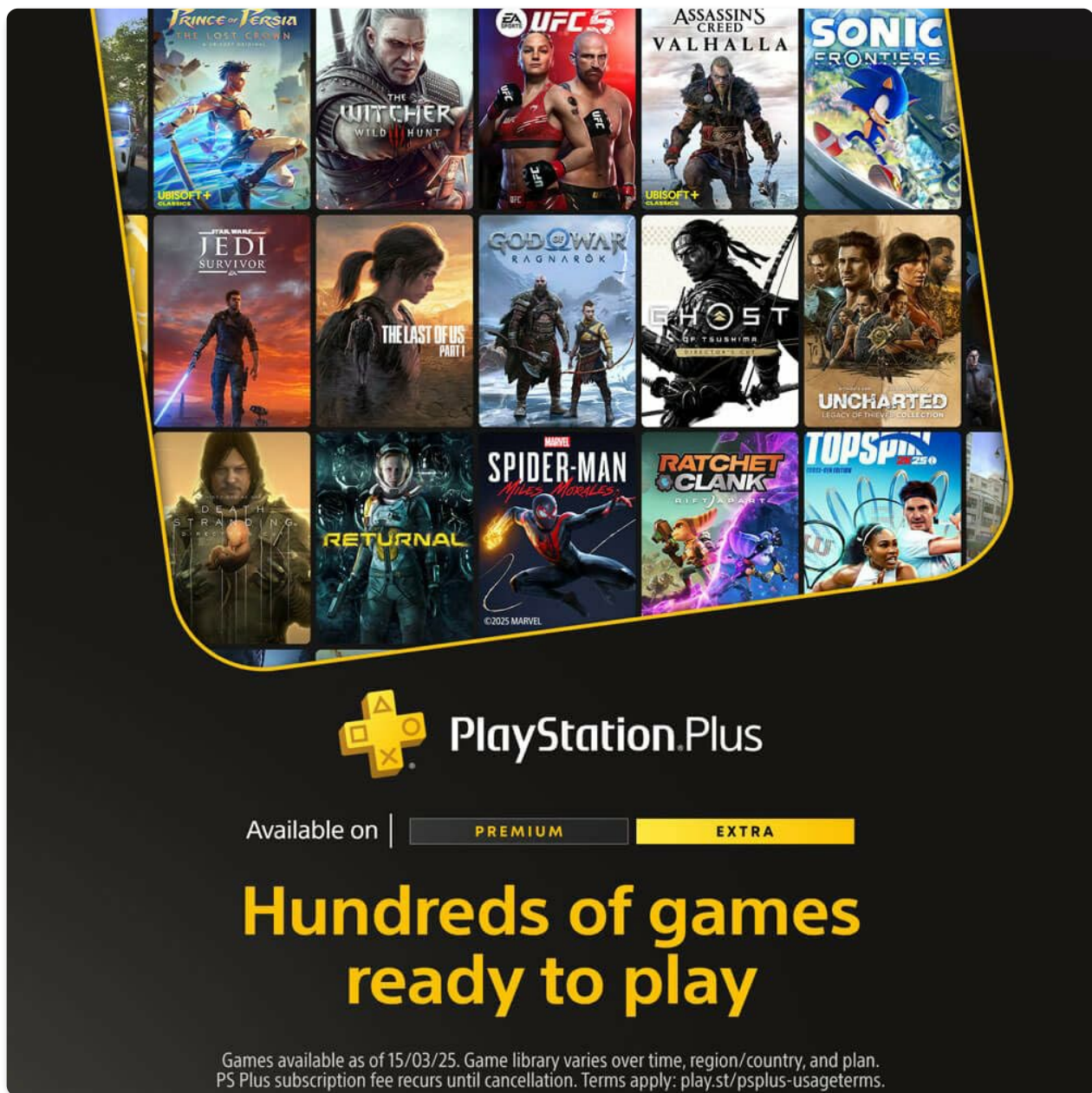
Image: Visual representation of immersive gaming experience.