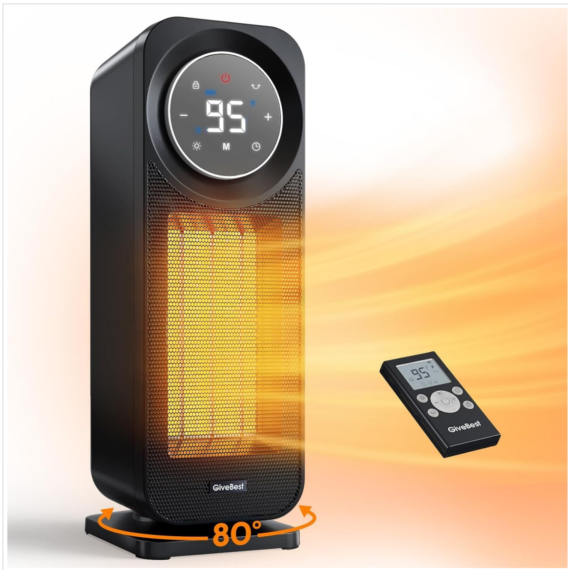
Image 1: GiveBest GB-KPT-40 Touch Panel Space Heater with its remote control, highlighting its 80-degree oscillation capability.