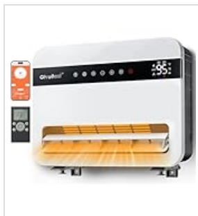
Image 7: The remote control features an LCD screen for easy viewing of settings and dedicated buttons for all heater functions.

The remote requires 2x AAA batteries (not included).