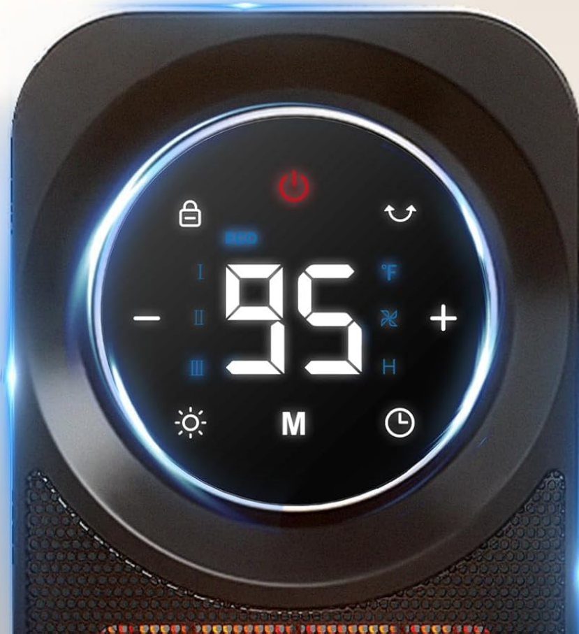
Image 3: Close-up of the heater's touch panel, illustrating the various control icons for easy operation.