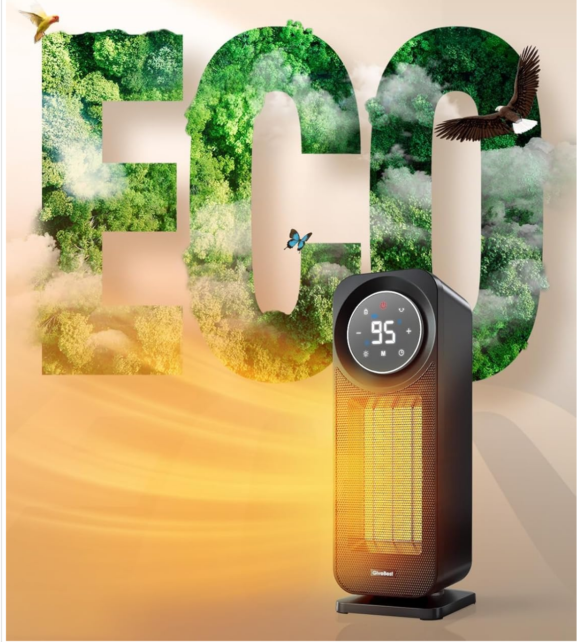
Image 5: The heater operating in ECO mode, designed for energy efficiency by maintaining a consistent room temperature.

ECO mode, Enjoy same warmness with less spending