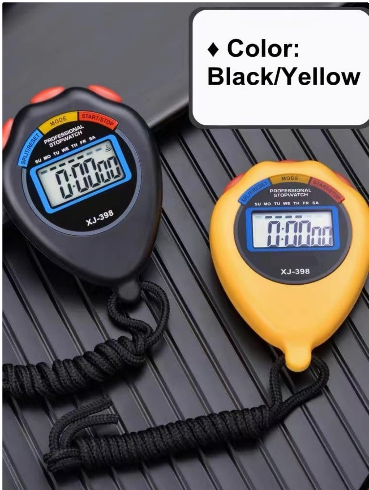
Figure 2: The Generic SW-XJ-398 Stopwatch is available in multiple colors, such as black and yellow, both featuring the same button layout and digital display for consistent operation.