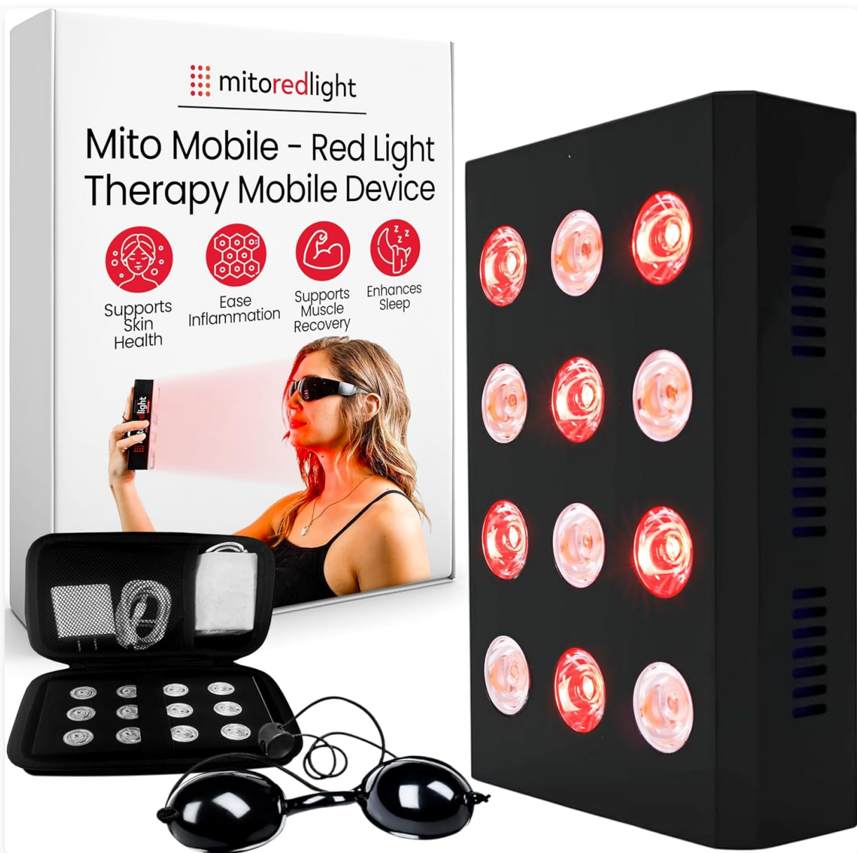
Figure 1: Mito Mobile Red Light Panel and included accessories.