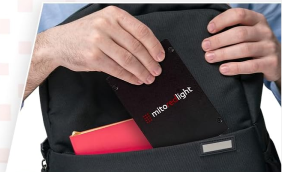
Figure 4: Device dimensions and portability.