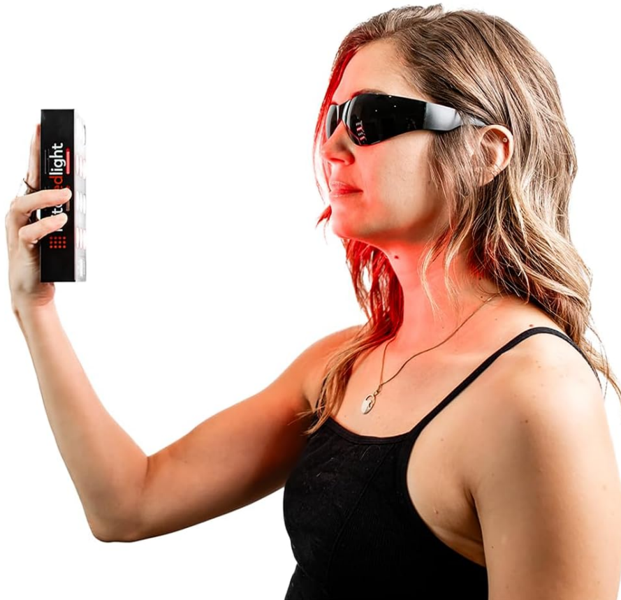
Figure 2: Illustrative use of the Mito Mobile for health and wellness benefits.

Promotes tissue repair, and a healthy inflammatory response.