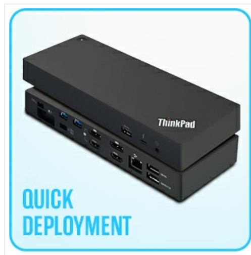
Image: Quick Deployment feature, indicating easy setup.