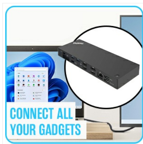
Image: Connect all your gadgets for an expanded workspace.