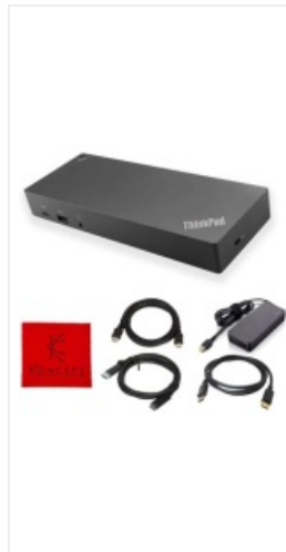
Image: Front view of the docking station with labeled ports.