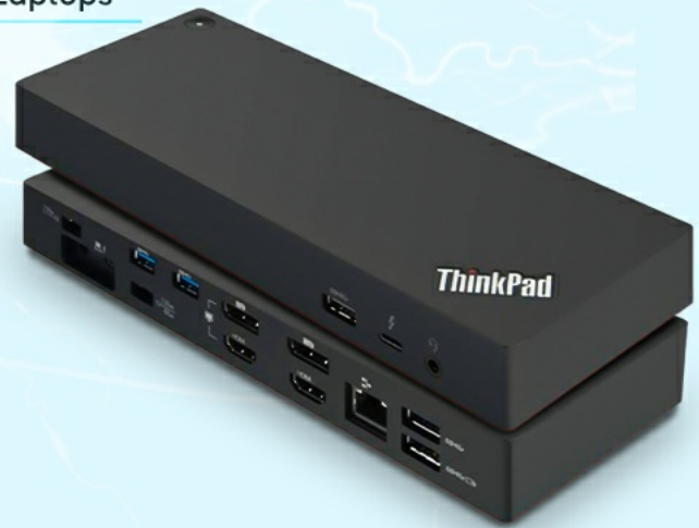
Image: Overview of the Thunderbolt 3 Dock Gen 2's key features.