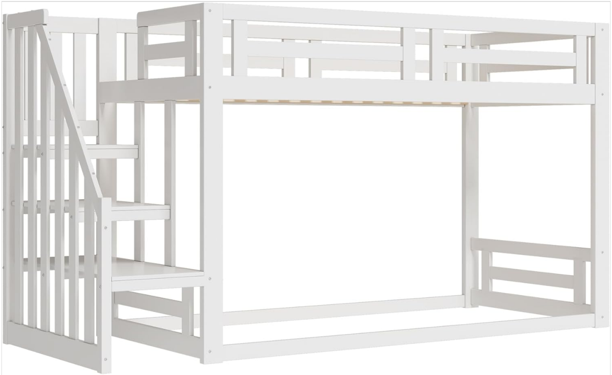
Figure 5.1: Side view illustrating the integrated ladder and the spacious, open design of the lower bunk.