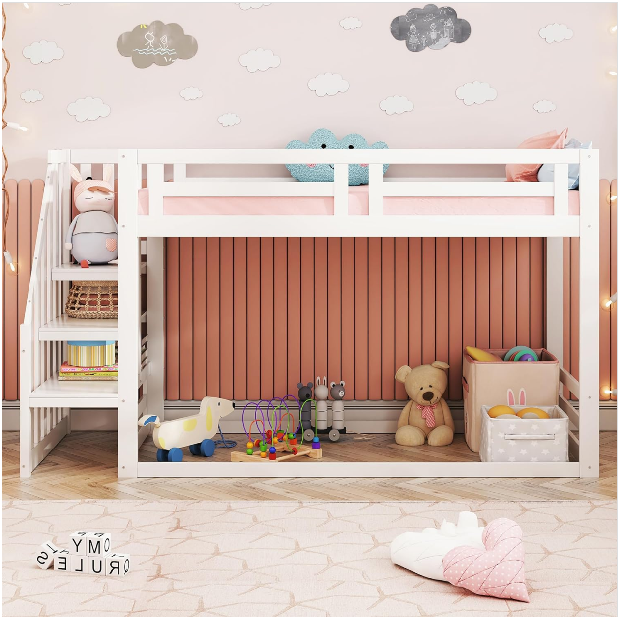
Figure 4.1: Assembled Moimhear Low Bunk Bed in a room setting, showcasing its design and integrated ladder with storage.