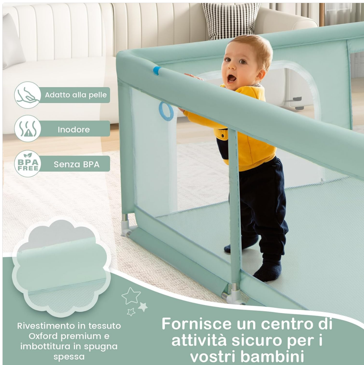
Image: A baby safely playing inside the assembled playpen, demonstrating the secure and comfortable environment.