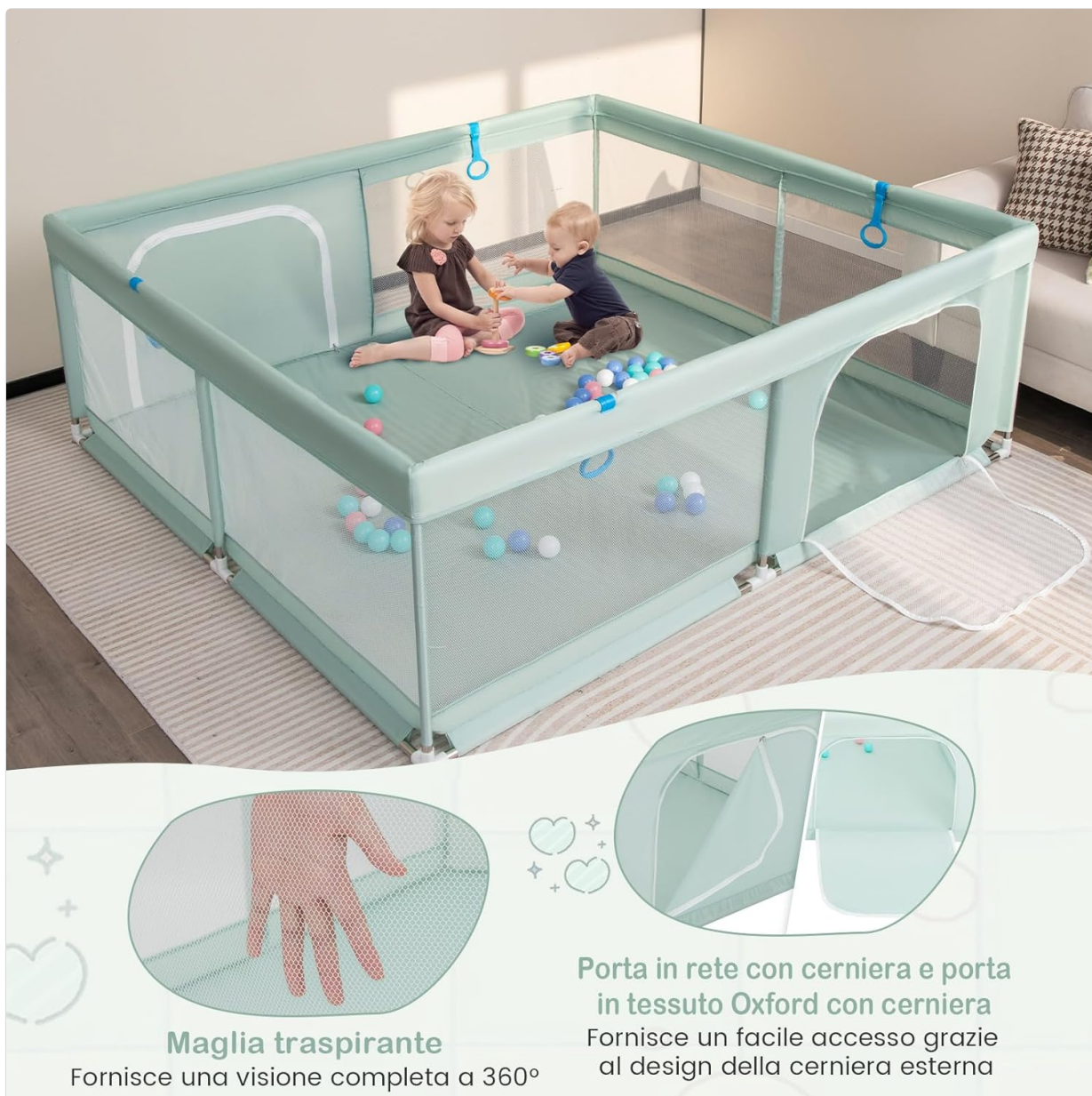
Image: Two children playing inside the playpen, illustrating the transparent mesh for visibility and the external zipper door.