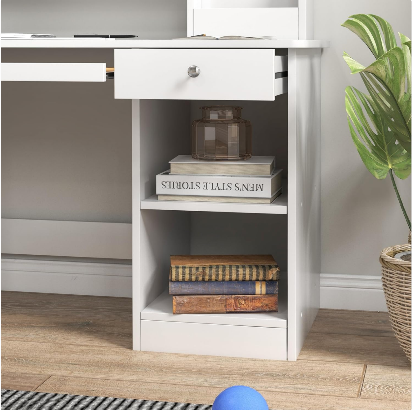
Figure 3: Overview of storage features.