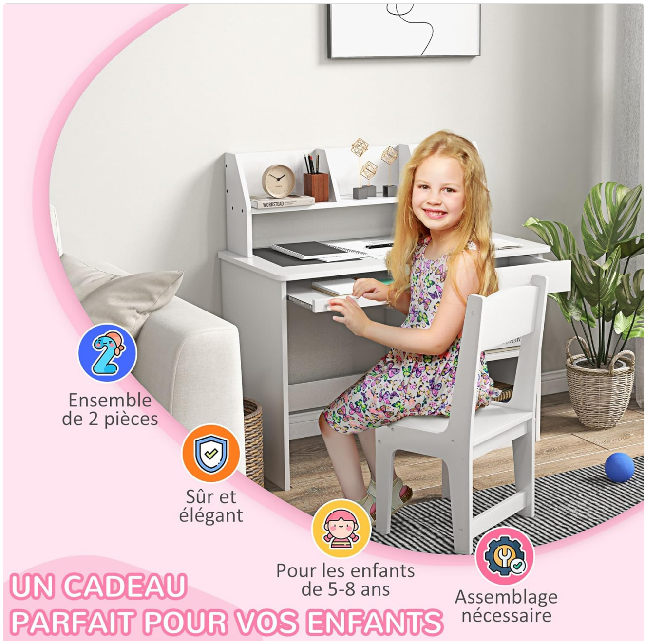
Figure 5: Multi-functional use of the desk and chair set.