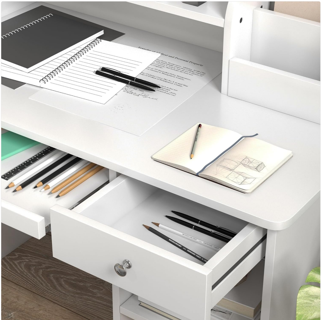
Figure 4: Detail of the sliding tray and drawer.