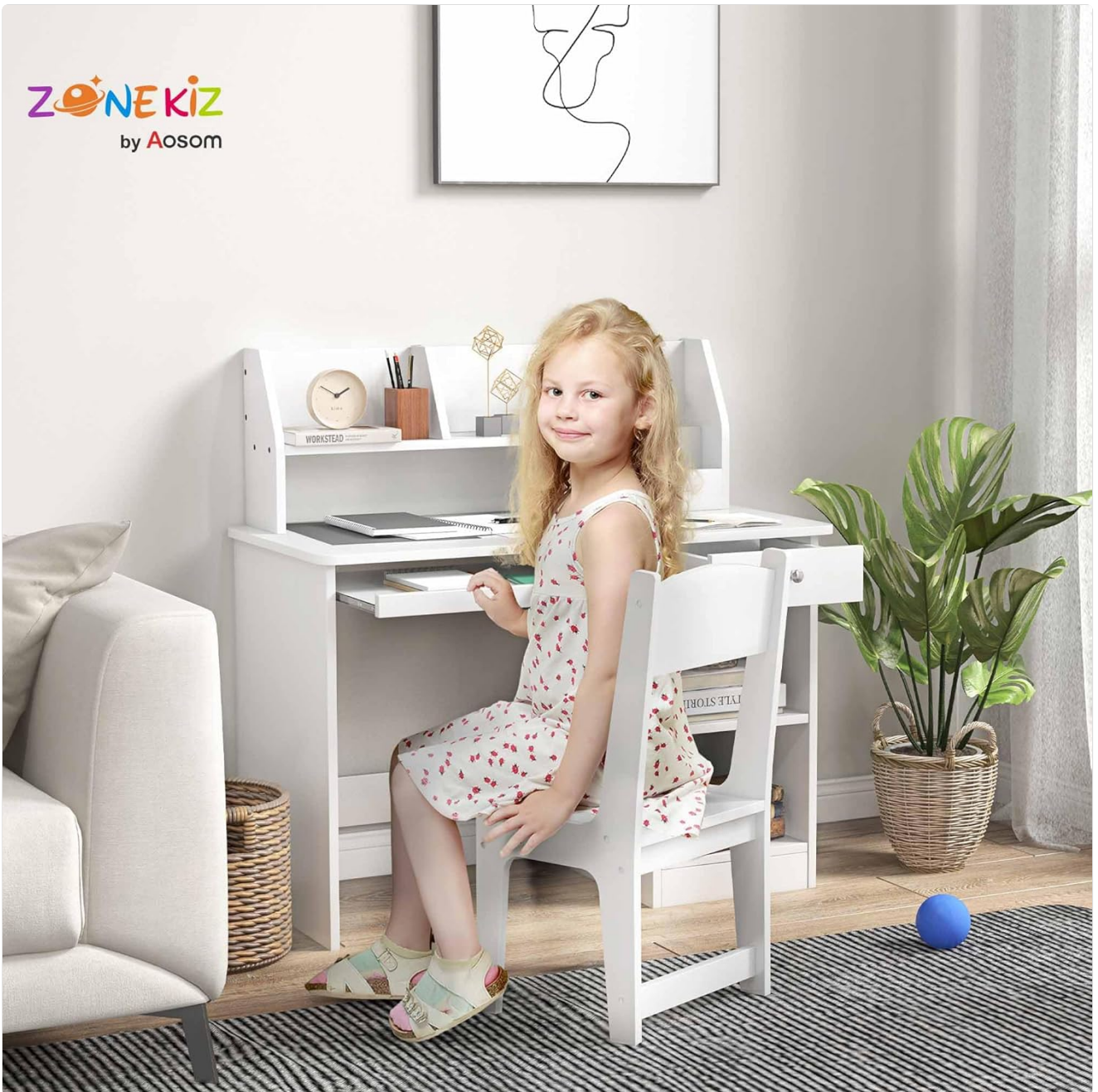
Figure 1: Complete ZONEKIZ Children's Desk and Chair Set.