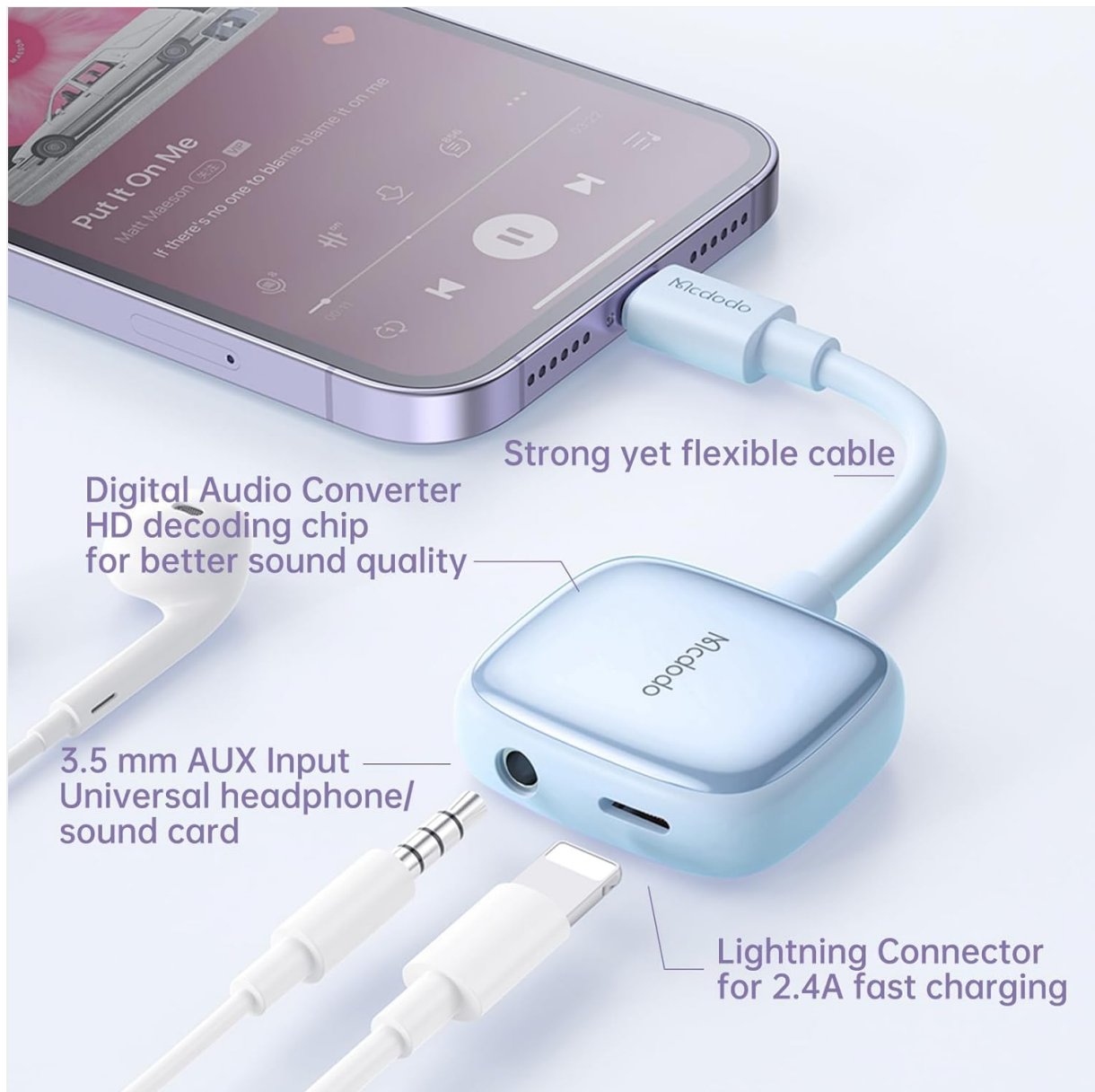
Image: A close-up view of the mcdodo 2-in-1 adapter, highlighting the 3.5mm AUX input for headphones/sound cards and the Lightning connector for 2.4A fast charging.