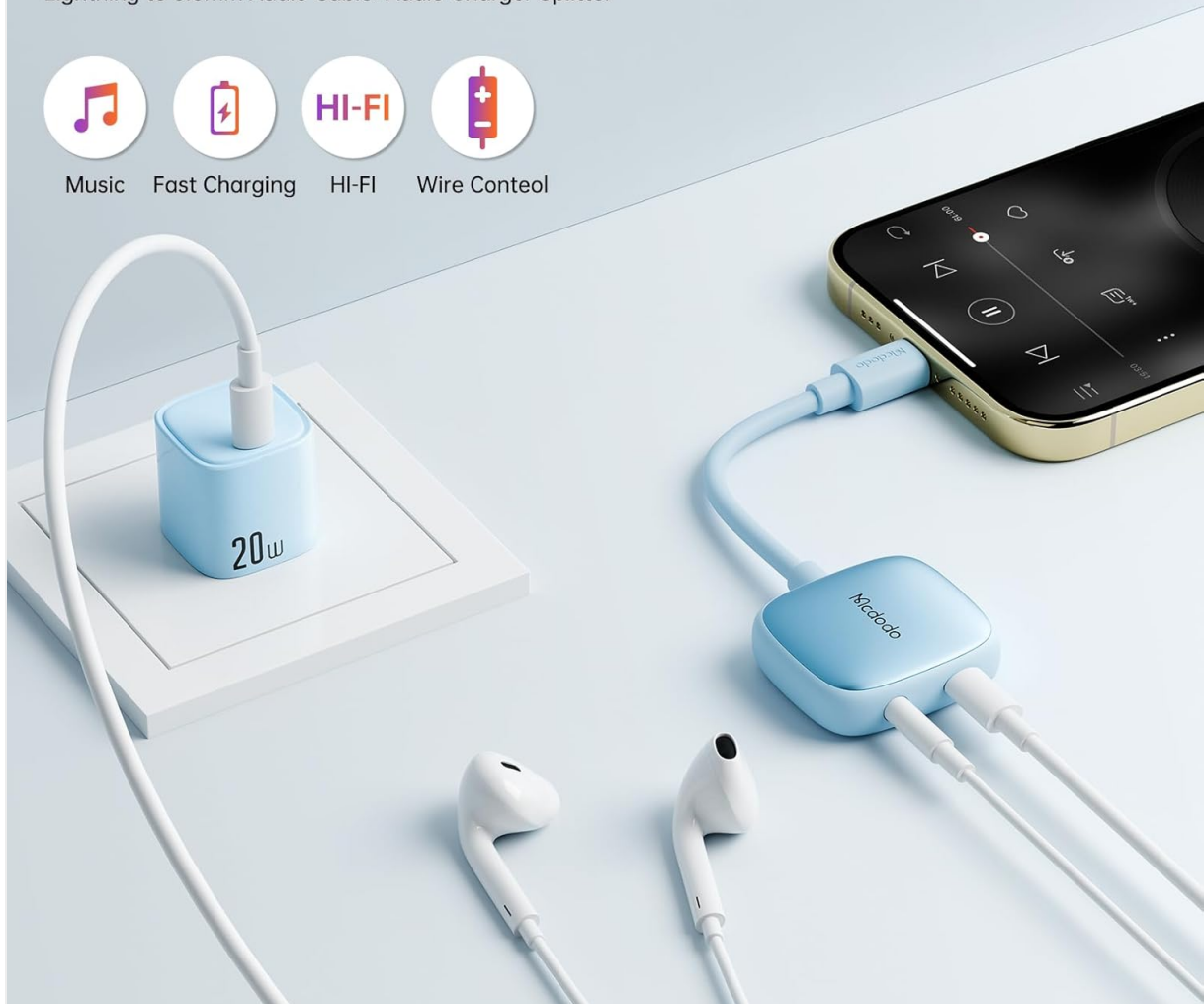
Image: The mcdodo 2-in-1 adapter connected to an iPhone, with headphones plugged into the 3.5mm jack and a charging cable connected to the Lightning port, demonstrating simultaneous use.