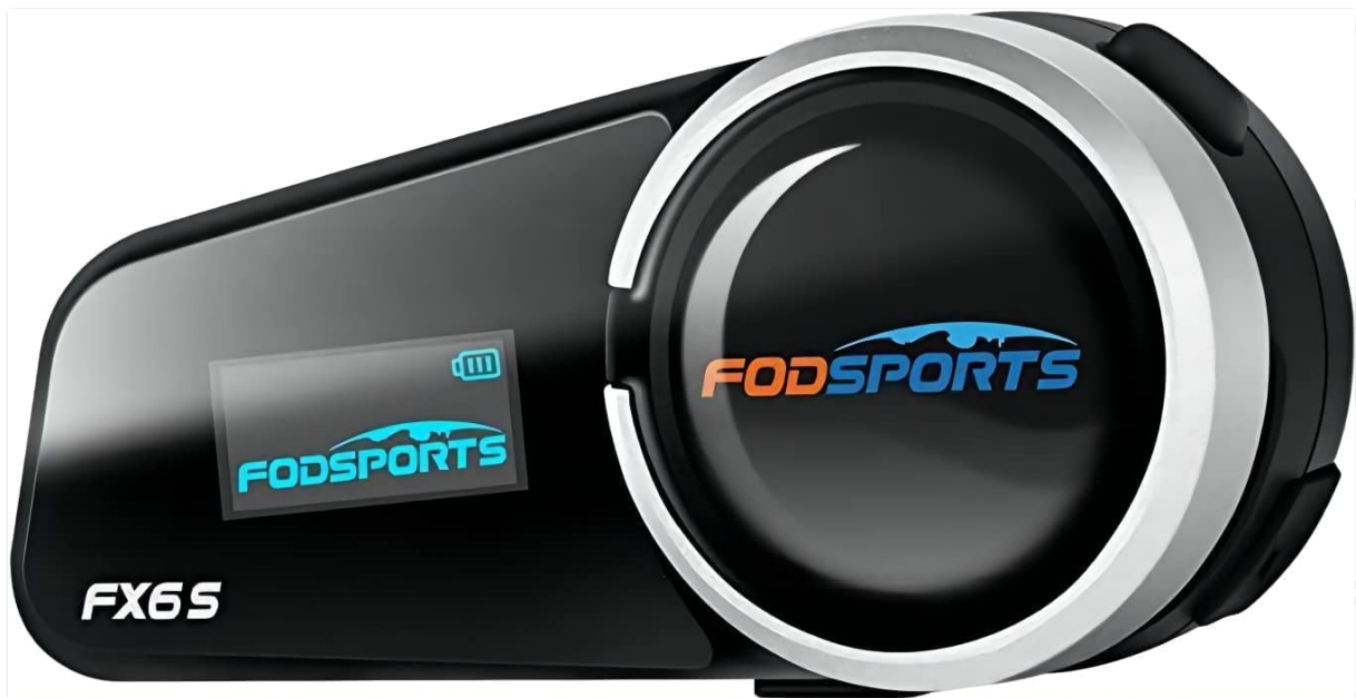
Image: Front view of the FodSports FX6S intercom unit, highlighting its sleek design and LED display.