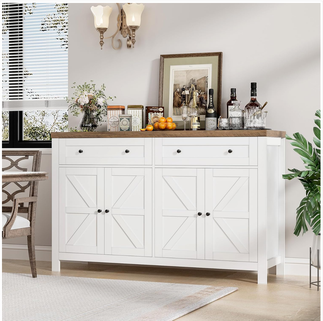
Figure 4.1: Fully assembled HOSTACK Buffet Sideboard Cabinet.