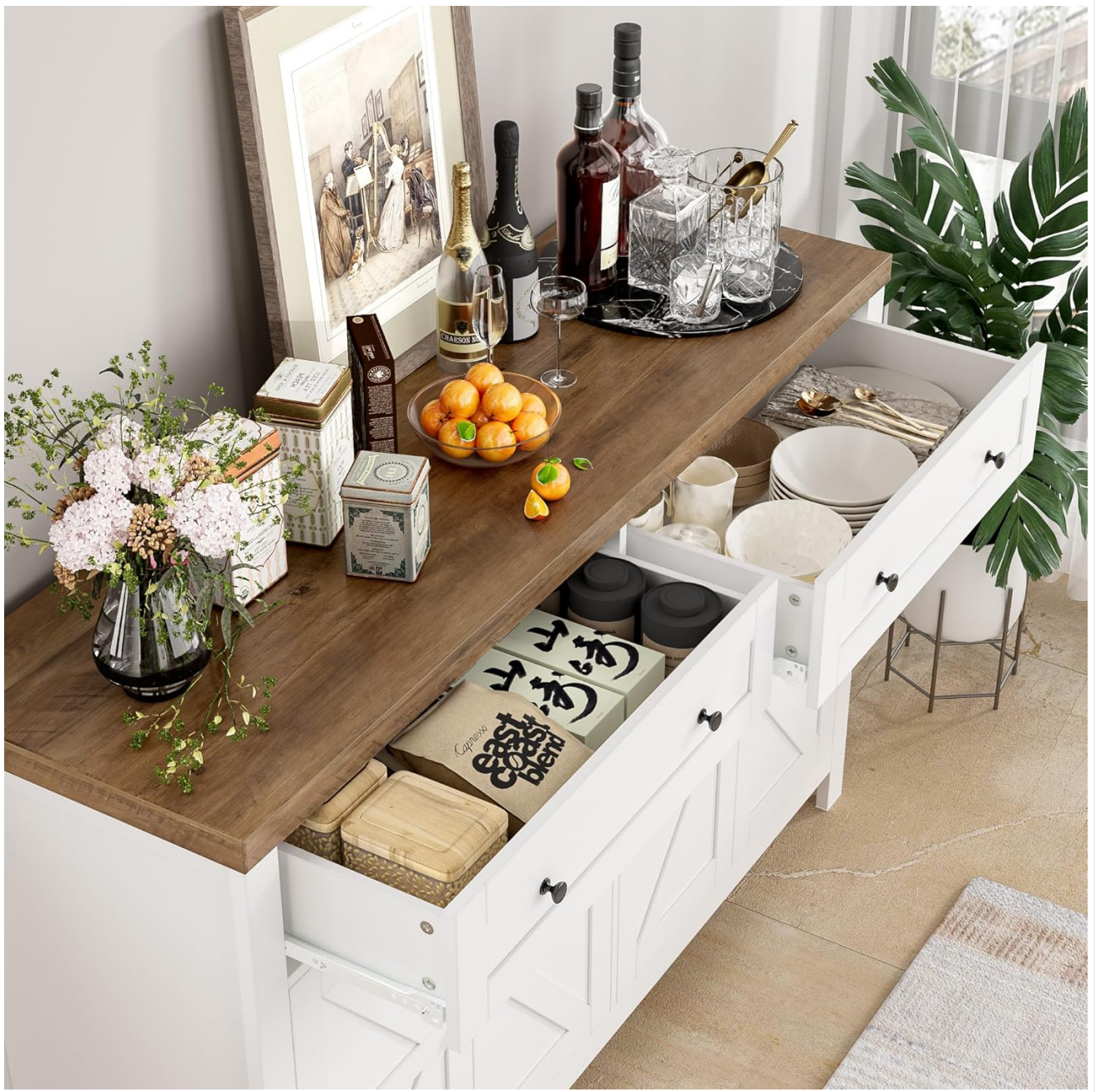
Figure 5.1: Cabinet with drawers and doors open, showcasing storage capacity.