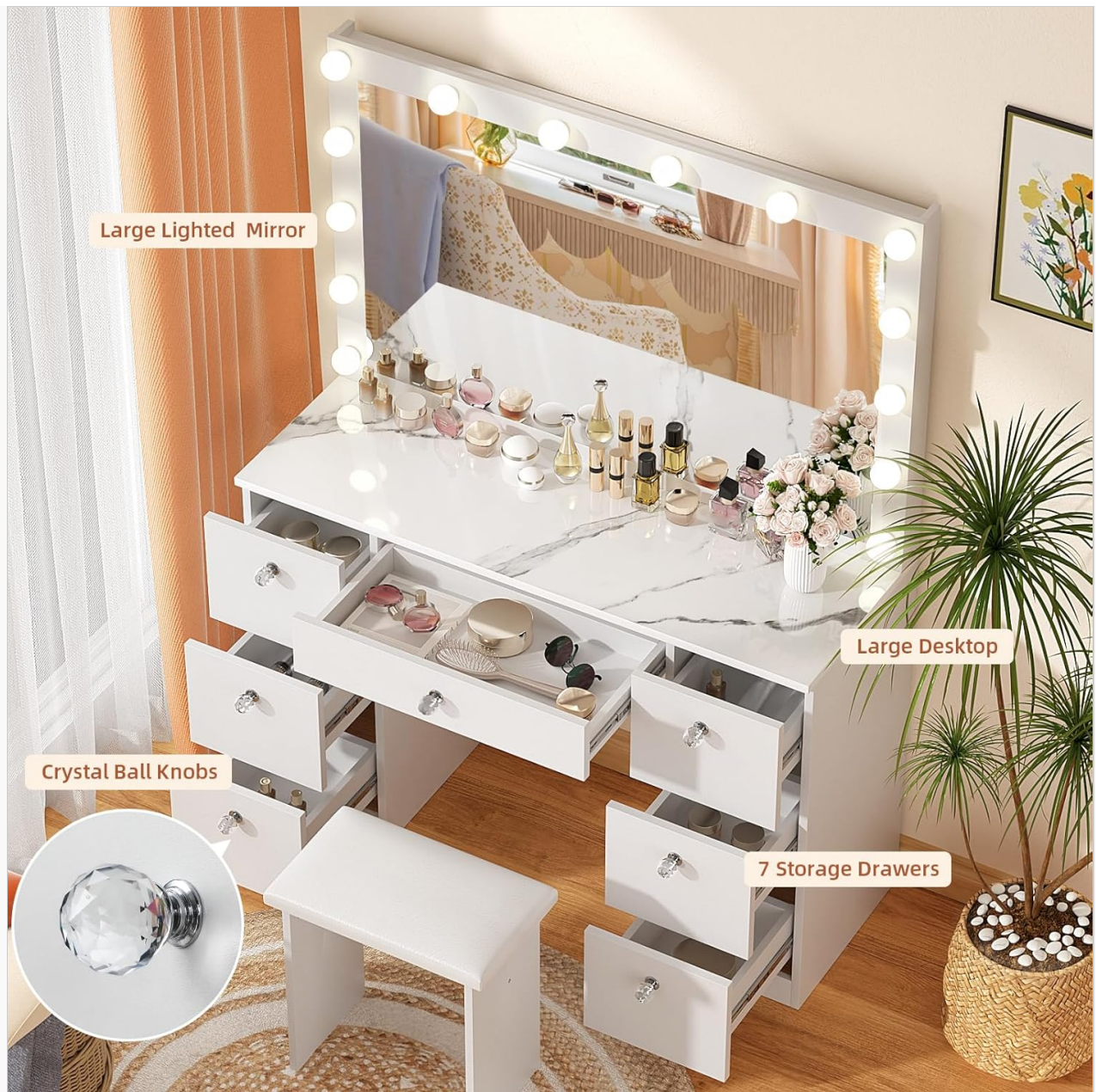
Image: An aerial perspective of the vanity desk with all seven drawers pulled open, showcasing the large desktop area and the crystal ball knobs on the drawers, filled with various beauty products.