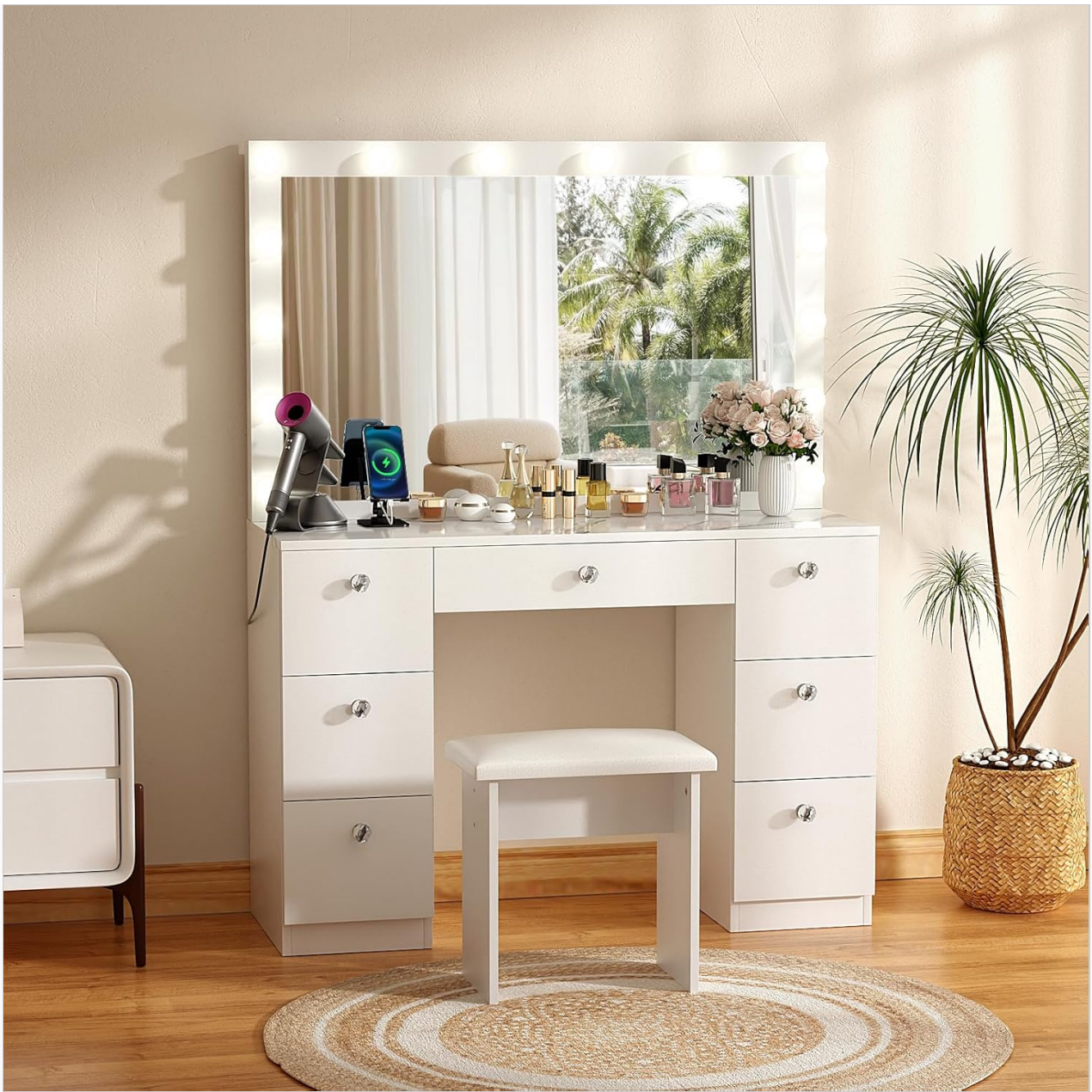
Image: The SMOOL Vanity Desk, featuring a large lighted mirror, multiple drawers, and a cushioned stool, positioned in a bright bedroom.