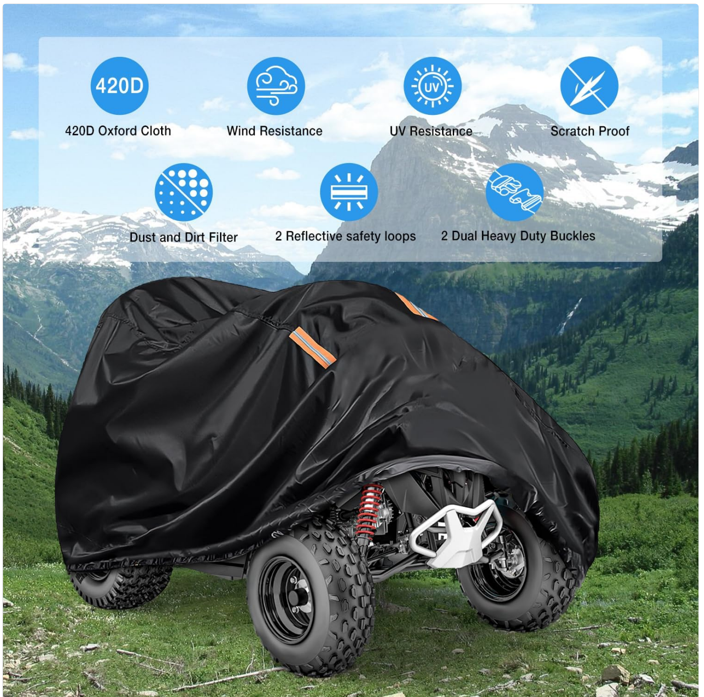
Image: Overview of Nilight ATV Cover features, highlighting material, protection, and securing mechanisms.