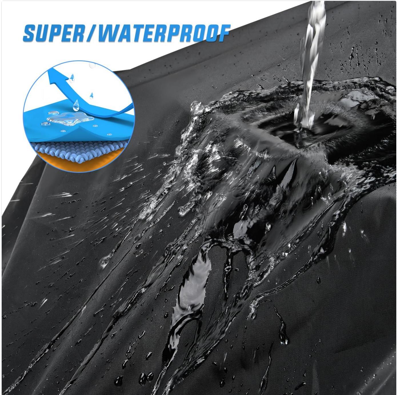
Image: Water test showing the cover's waterproof coating effectively repelling water.