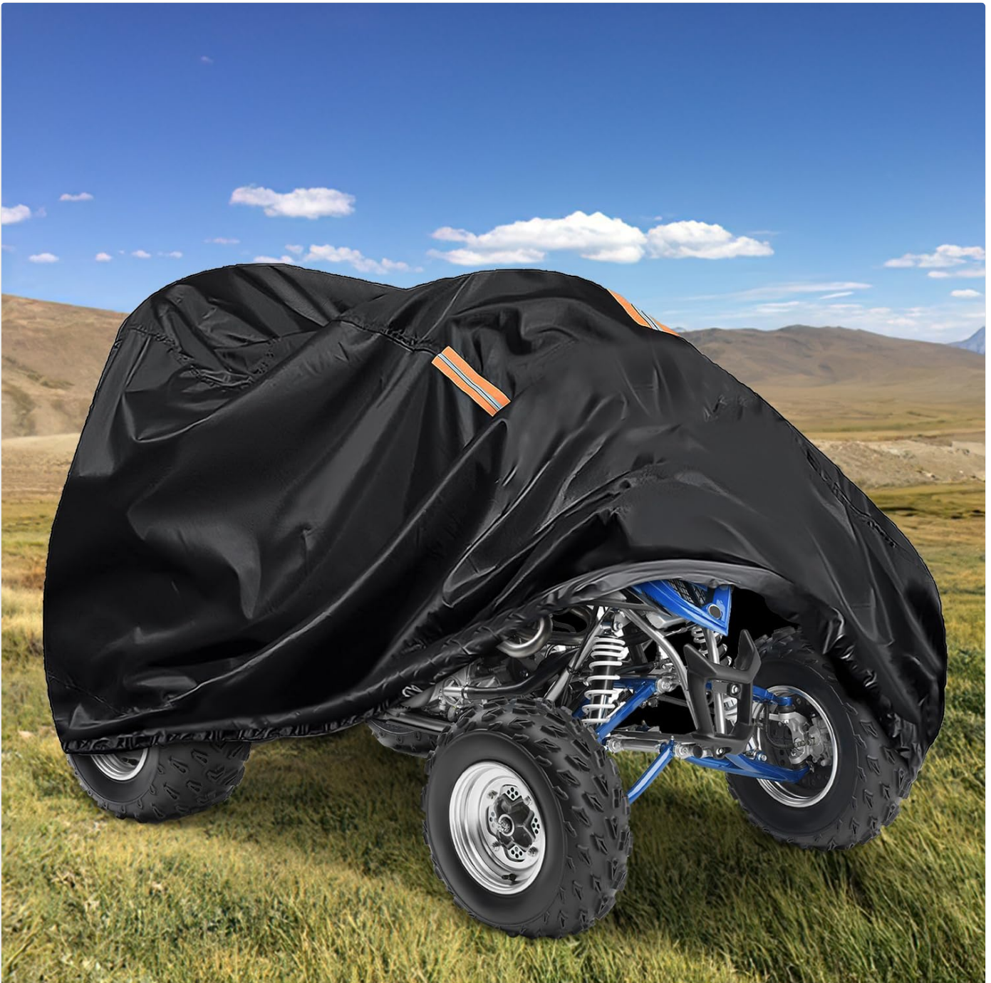
Image: An ATV fully covered by the Nilight cover, demonstrating proper installation and fit.