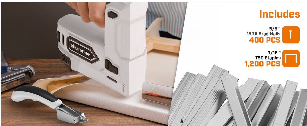
Image Description: This image visually confirms the inclusion of 1200 T50 staples and 400 18GA brad nails, along with the staple gun and remover, emphasizing the comprehensive kit.

Image Description: A detailed diagram of the electric staple gun with key components labeled: LED Indicator, ON/OFF Switch, USB Type-C Charging Port, Switch Trigger, Safety Striker, and Magazine Latch. The image also indicates the tool's weight (1.6lbs) and size (6.1" x 5.5").