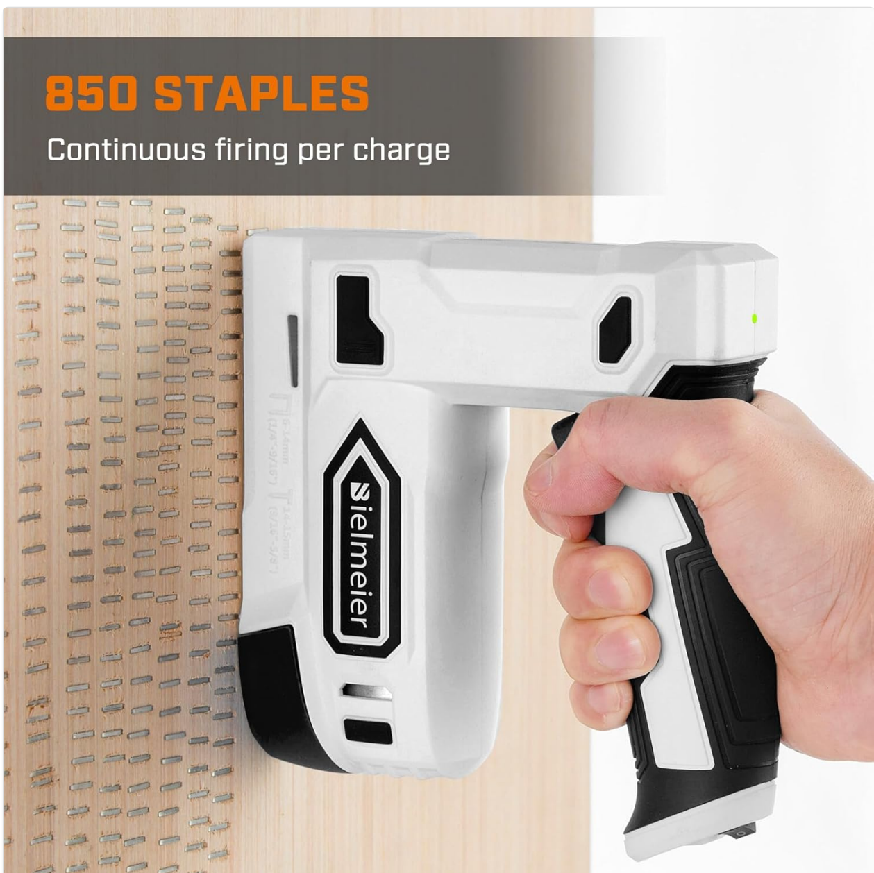
Image Description: The image shows the staple gun in action, demonstrating its capability to continuously fire up to 850 staples on a single charge into a wooden surface.

The tool can consistently shoot up to 850 staples per charge and fire up to 50 pins per minute, making it efficient for various tasks.