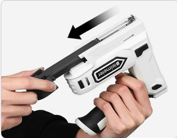
1. Squeeze the pusher assembly and pull it out.