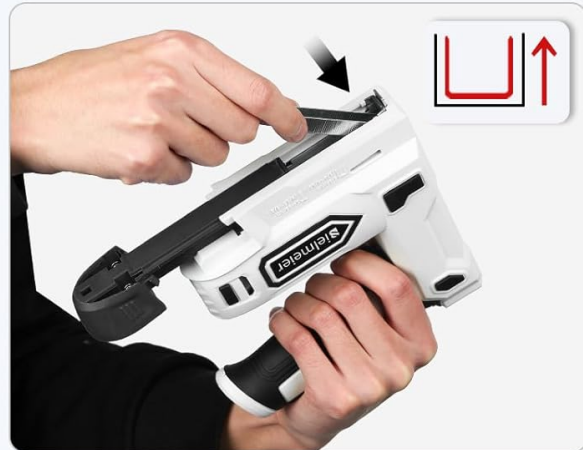
2. Put the staple strip in the magazine with points up.