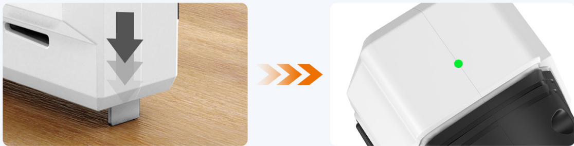
Image Description: This diagram visually explains the optimal usage, showing how the safety striker must be fully depressed against the surface for the LED indicator to light up green, indicating readiness to fire.

To ensure your staple gun operates at peak efficiency, always fully depress the safety striker during use [the LED indicator will light up].