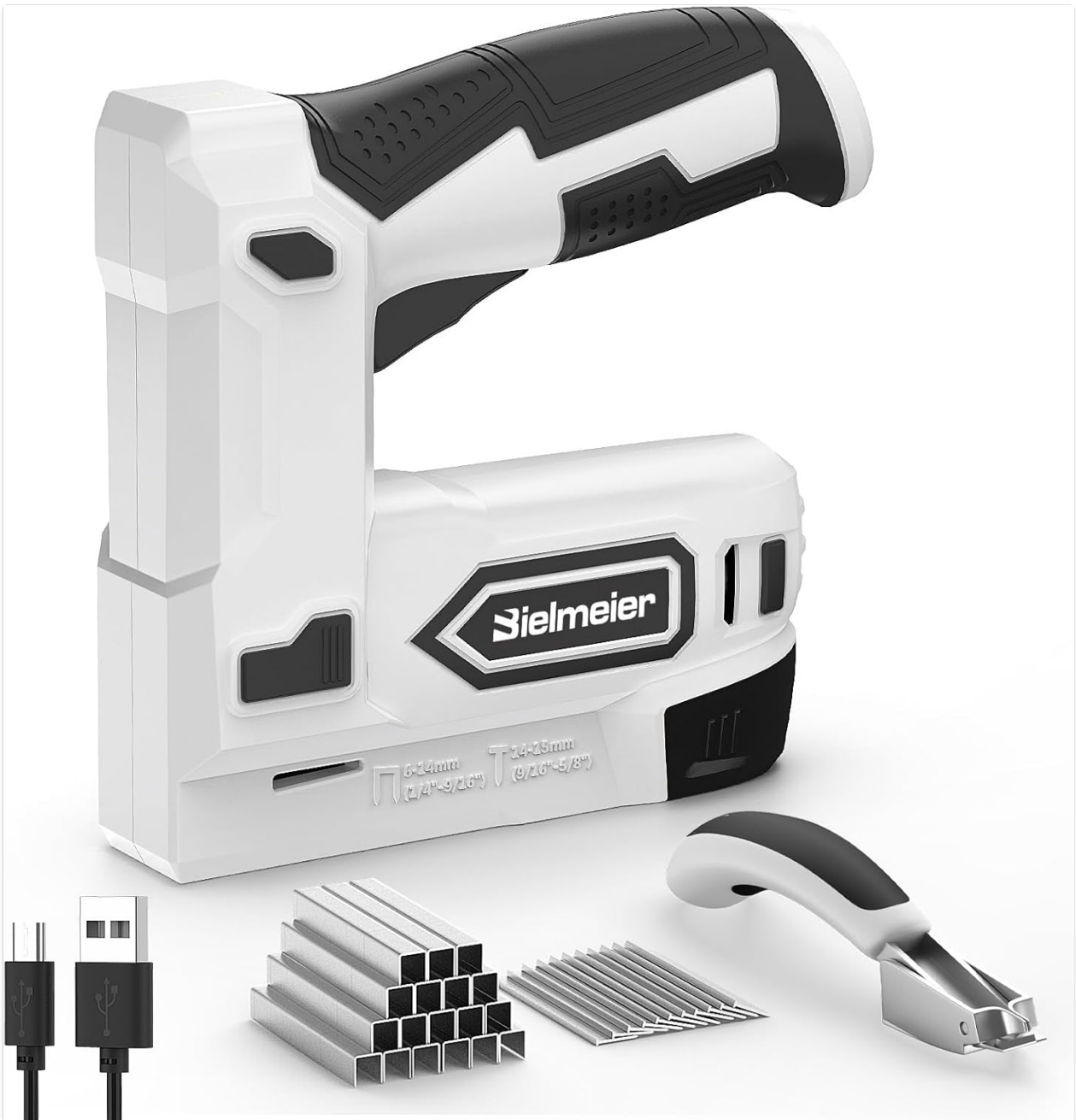
Image Description: The main product image displays the white and black BIELMEIER Electric Staple Gun alongside its accessories, including staples, brad nails, a staple remover, and a USB-C charging cable.