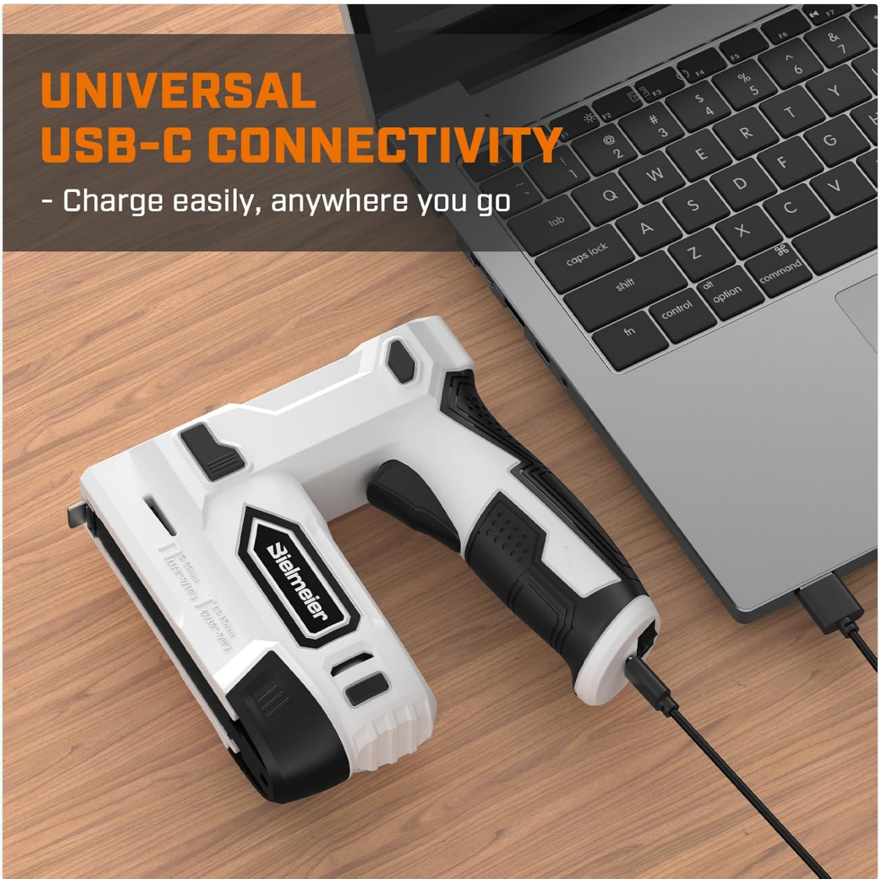
Image Description: The electric staple gun is shown connected to a laptop via its USB-C port, illustrating its universal charging capability.