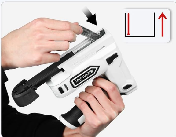
3. Put the nail in the left side with points up.