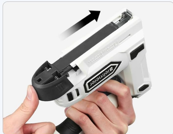
4. Push it back until it locks into place.

Image Description: A step-by-step visual guide demonstrating the process of loading staples into the gun's bottom-loading magazine.