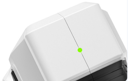
Image Description: This image provides a close-up view of the USB-C charging port and the LED indicator, which signals when the battery is fully charged.