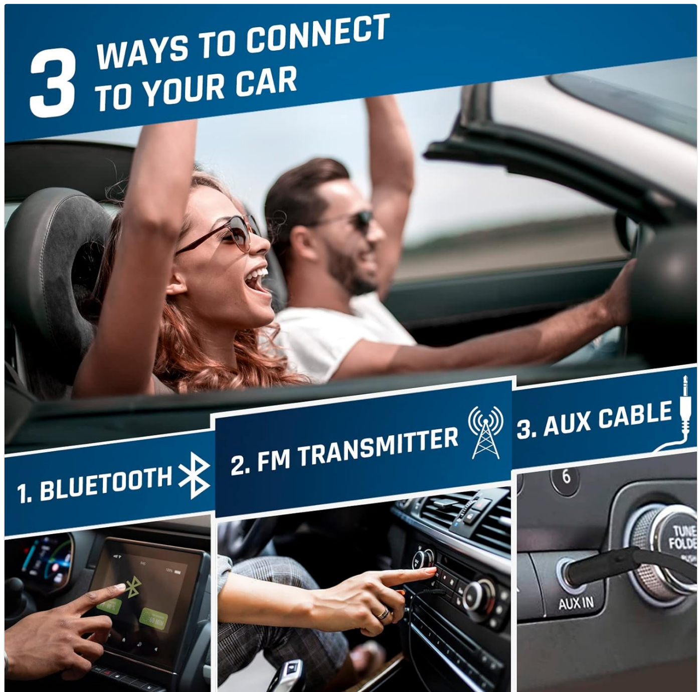
Image: A visual representation of the three connection methods for the KLIM Journey to a car: Bluetooth, FM Transmitter, and AUX Cable, with corresponding icons and example car interiors.

The KLIM Journey offers three primary methods for connecting to your car's audio system: