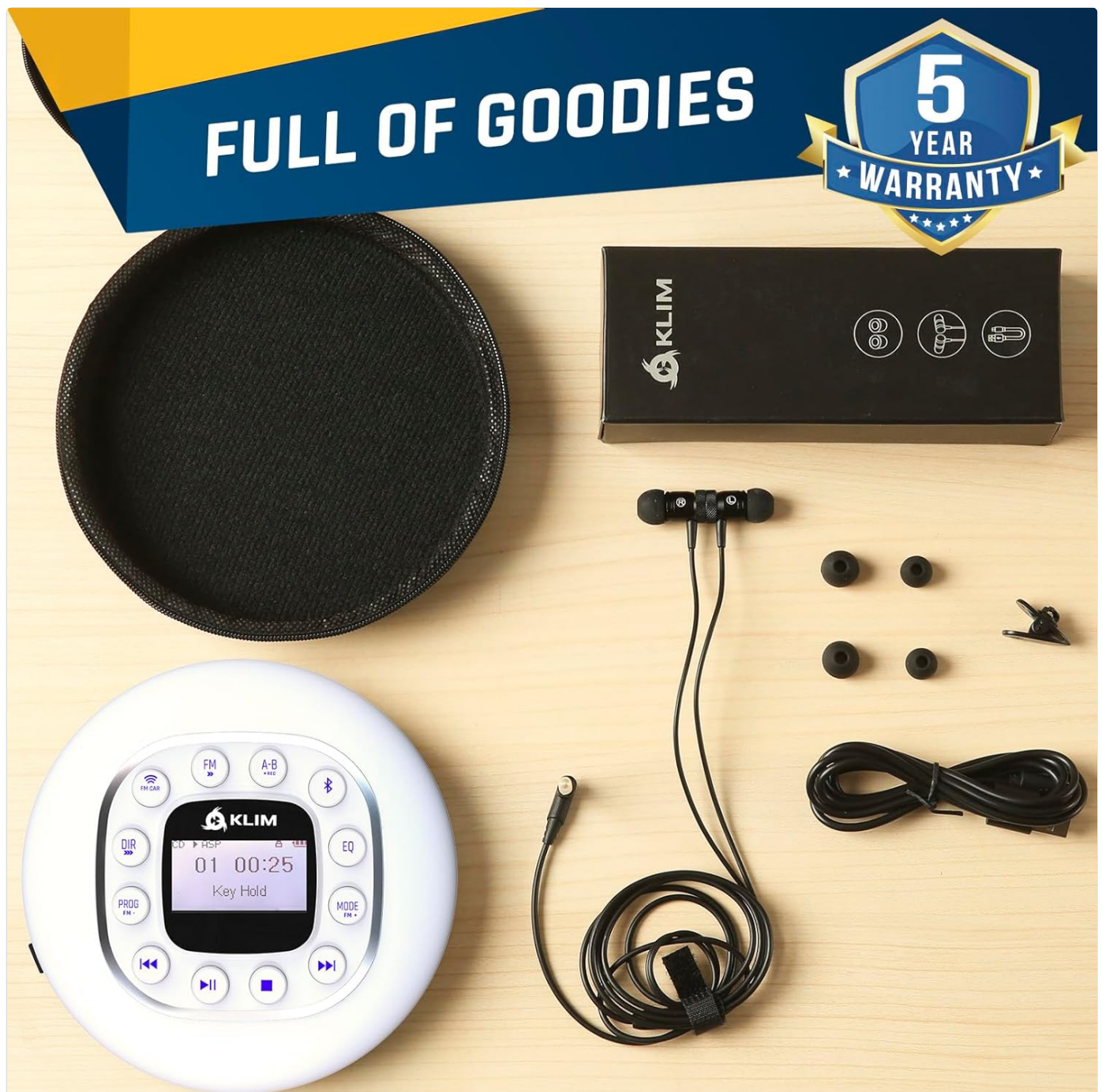
Image: A flat lay of all items included in the KLIM Journey package, neatly arranged on a wooden surface. This includes the white CD player, black wired earphones, a USB-C cable, and a black zippered carry pouch.