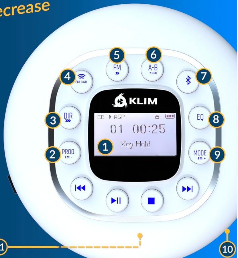
Image: A detailed diagram of the KLIM Journey CD Player's top panel, highlighting and numbering each control button and feature for easy identification and understanding.