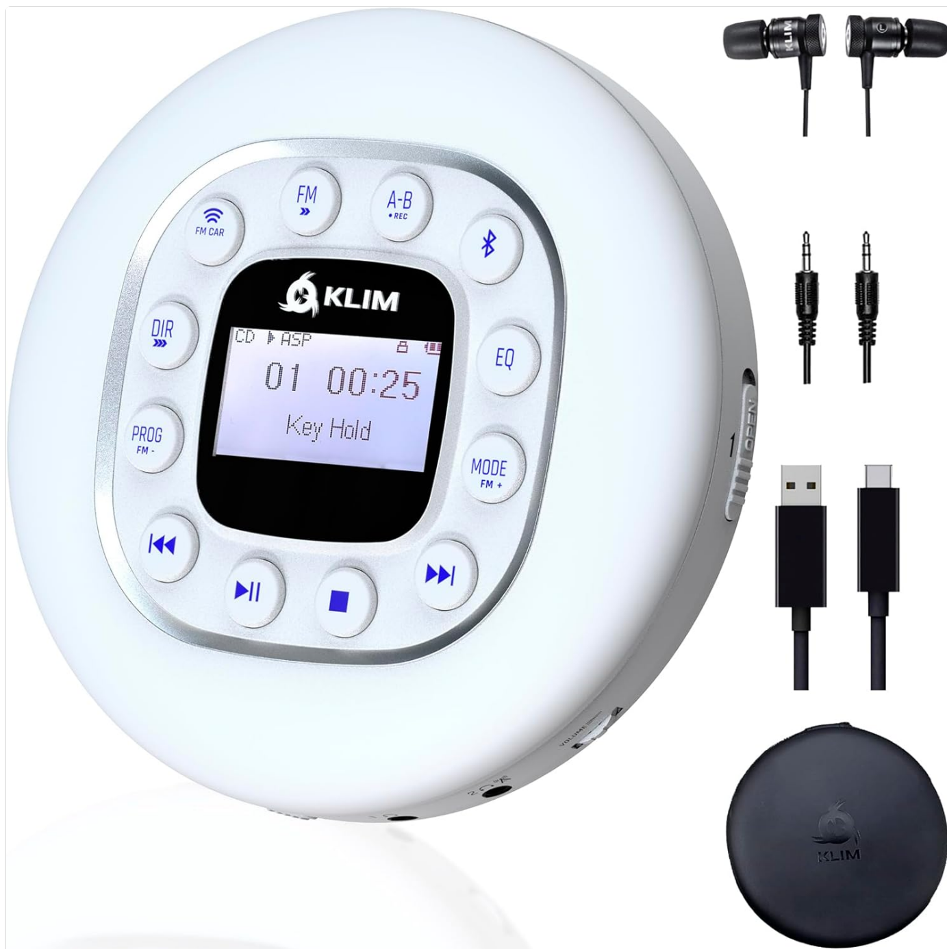
Image: The KLIM Journey Portable CD Player, shown with its accessories including wired earphones, an AUX cable, a USB-C charging cable, and a protective carry pouch.