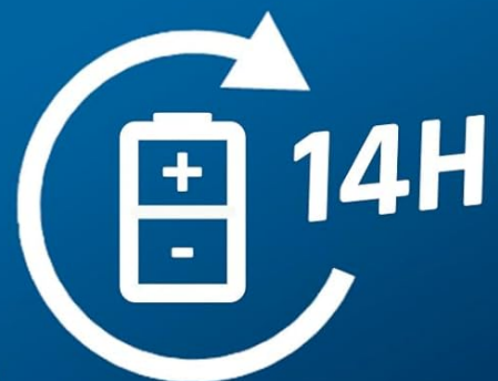
Image: The KLIM Journey CD Player with a bright, illuminated screen, emphasizing its compact design and long-lasting battery, indicated by a "14H" battery icon.

Compact & light Long-lasting battery (14+ hours of playtime)