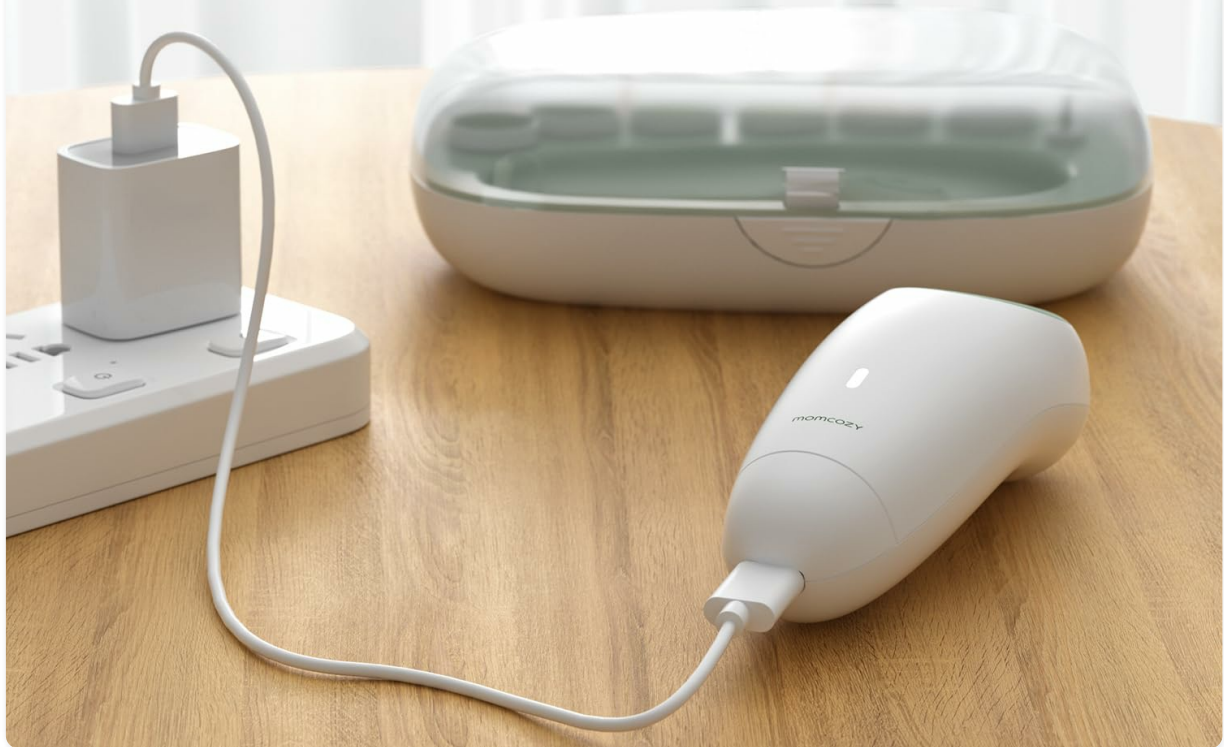
Image: The Momcozy Electric Baby Nail File being charged with a Type-C cable connected to a wall adapter.

Before first use, fully charge the nail file. The Type-C charging cable is conveniently stored under the organizer tray within the protective case.