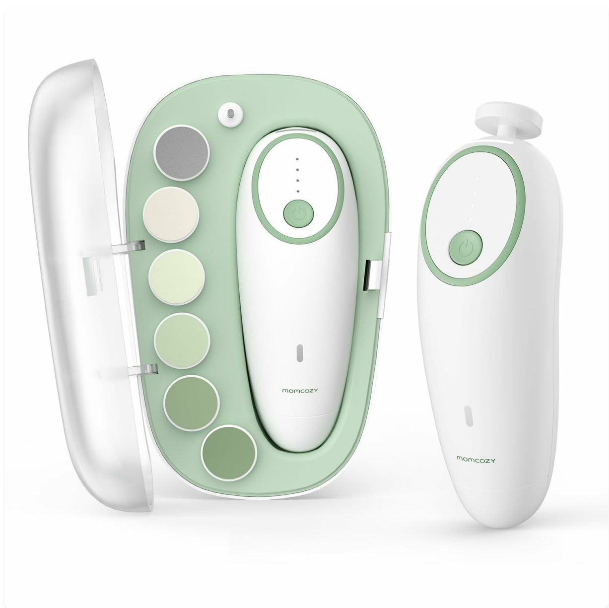
Image: Overview of the Momcozy Electric Baby Nail File Kit, showing the main unit, protective case, and various grinding heads.

Your Momcozy Electric Baby Nail File Kit includes: