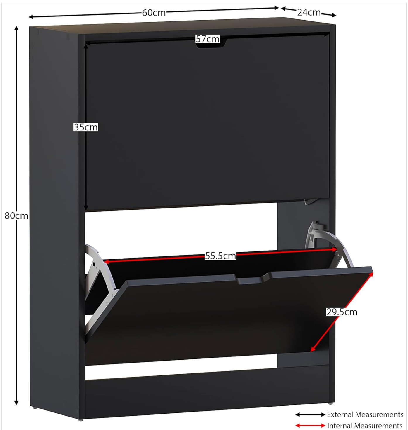
This diagram illustrates the external dimensions (80cm H x 60cm W x 24cm D) and internal drawer measurements (55.5cm width, 29.5cm depth) of the shoe cabinet, crucial for assembly and placement.