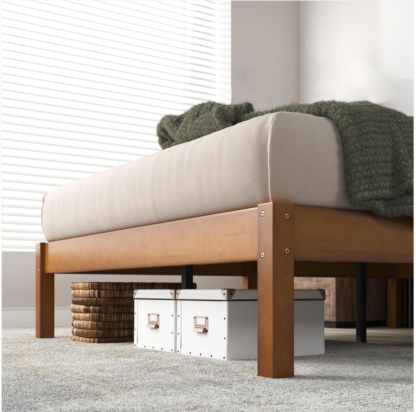
Image: A close-up view of the ZINUS Ellie bed frame's underbed area, illustrating the 11 inches of clearance available for storage, with storage boxes placed underneath.