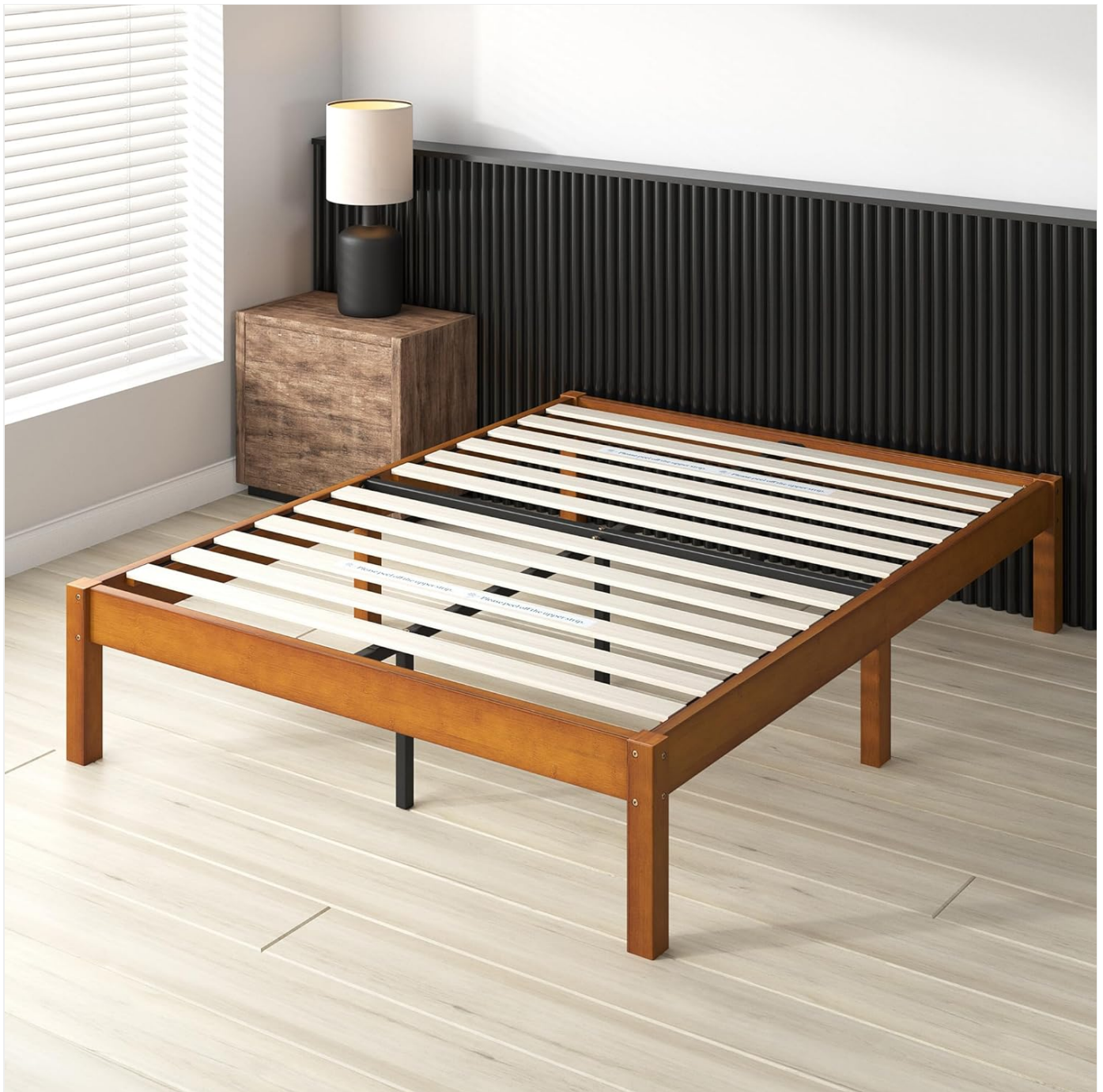
Image: The ZINUS Ellie 14 Inch Queen Bamboo Platform Bed Frame, fully assembled without a mattress, showcasing its wooden slat support system and brown bamboo finish.