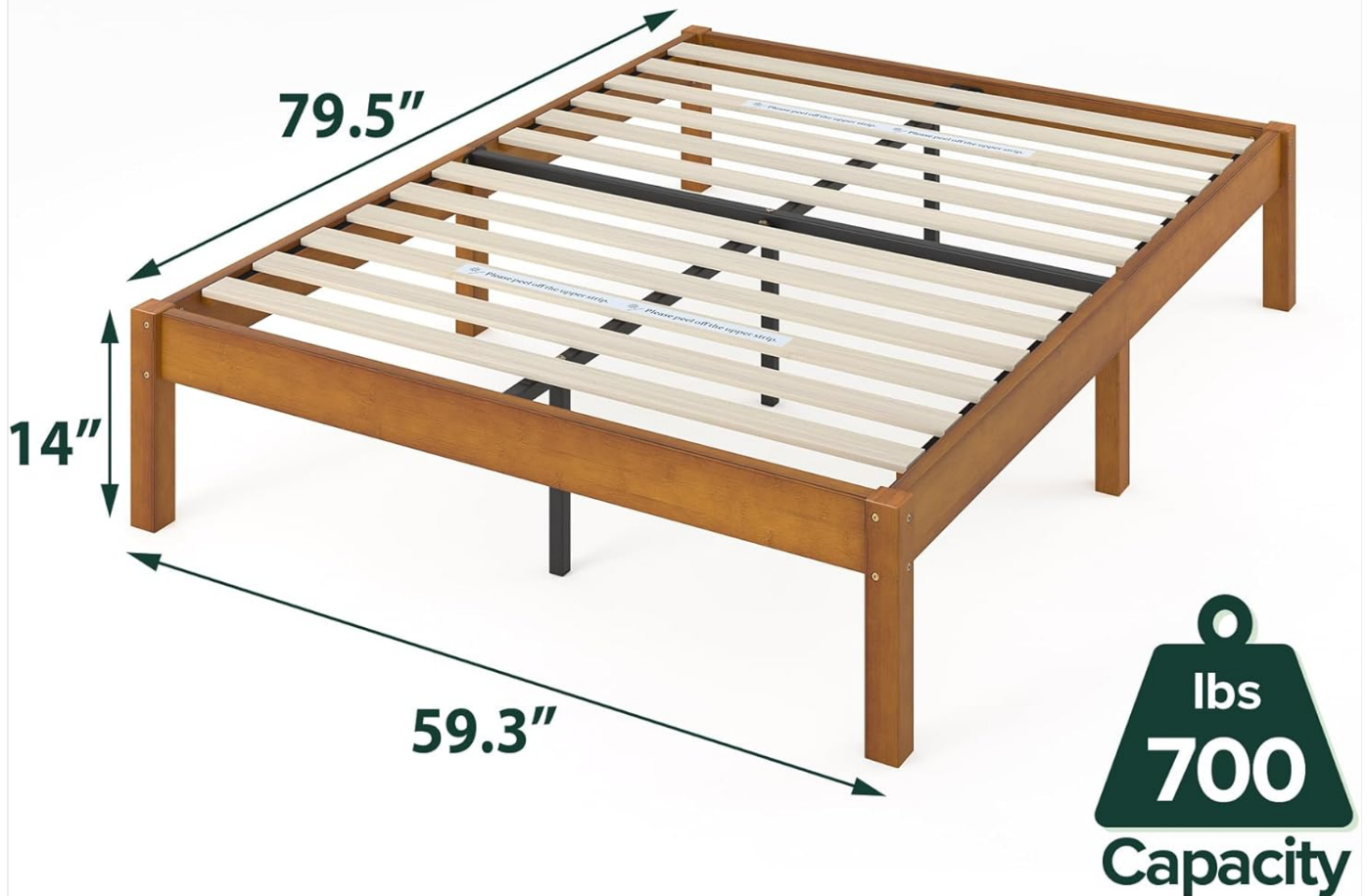
Image: A diagram showing the dimensions of the ZINUS Ellie Queen bed frame (79.5"L x 59.3"W x 14"H) and its 700 lbs weight capacity.