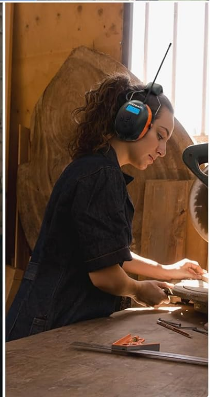
Image: This collage shows different scenarios where the PROHEAR 033A earmuffs are used to protect hearing, such as a person driving a tractor, another using a string trimmer in a garden, a craftsman working in a workshop, and someone operating power tools, all emphasizing the message to 'Protect Your Hearing'.