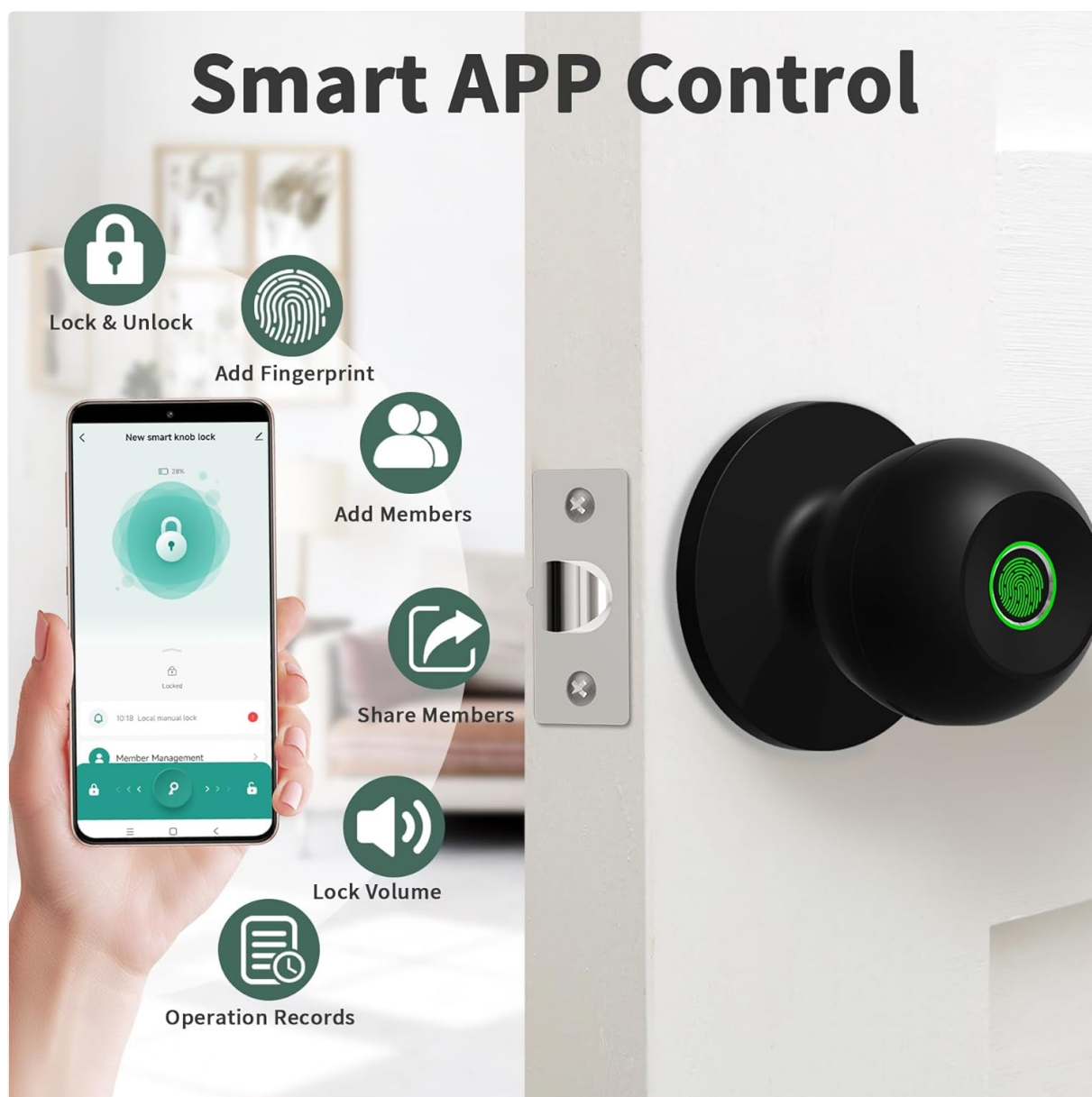
Image: A smartphone screen showing the TUYA SMART APP with icons for lock/unlock, adding fingerprints, adding members, sharing members, adjusting lock volume, and viewing operation records.

The smart lock can be controlled via the TUYA SMART APP. This app allows you to manage fingerprints, access codes, view unlock records, and configure lock settings.