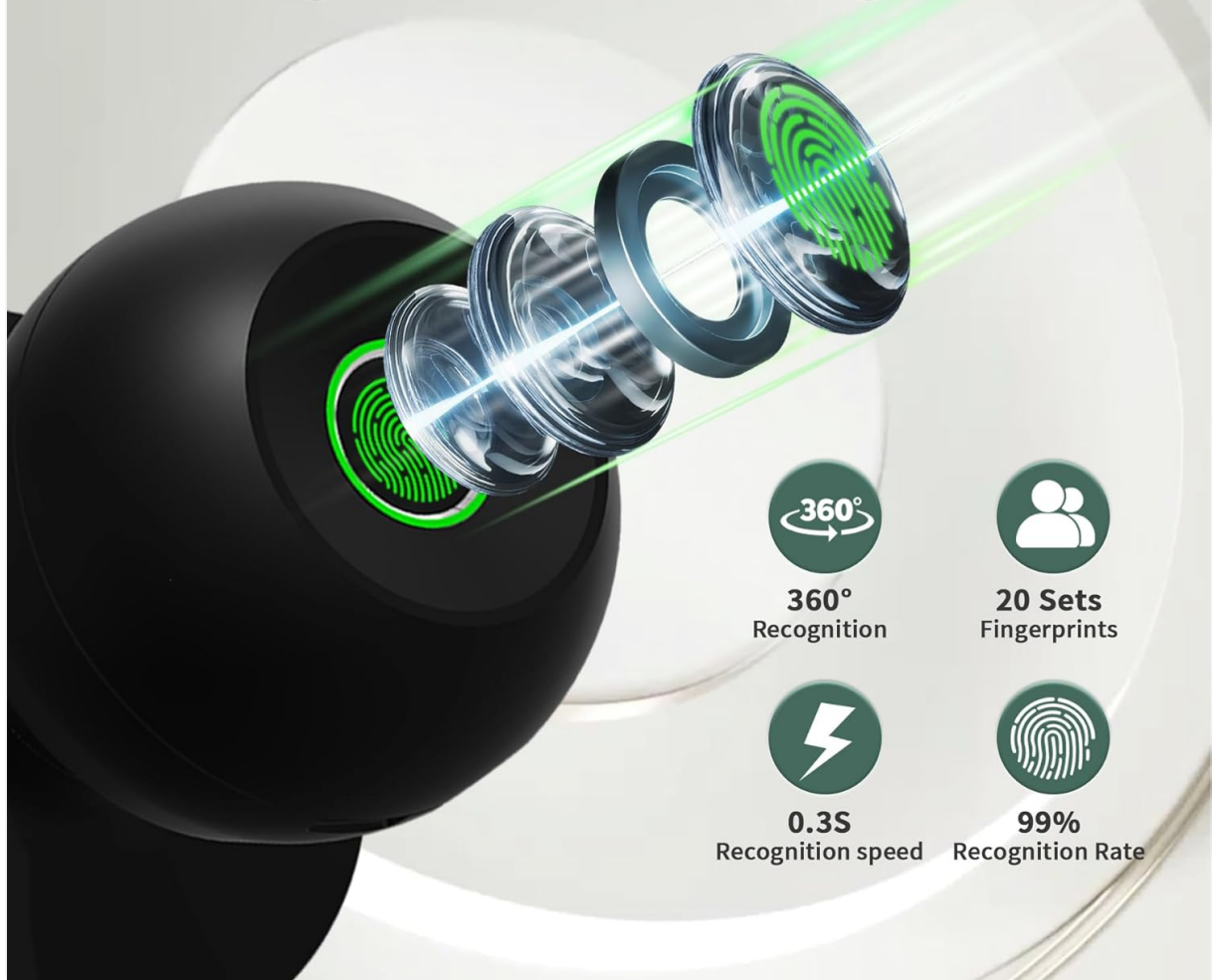
Image: An illustration detailing the biometric fingerprint recognition technology, showing 360-degree recognition, 0.3-second recognition speed, and 99% recognition rate, with a capacity for 20 fingerprints.