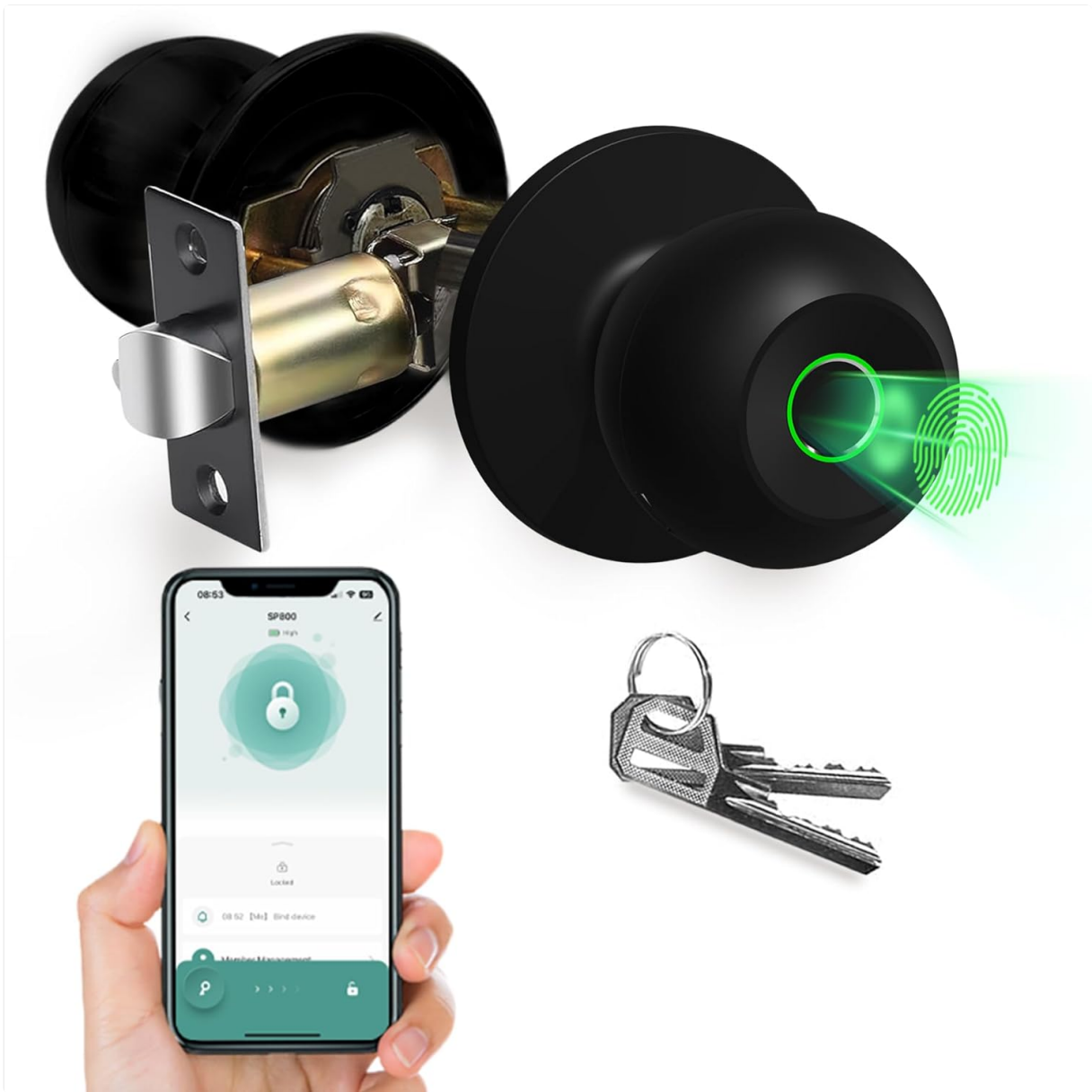
Image: The DSTMLOCKFTY Fingerprint Door Lock, showing the exterior knob with fingerprint sensor, the interior knob, a set of emergency keys, and a smartphone displaying the control app.