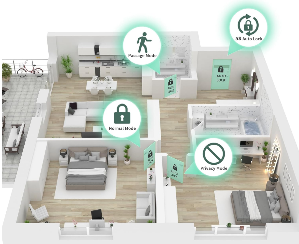
Image: An overhead view of a house layout illustrating three lock modes (Passage Mode, Normal Mode, Privacy Mode) and the 5-second auto-lock feature, applicable to diverse scenarios.

Applicable to diverse lifestyle scenarios.