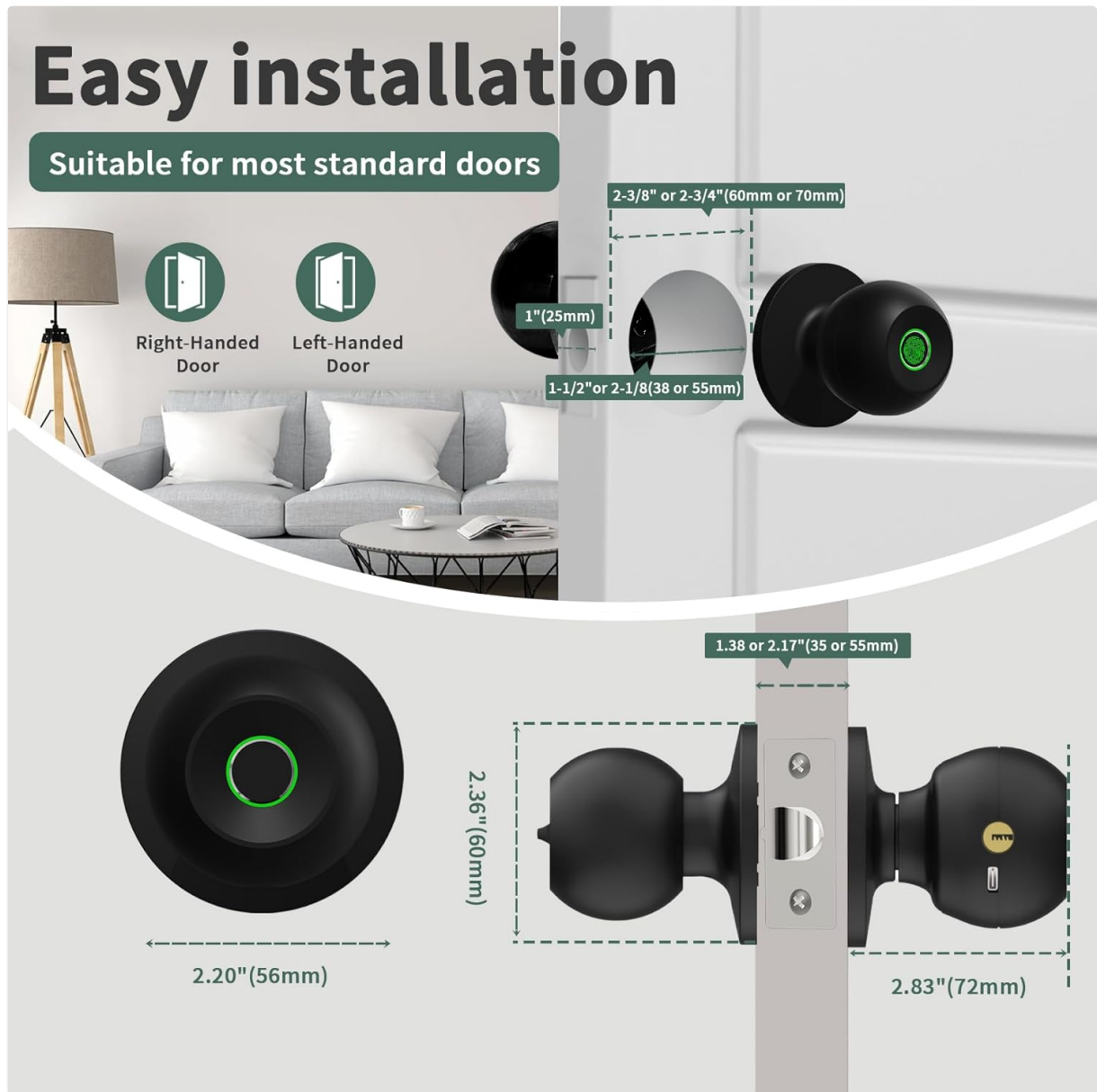
Image: Diagram illustrating the required door thickness and backset dimensions for proper installation of the door lock.