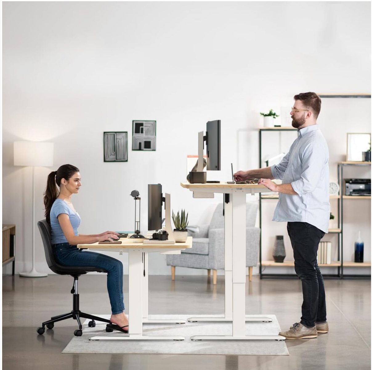
Image: A user transitioning between sitting and standing positions at the Homall Electric Standing Desk, highlighting its ergonomic benefits.

Regularly alternating between sitting and standing positions can promote better posture and reduce discomfort during long work sessions.