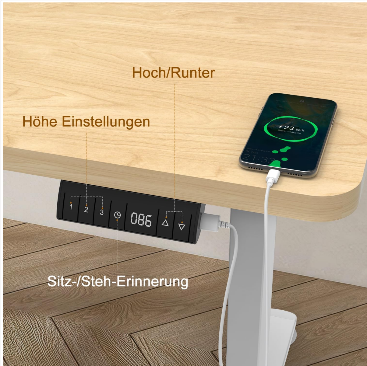
Image: Close-up of the desk's control panel with buttons for height adjustment, memory presets, and a digital display.

The control panel allows for easy adjustment of the desk height and programming of memory presets.