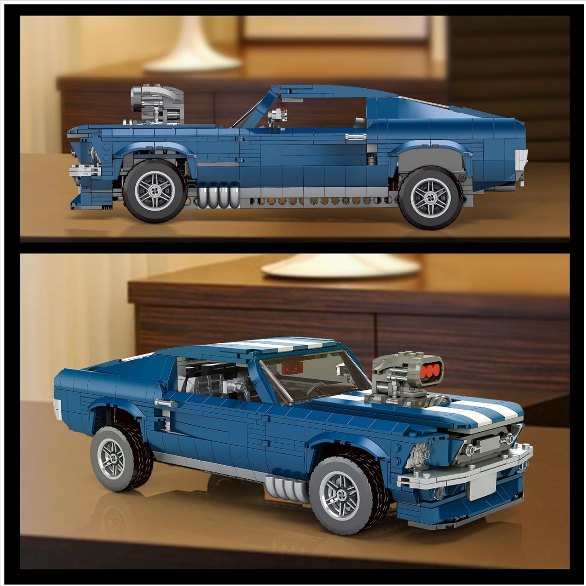
Figure 5.4: Side and front perspective views of the assembled model, emphasizing its sleek profile and detailed front grille.