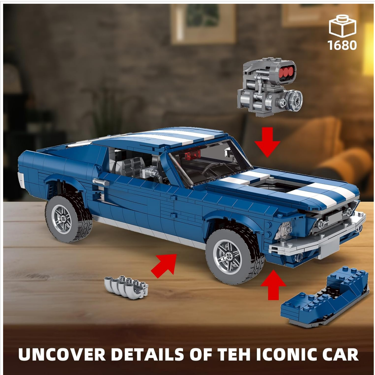
Figure 5.3: An illustration highlighting removable components such as the engine block and side exhaust pipes, indicating the model consists of 1680 pieces.