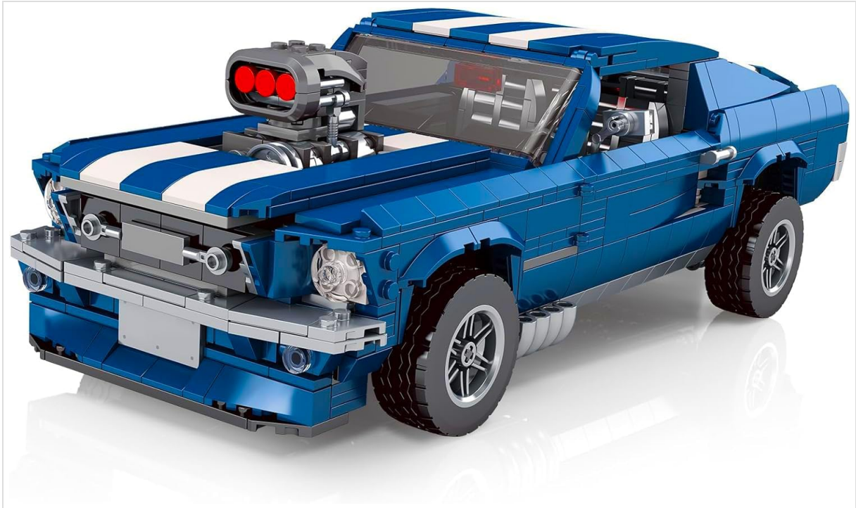
Figure 4.1: The fully assembled Mov stone GT 1976 Building Blocks Car Model YC215, showcasing its detailed design and blue finish with white racing stripes.