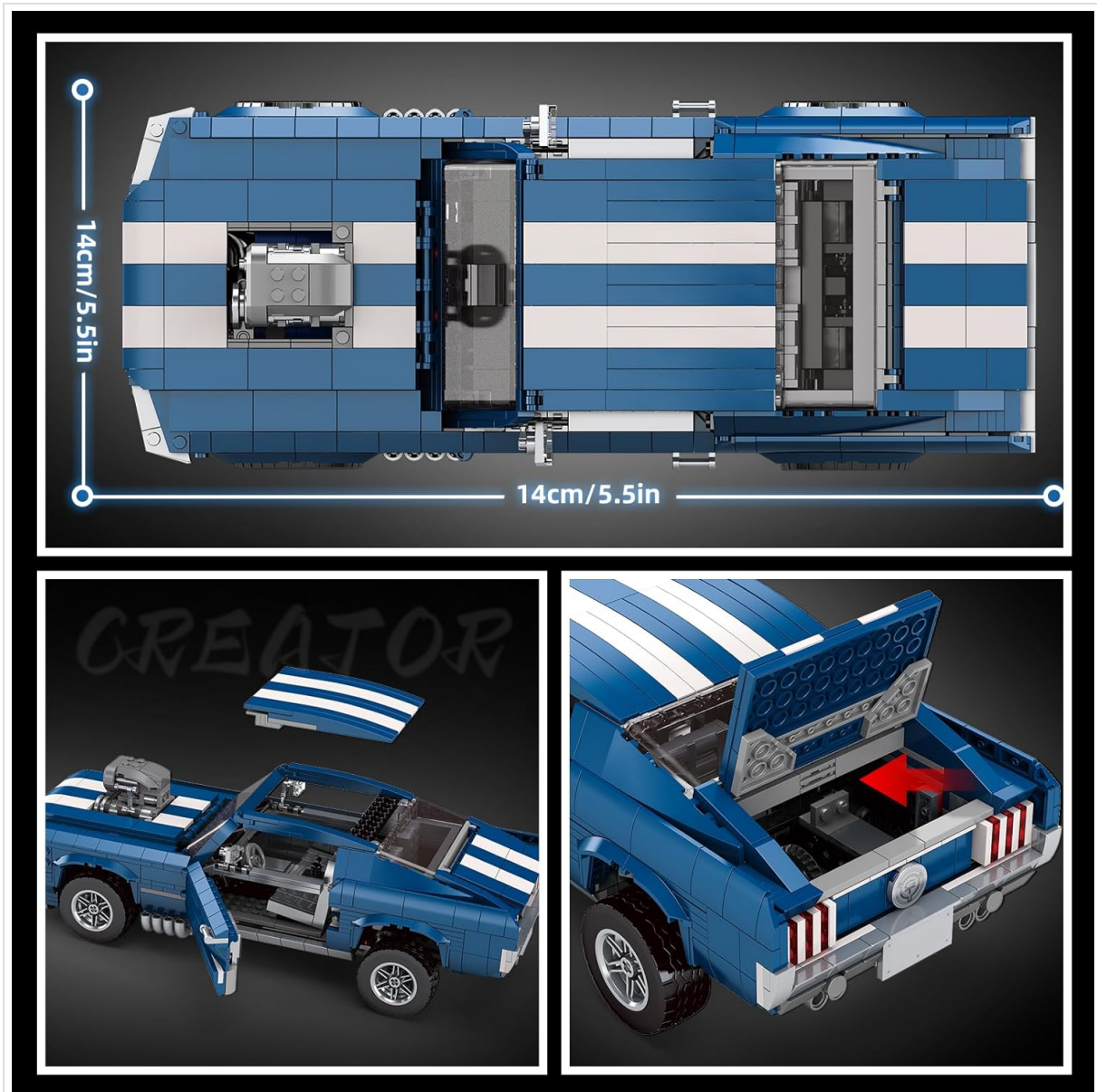
Figure 5.1: Top-down view showing the overall dimensions (approximately 14cm/5.5in wide) and detailed features like the opening hood and trunk.