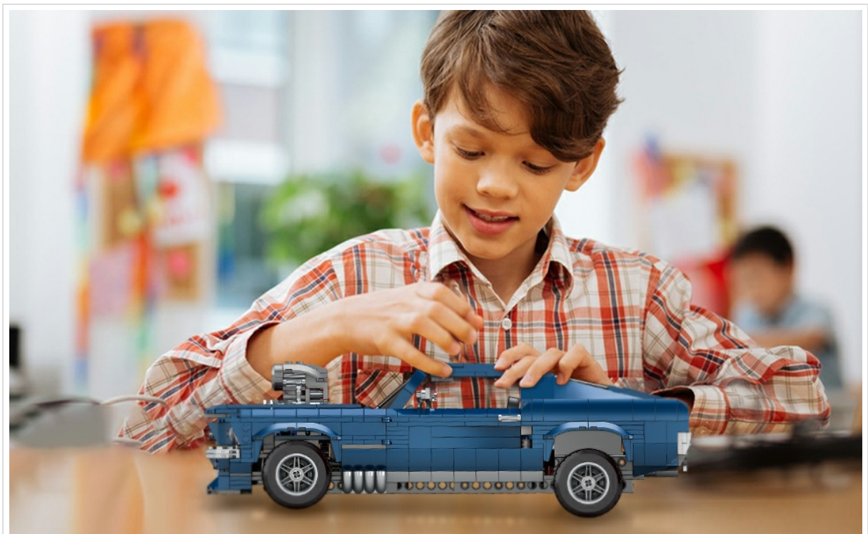
Figure 4.2: A child engaged in the assembly process, demonstrating the hands-on nature of building the model.