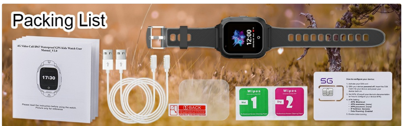
Image 3.1: Contents included in the wonlex KT24 Smart Watch package.