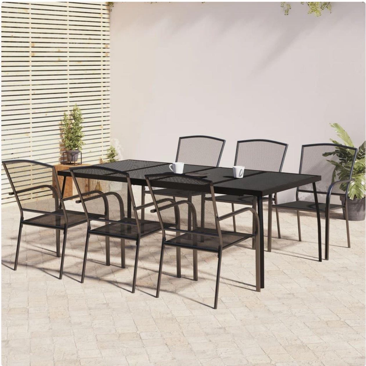
Image: The dining set arranged on an outdoor patio, demonstrating its typical use environment.