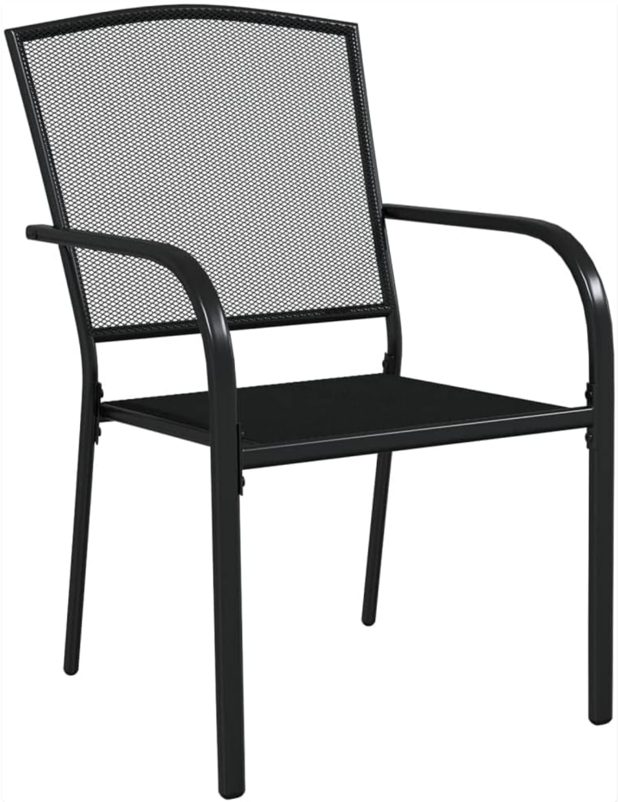
Image: A detailed view of one of the patio chairs, highlighting its construction and design.