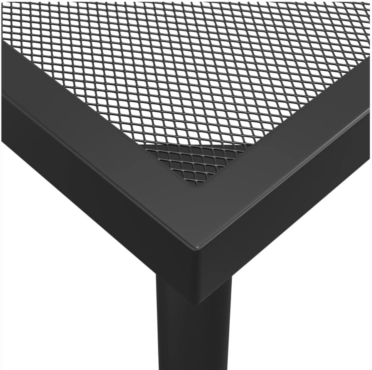
Image: A close-up of the table corner, illustrating the mesh tabletop and robust frame construction.