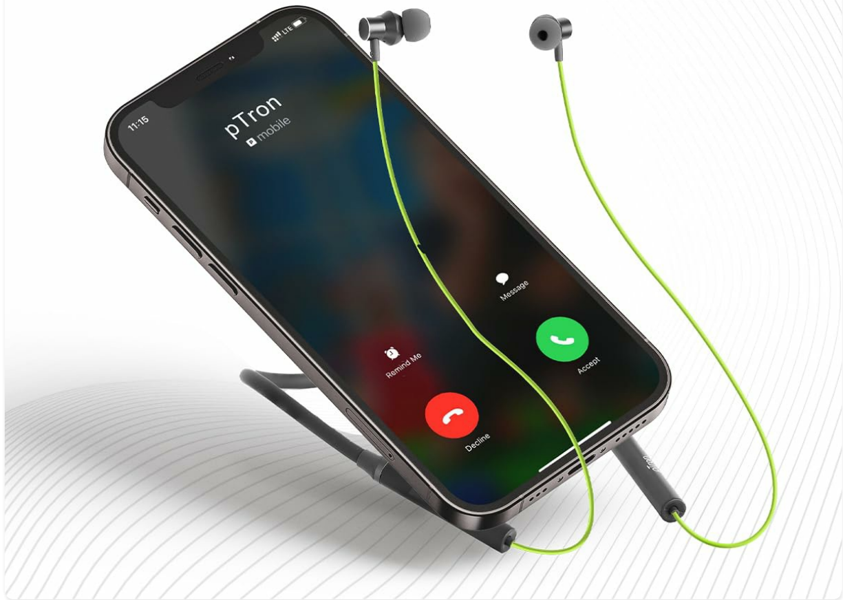
Image: A smartphone screen showing an incoming call, with the pTron Tangentbeat headphones connected, demonstrating Bluetooth 5.0 connectivity and call handling.