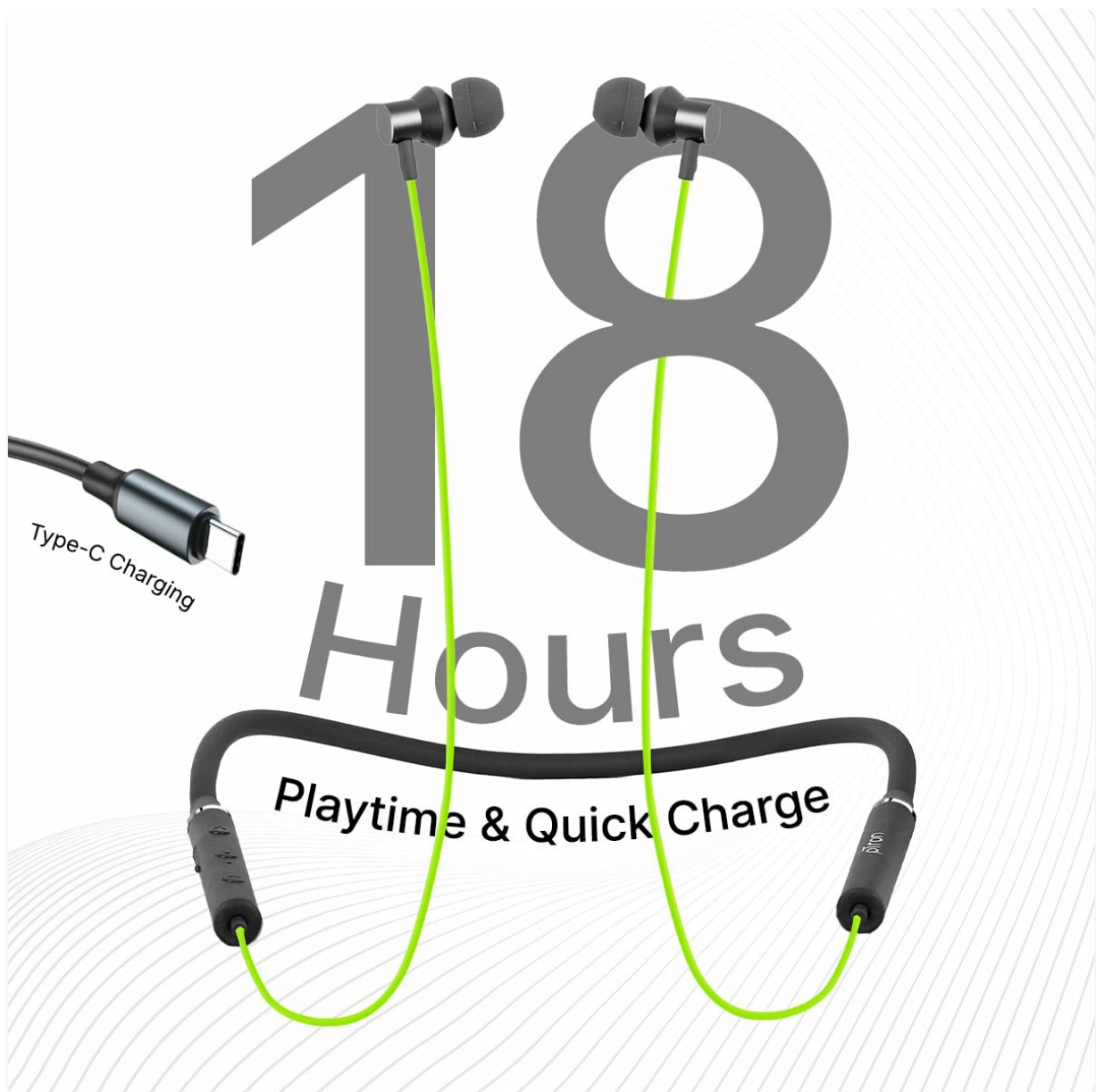
Image: The pTron Tangentbeat neckband highlighting 18 hours of playtime and the Type-C charging port.