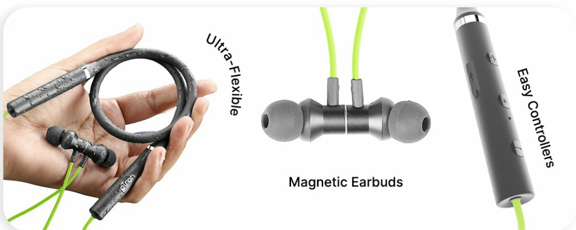
Image: The pTron Tangentbeat neckband demonstrating its ultra-flexible design and magnetic earbuds, which aid in convenient storage and portability.