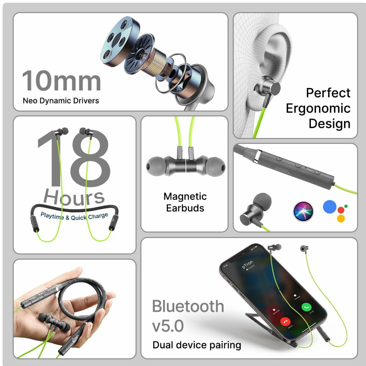
Image: Overview of pTron Tangentbeat features including 10mm dynamic drivers, ergonomic design, 18-hour battery life, magnetic earbuds, Bluetooth 5.0, and voice assistant support.