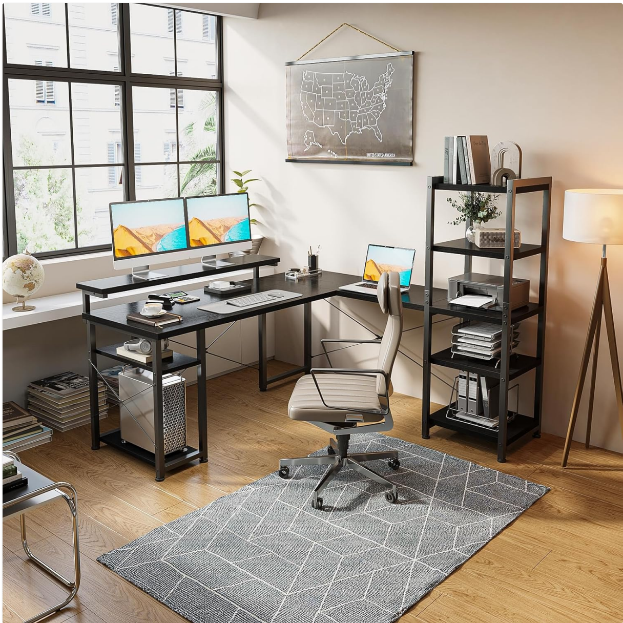
Image 1.1: The ODK L-Shaped Computer Desk in a typical home office environment, showcasing its design and functionality.