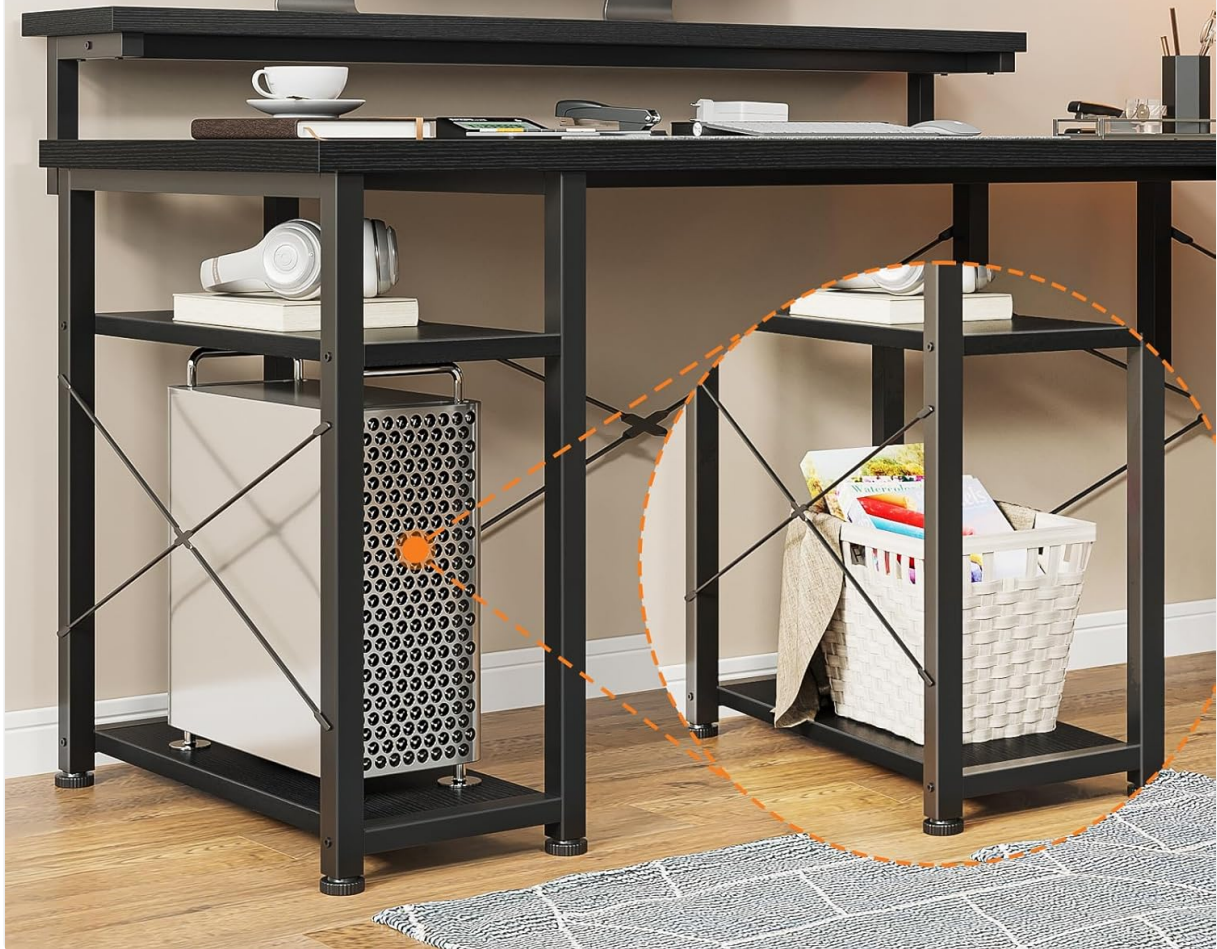
Image 3.4: Detail of the 2-tier shelves located beneath the main desk surface, designed to accommodate a computer tower or other storage items.

| Place the computer tower or storage box.