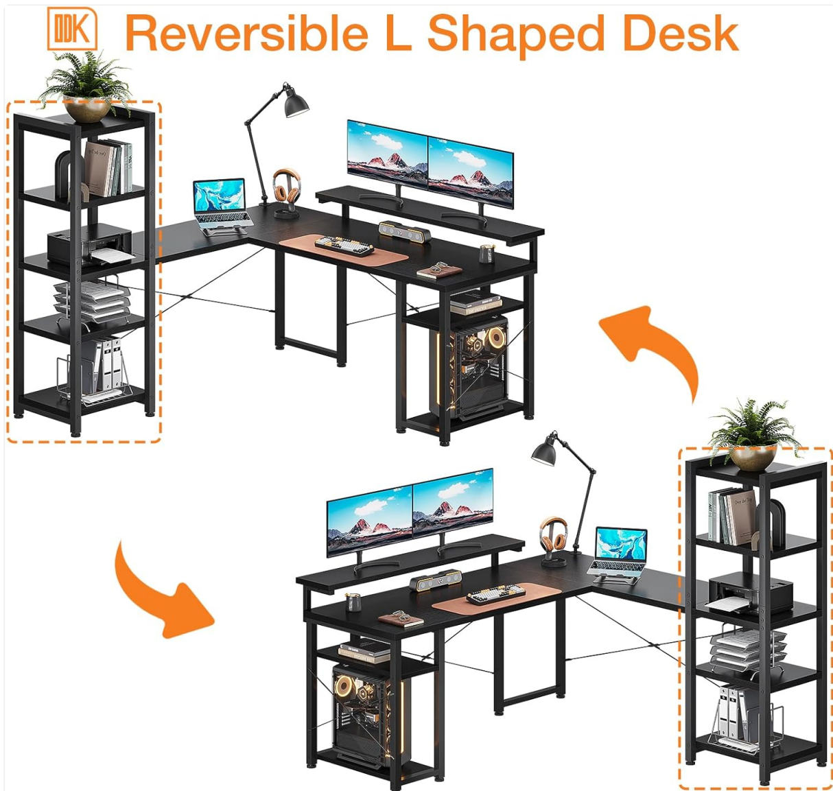
Image 3.1: Illustration demonstrating the two possible configurations for the reversible L-shaped desk, allowing the longer section to be on either the left or right side.

The ODK L-Shaped desk is designed for flexibility, allowing you to configure the L-shape to either the left or right side to best suit your space. This decision should be made early in the assembly process as it affects the orientation of certain frame components.