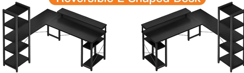
Image 7.1: A comprehensive diagram illustrating the dimensions of the ODK L-Shaped Computer Desk, including the main desk, monitor stand, and shelving unit.