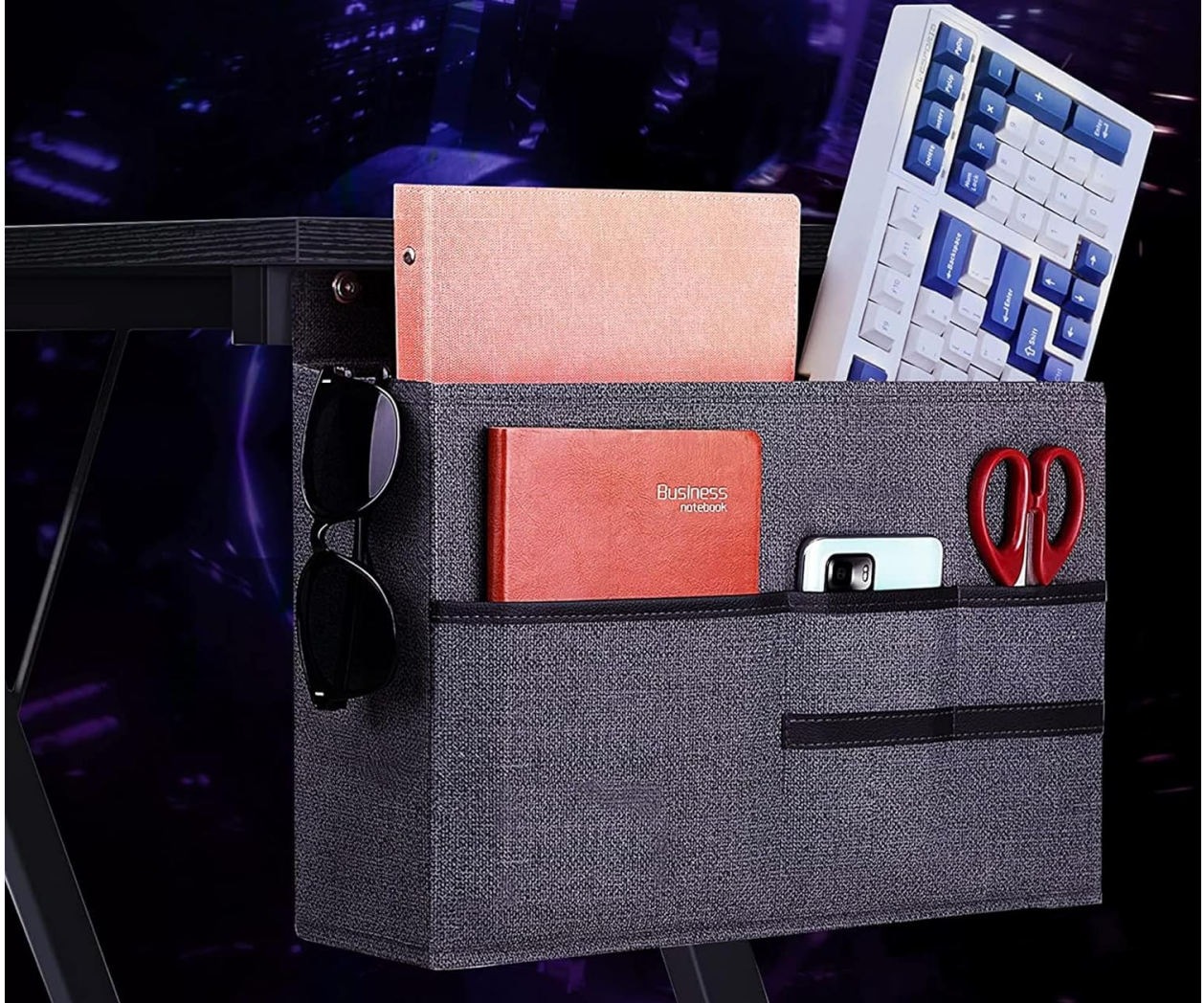
Image 4.3: The switchable storage bag for organizing files and small objects.