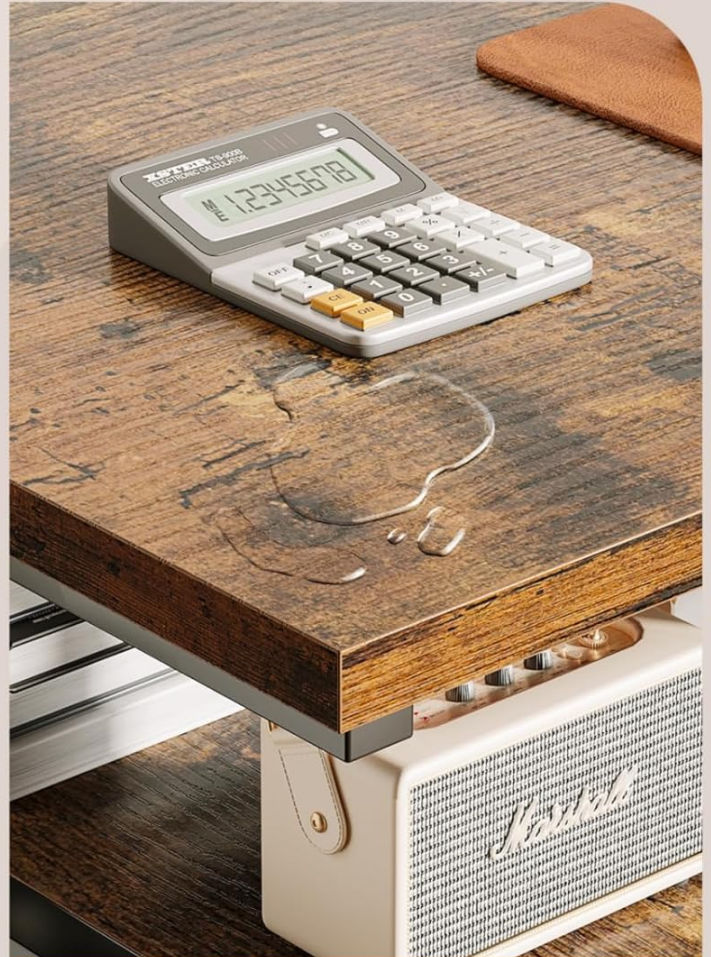
High Quality Desktop