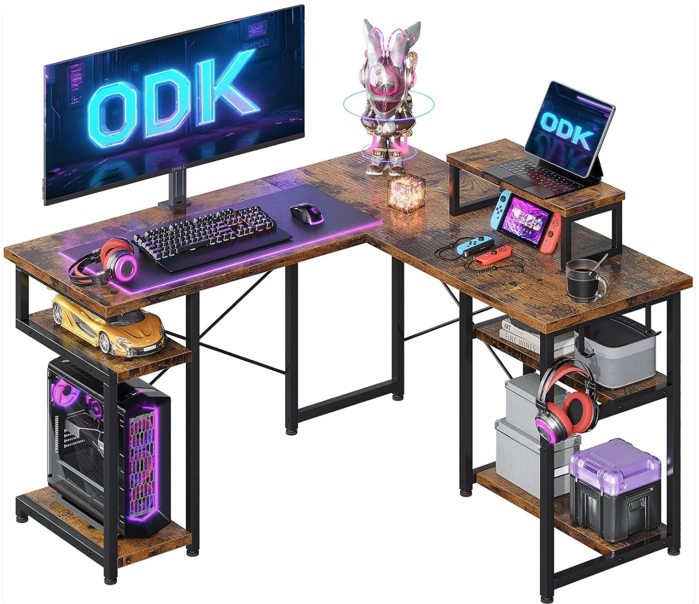
Image 1.1: The ODK L-Shaped Desk, showcasing its spacious design and integrated storage.