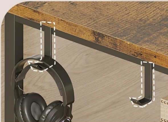
Two Iron Hook