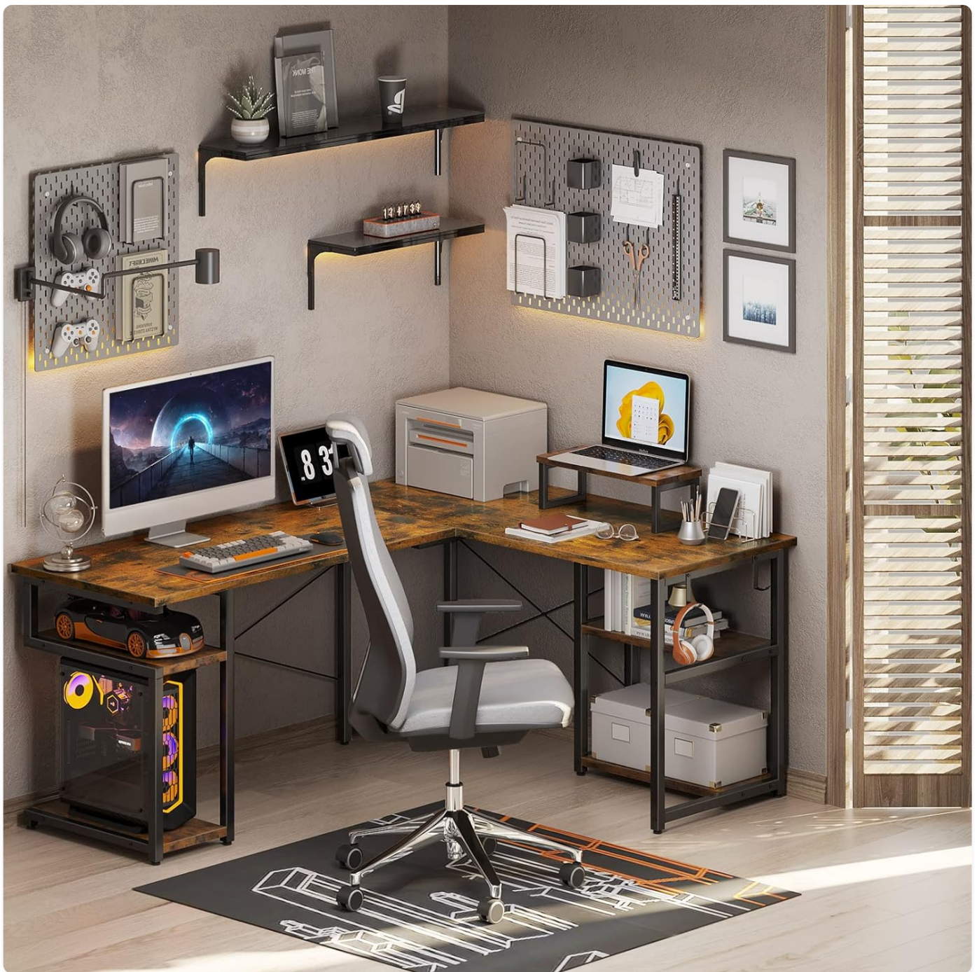
Image 5.1: The ODK L-Shaped Desk in a typical office setup, demonstrating its practical use.