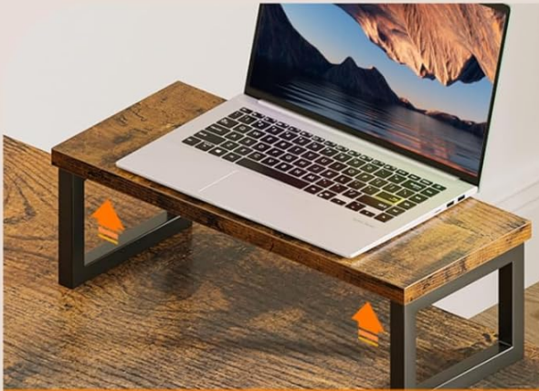
Movable Monitor Stand