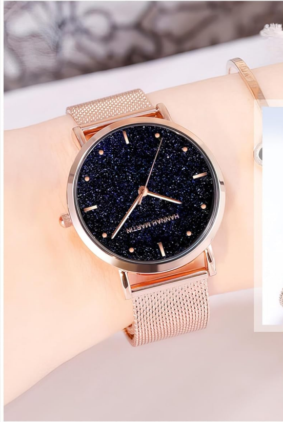
Fashion Starry Sky Dial