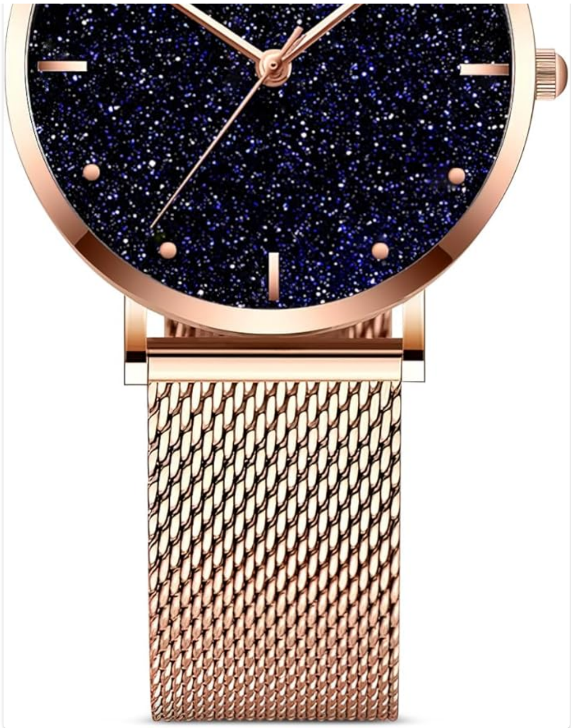
Image 1.1: The dirocoro Women's Analog Quartz Watch, showcasing its elegant design and starry sky dial.