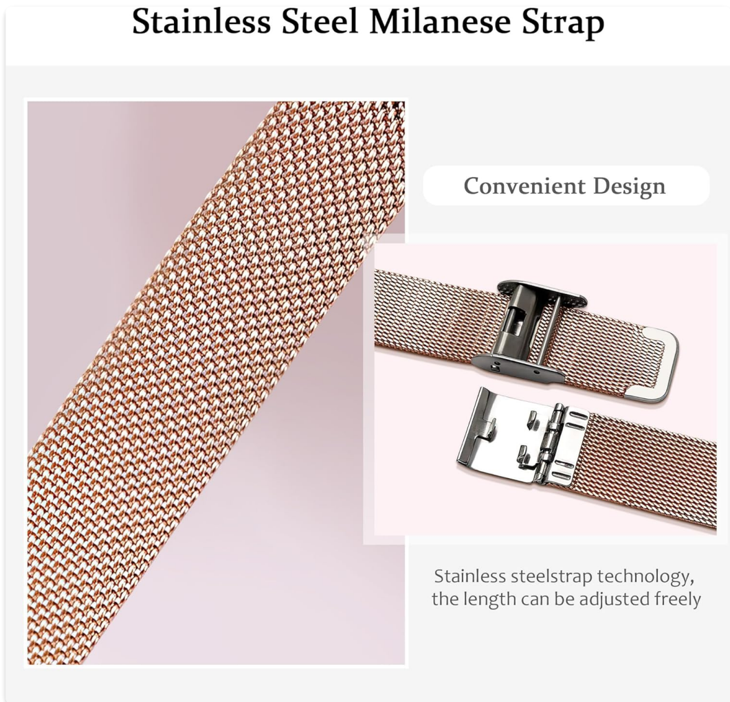
Image 2.2: View of the stainless steel Milanese strap, showing its fine mesh and adjustable clasp mechanism.