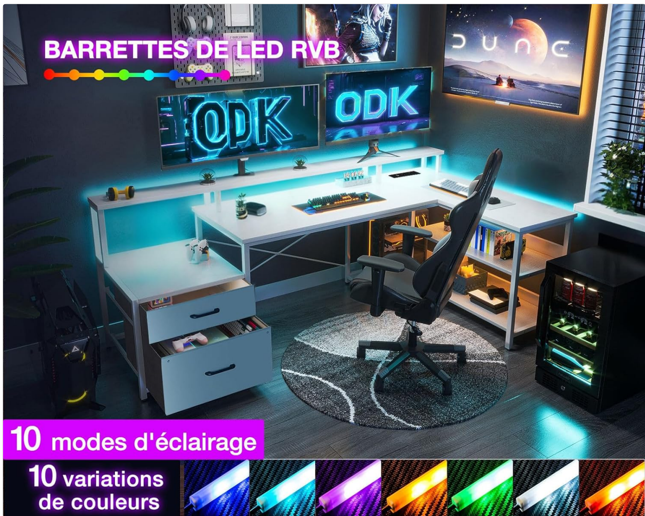
Figure 7: An illustration of the ODK desk's comprehensive storage capabilities, highlighting the two file drawers suitable for letter and A4 documents, and the various shelves for organizing office essentials and personal items.