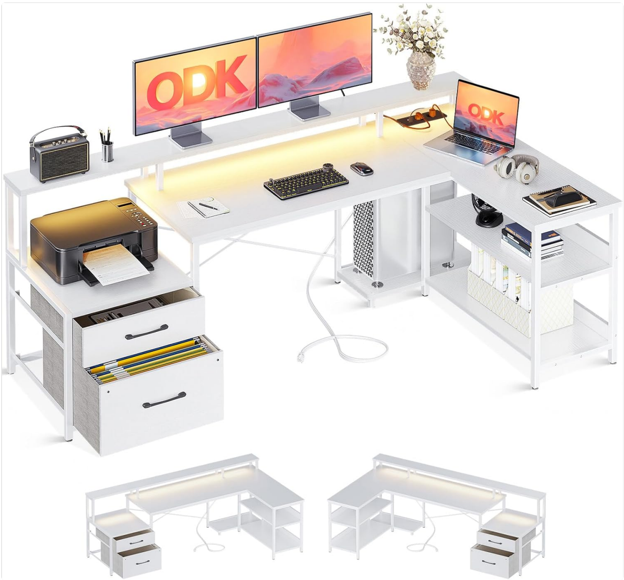
Figure 1: The ODK L-Shaped Corner Desk, showcasing its spacious design, integrated monitor stand, and storage solutions including drawers and shelves. The desk is presented in a clean, white finish.