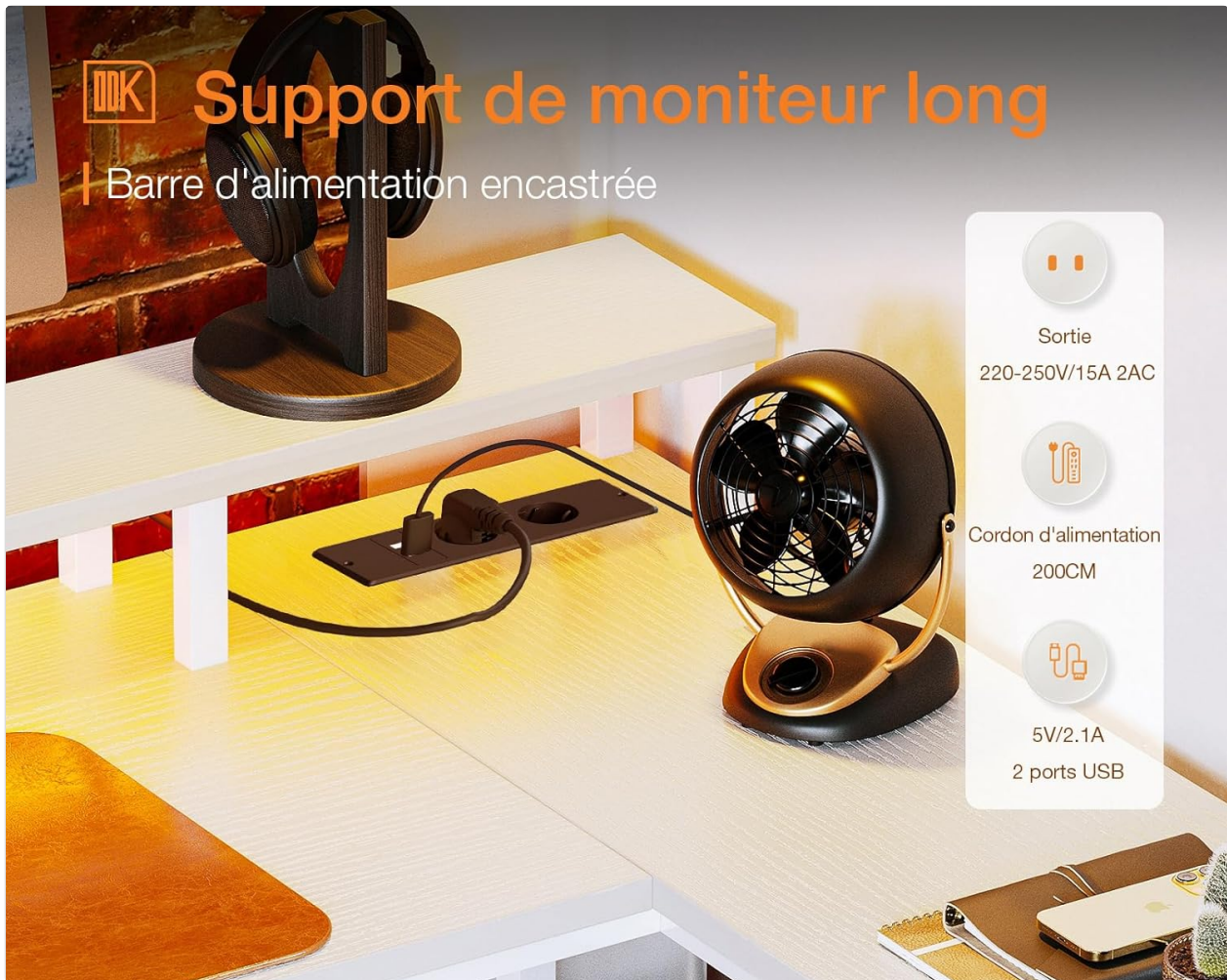
Figure 6: A close-up view of the integrated power strip on the ODK desk, showing the two standard power outlets and two USB charging ports, designed for easy access to power for your electronic devices.