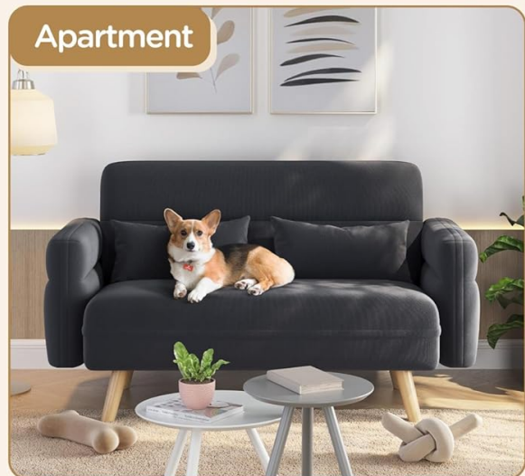
Image: Examples of the loveseat's versatile placement in various room types, including living rooms, lofts, offices, and apartments.