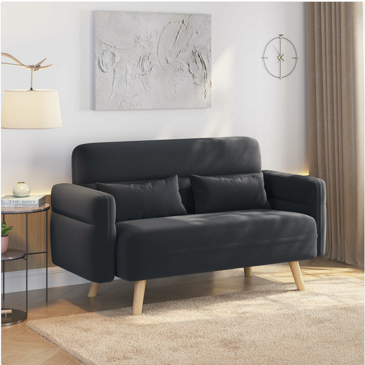
Image: The Yaheetech 46-inch Small Modern Fabric Loveseat in Dark Gray, showcasing its compact and modern design.