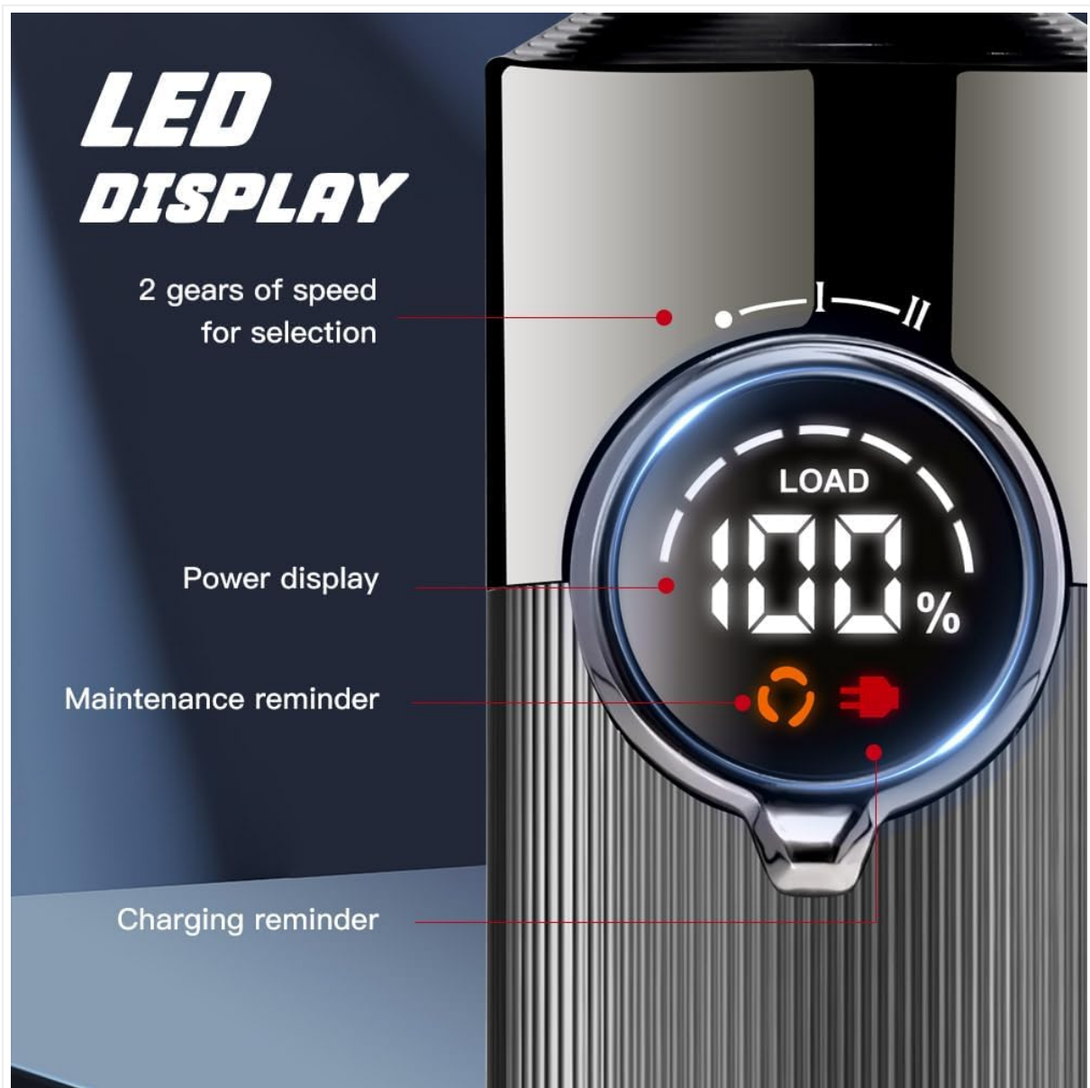
Figure 3: Detailed view of the LCD display, indicating battery charge percentage, two speed settings (I and II), a maintenance reminder icon, and a charging reminder icon.