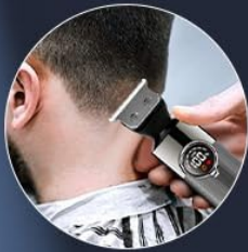
Full Size Trimmer