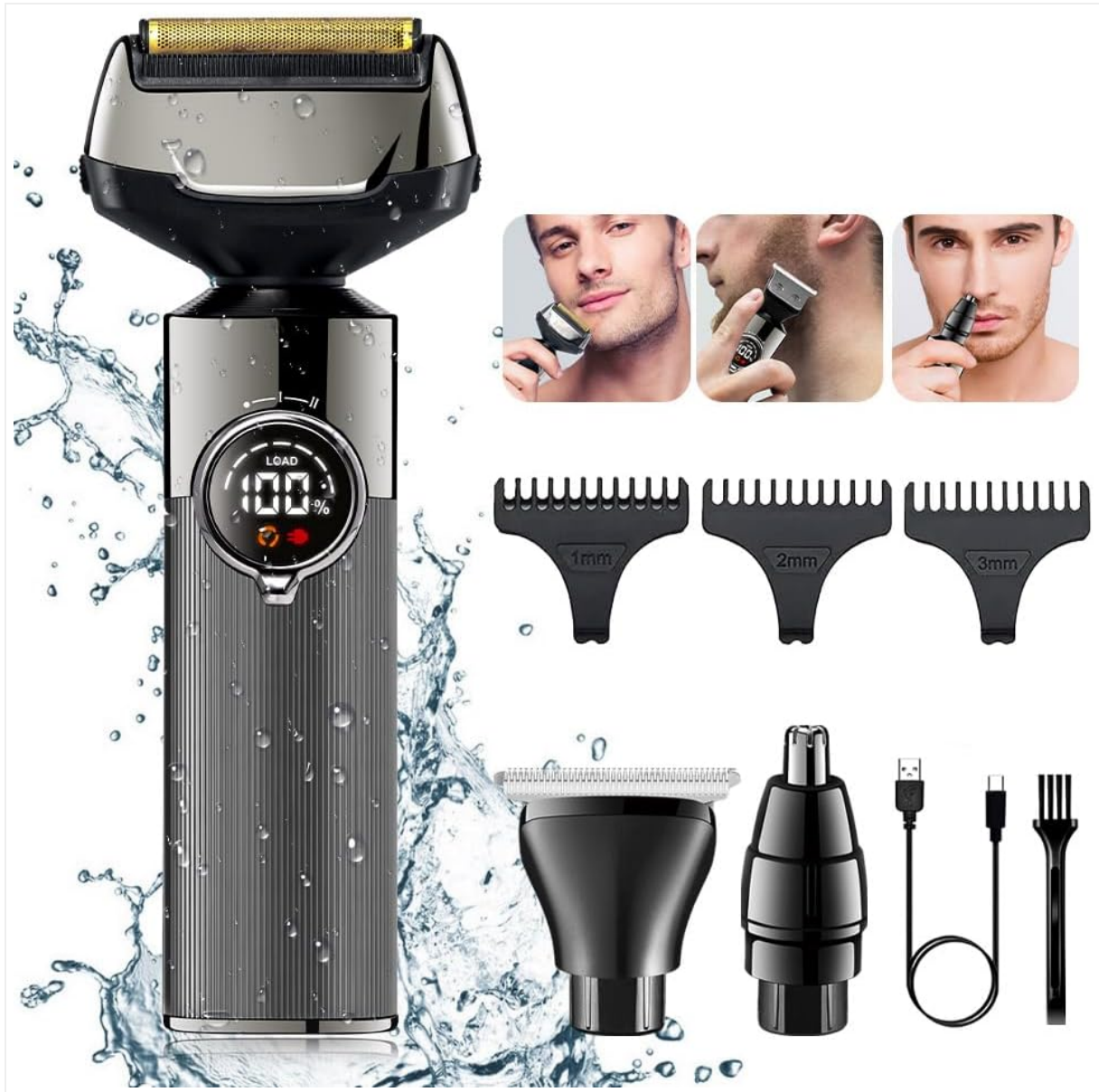
Figure 1: The Solimpia Electric Shaver Set, displaying the main unit, three interchangeable heads (miniature shaver, full-size trimmer, nose hair trimmer), three guide combs (1mm, 2mm, 3mm), a cleaning brush, and a USB charging cable.