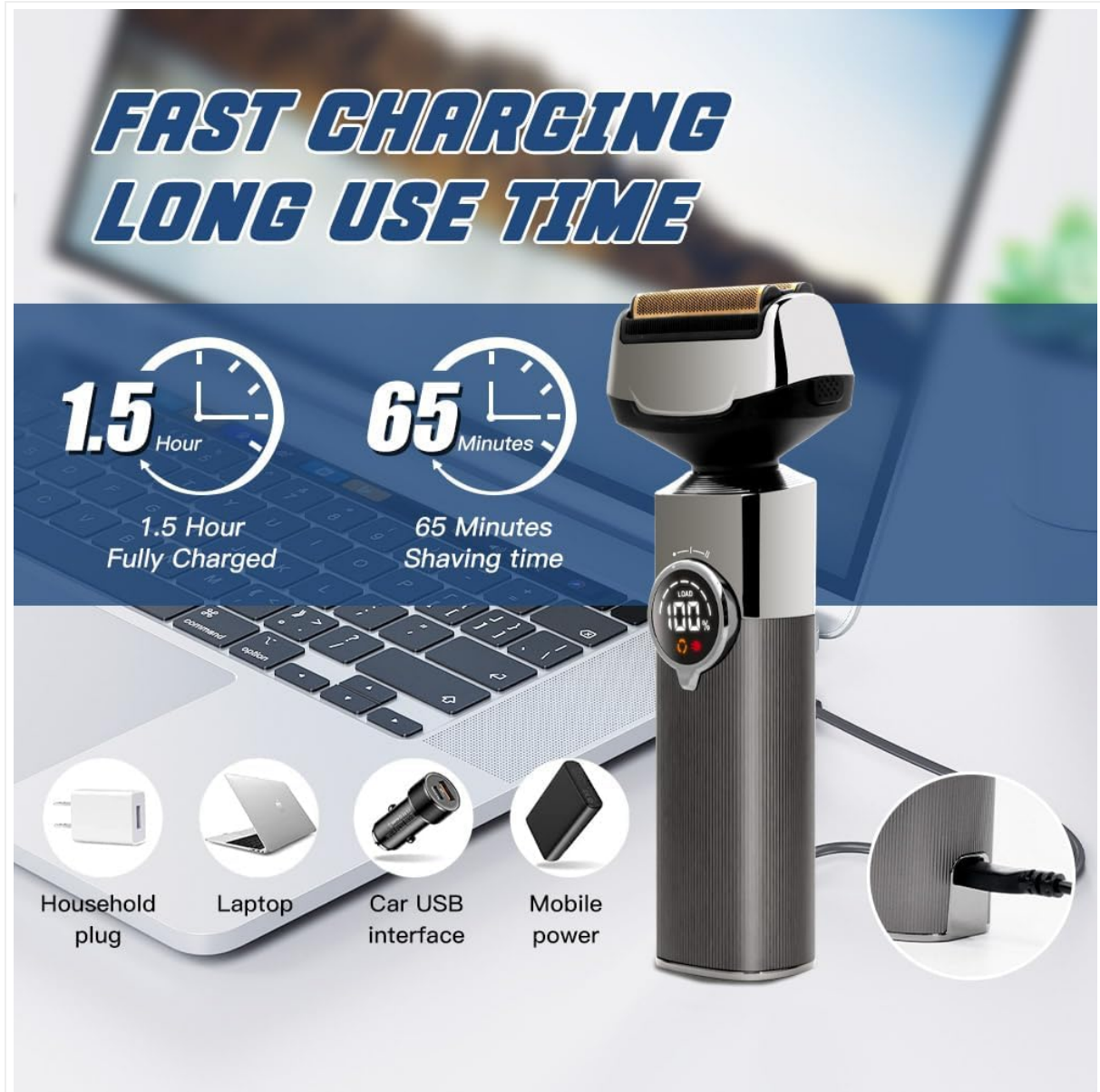
Figure 2: The Solimpia shaver connected to a laptop via its USB charging cable, illustrating the charging process. The display shows "100%" indicating a full charge.