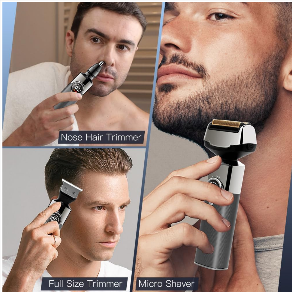
Figure 4: A man demonstrating the use of the miniature shaver head for facial hair removal, highlighting its close-shave capability.