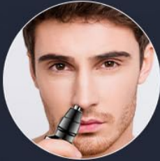
Nose Hair Trimmer