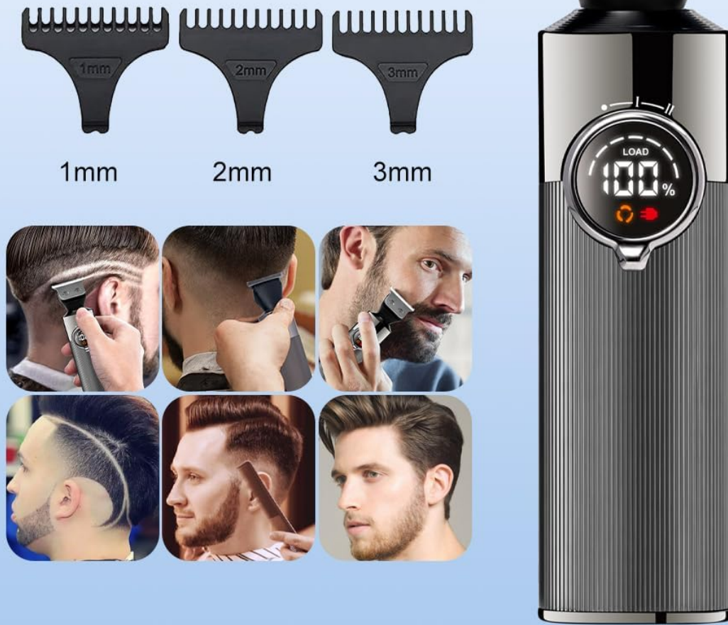
Figure 6: The Solimpia shaver displayed alongside its three guide combs (1mm, 2mm, 3mm), with examples of different beard and hair styles achievable using the trimmer.