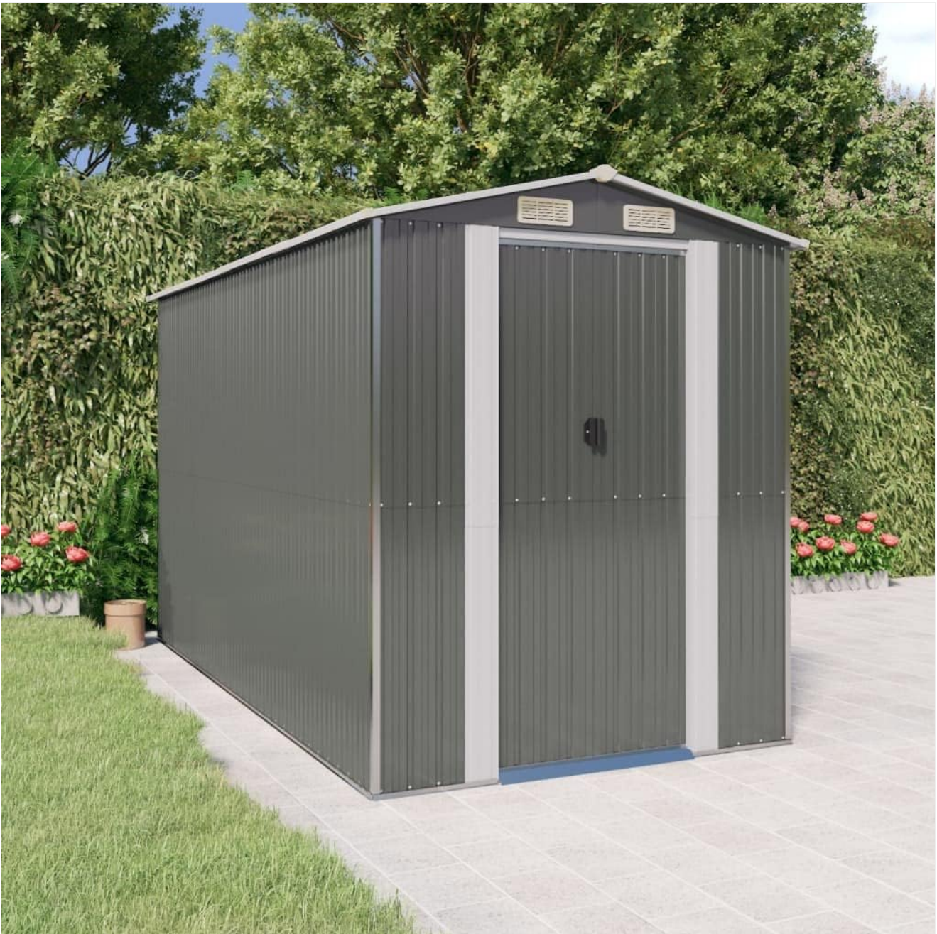
Image 1: The vidaXL Galvanized Steel Outdoor Storage Shed situated in an outdoor garden environment.