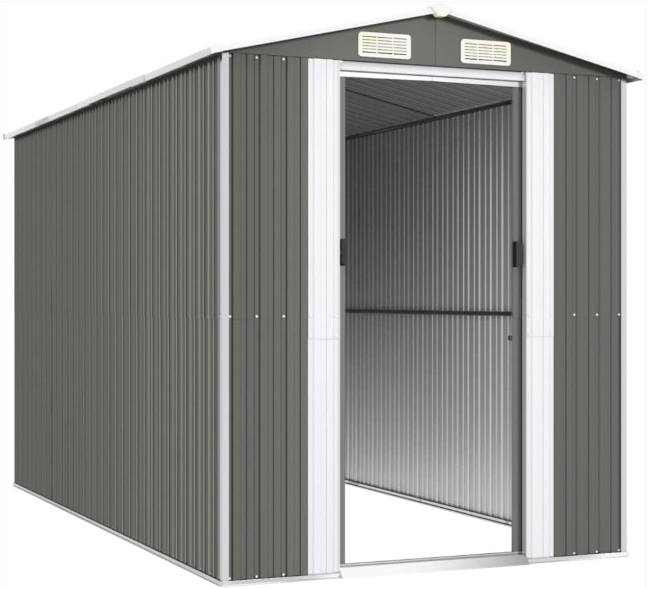
Image 3: Front view of the shed with the sliding door open, revealing the interior space.