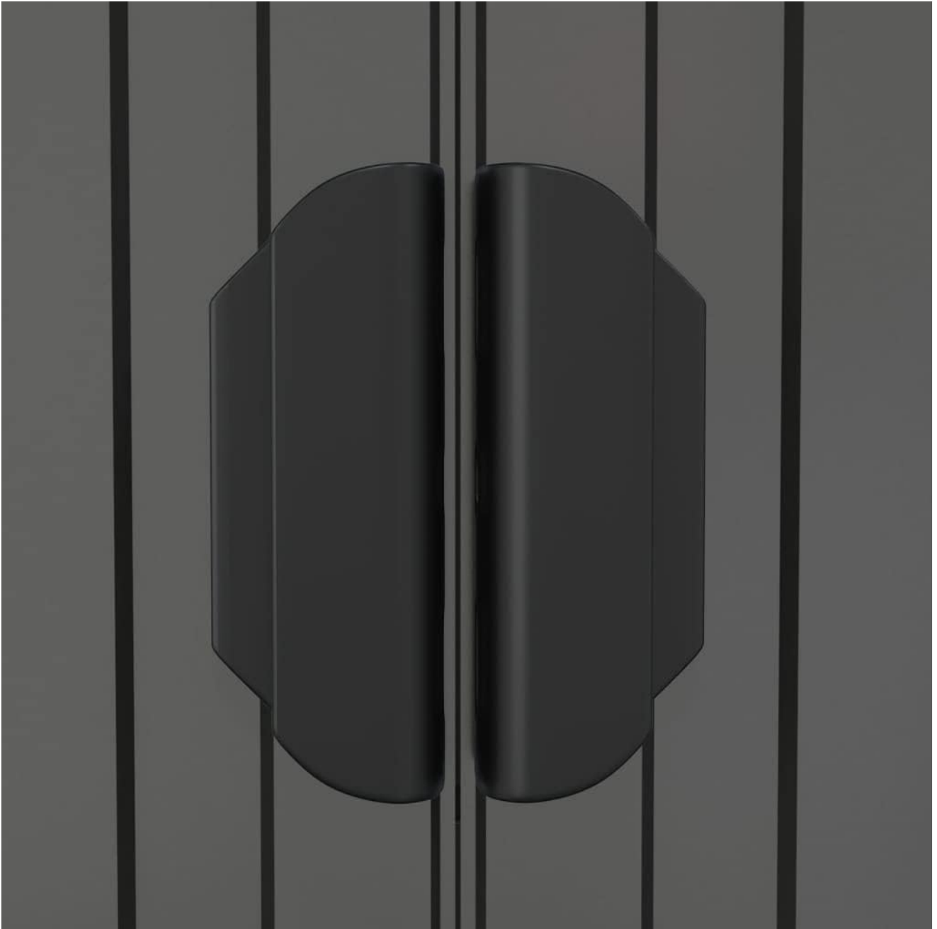
Image 5: Detail of the ergonomic handle on the sliding door for easy opening and closing.

The shed features a convenient sliding gate for access. To open, gently slide the door along its track. To close, slide it back until it meets the frame. Ensure the track is clear of debris for smooth operation.