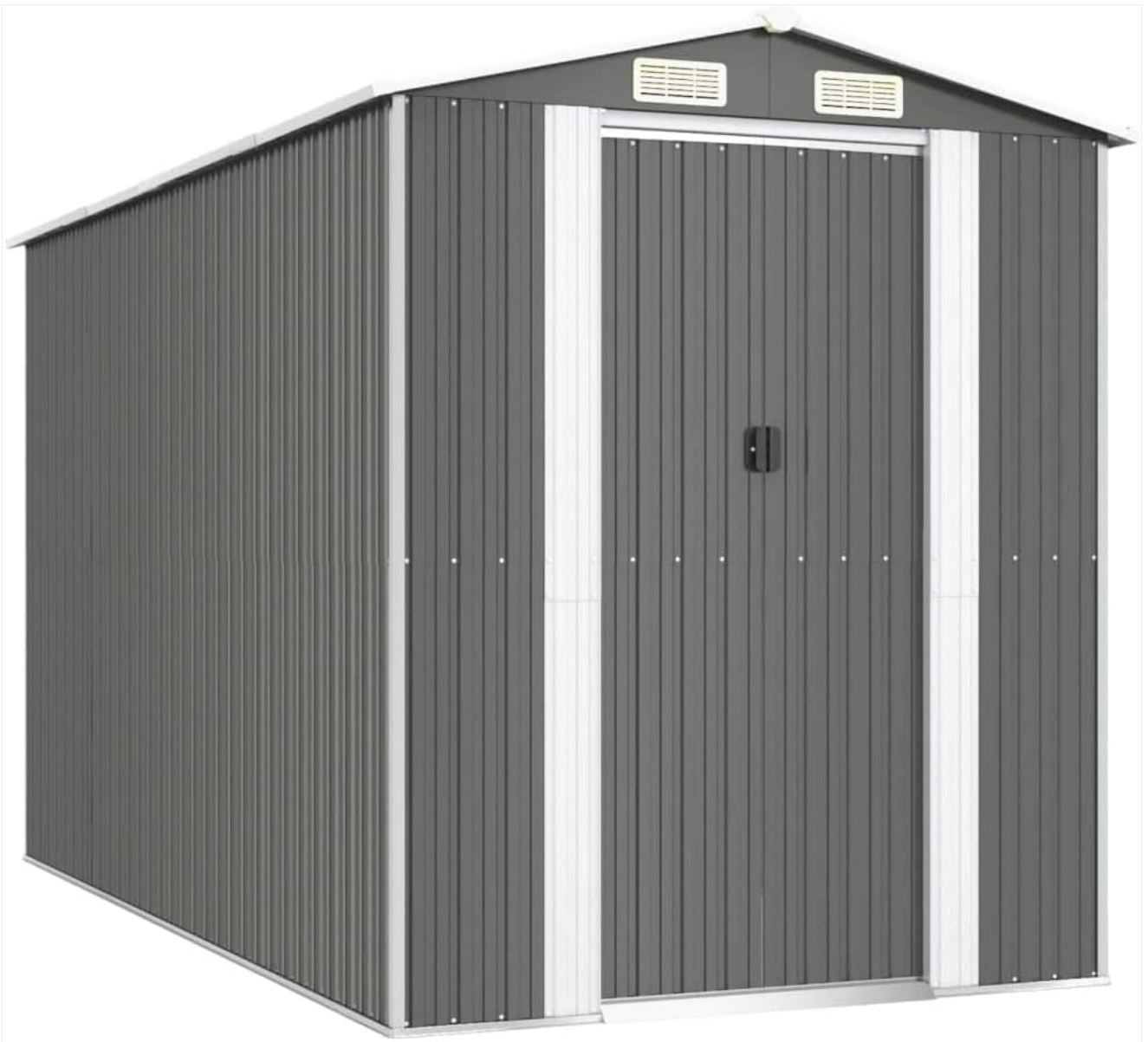
Image 2: Front view of the assembled shed, showcasing the closed sliding door and roof vents.