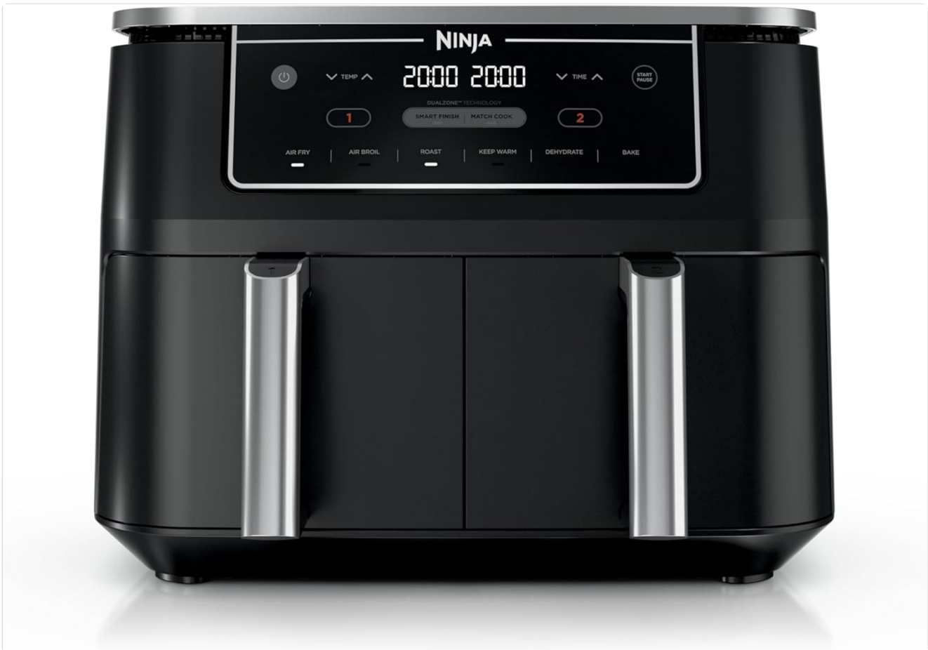
Image: A front view of the Ninja DZ302 DualZone Air Fryer, showcasing its sleek black design, digital control panel, and two distinct cooking zones with handles.