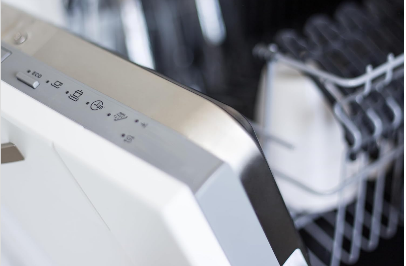
Image: A dishwasher rack containing the crisper plates and cooking baskets from the Ninja DZ302 Air Fryer, demonstrating their dishwasher-safe design for convenient cleaning.

Two 5-qt cooking baskets and crisper plates are nonstick and dishwasher safe.