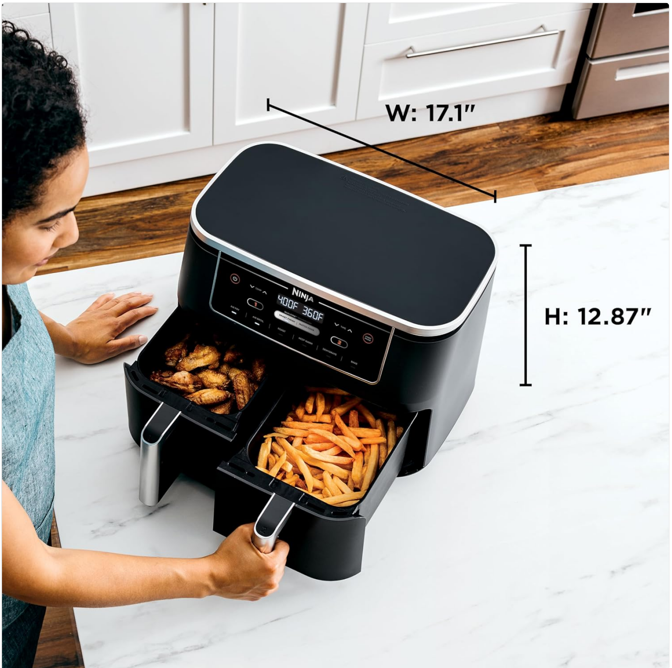
Image: A person observing the Ninja DZ302 Air Fryer, with clear labels indicating its width (17.1 inches) and height (12.87 inches) for reference.