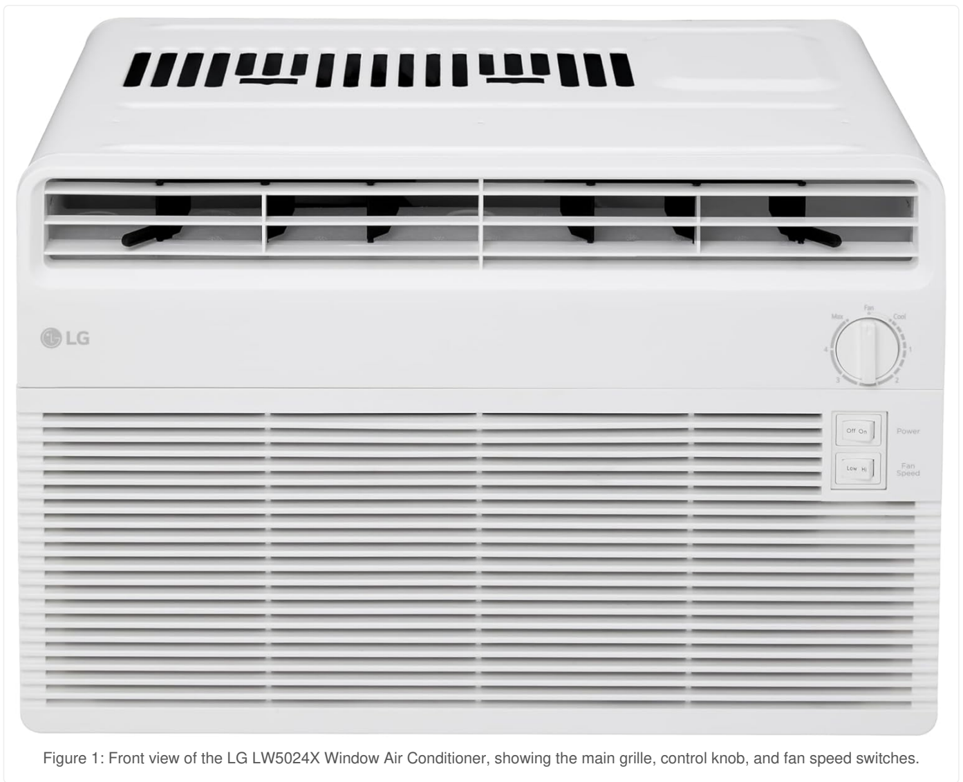
Figure 1: Front view of the LG LW5024X Window Air Conditioner, showing the main grille, control knob, and fan speed switches.