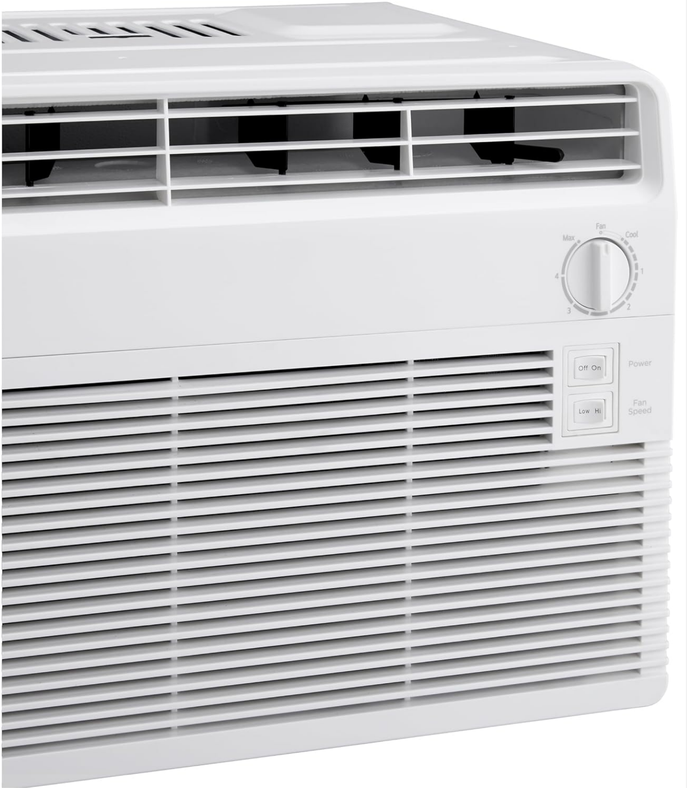
Figure 6: Close-up of the mechanical control panel, showing the main dial for mode selection and switches for power and fan speed.