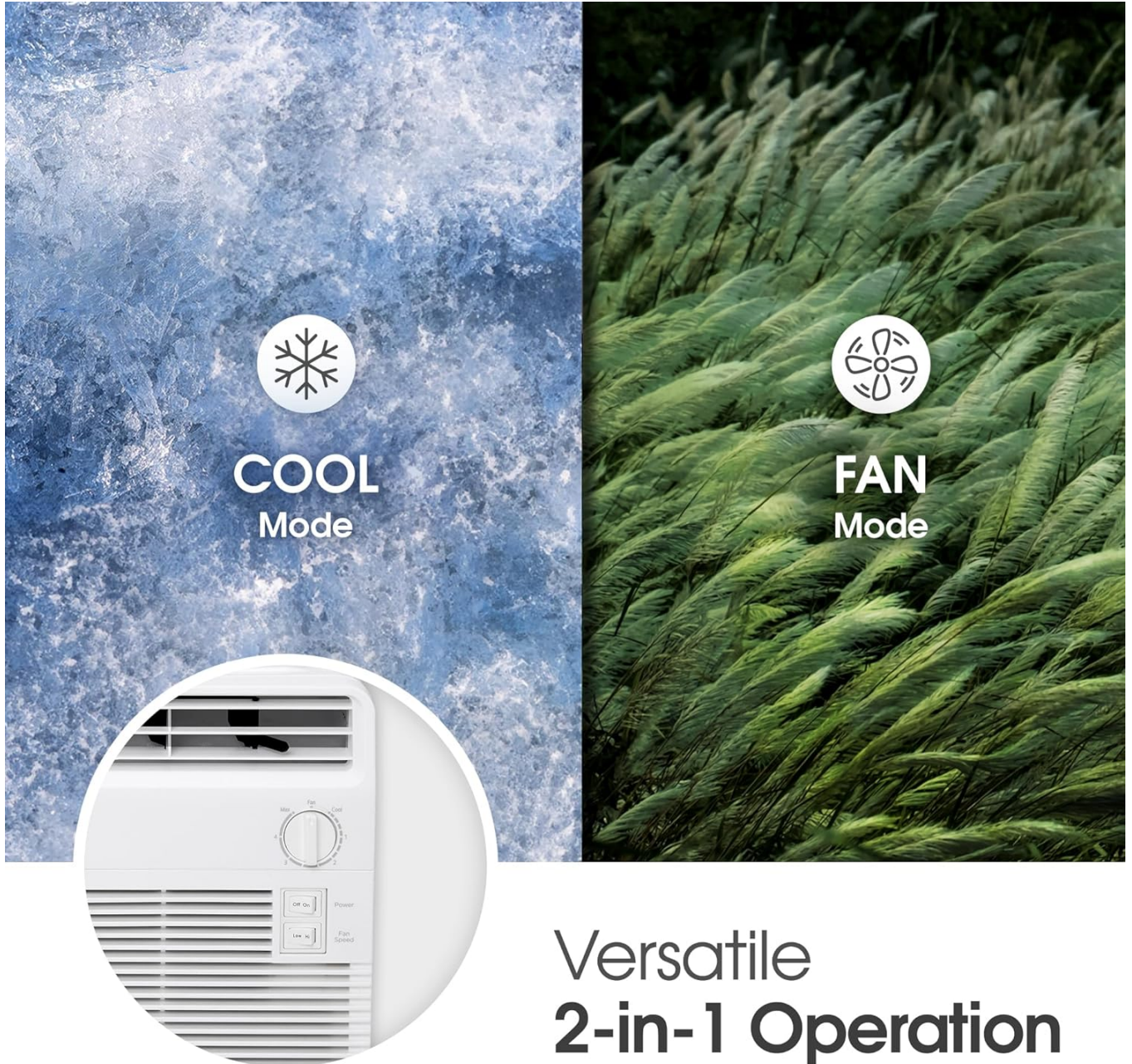
Figure 2: Illustration of the unit's versatile 2-in-1 operation, offering both Cool Mode for powerful cooling and Fan Mode for air circulation.