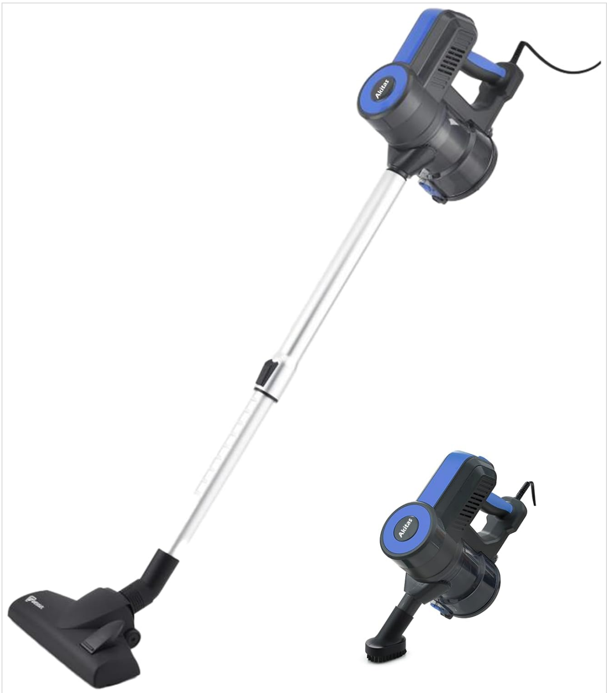
Image: The Akitas S12 vacuum cleaner shown as a full stick vacuum and as a compact handheld unit.