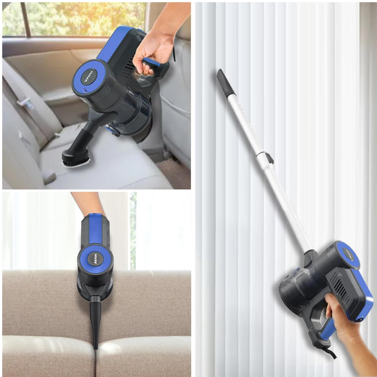
Image: The Akitas S12 vacuum cleaner demonstrating its versatility, being used as a handheld unit for car interiors and couch cleaning, and with the telescopic tube for high-reach areas like curtains.