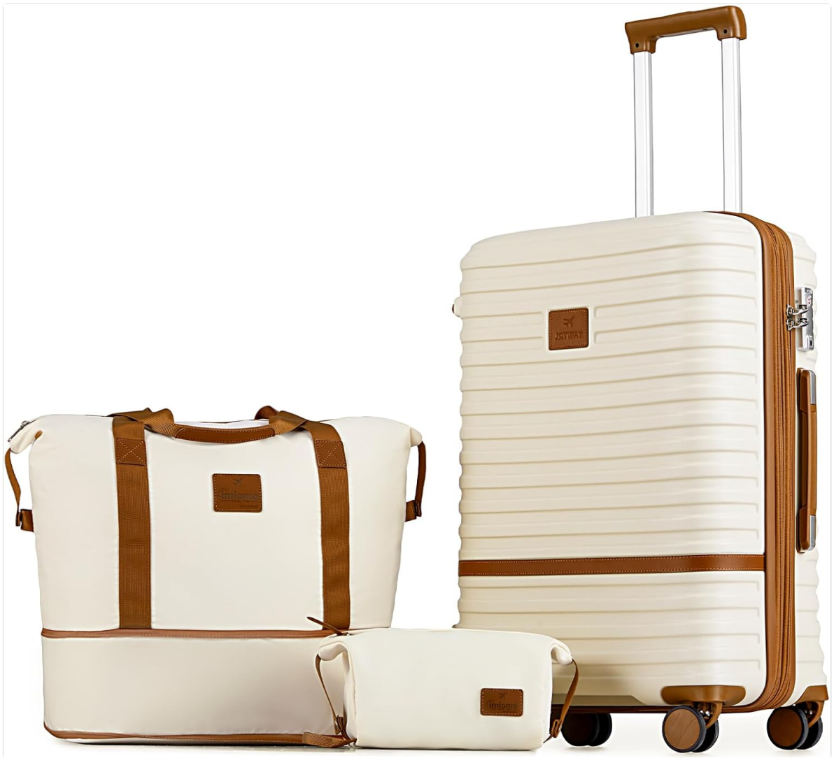
Image 2.1: The complete Joyway 3-piece luggage set, including the 24-inch checked suitcase, a matching travel bag, and a toiletry bag.