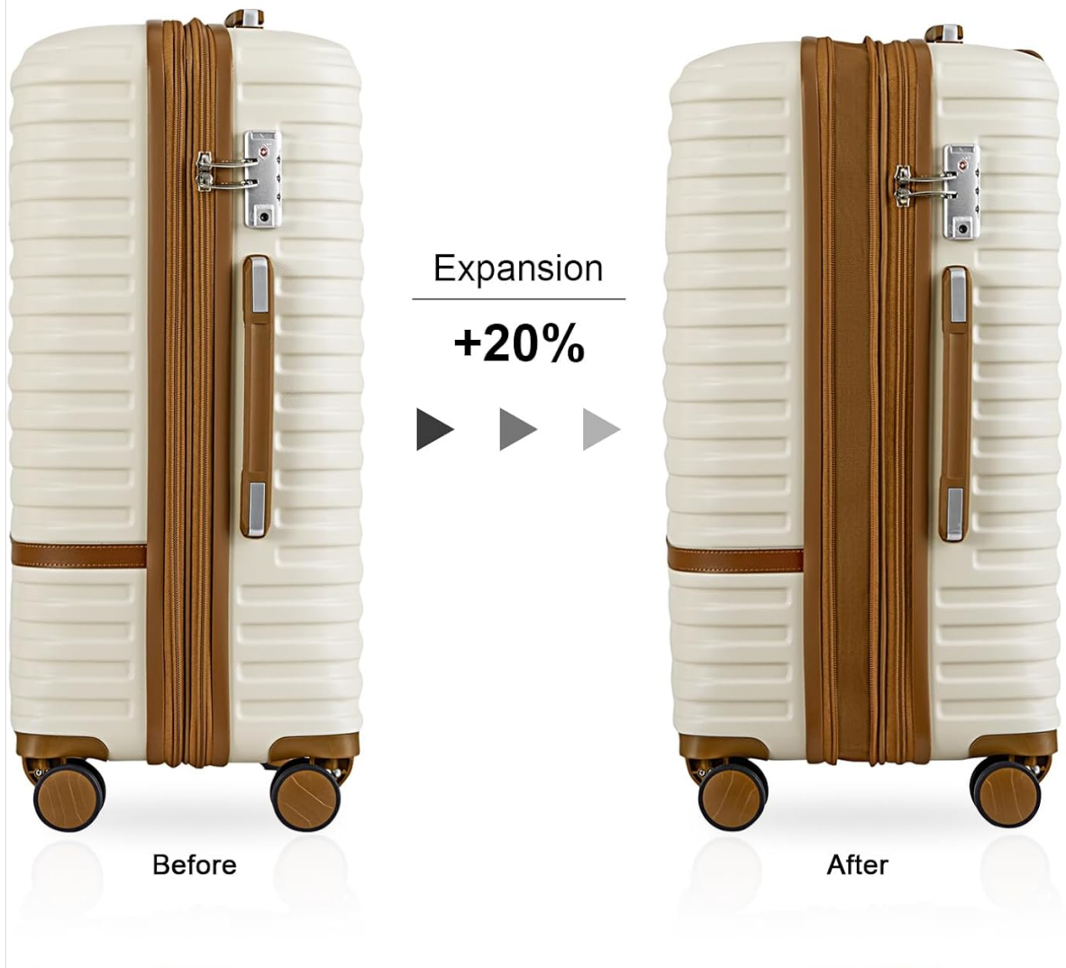
Image 3.2: Illustration demonstrating the luggage's expansion layer, showing the suitcase before and after expansion, providing additional capacity.