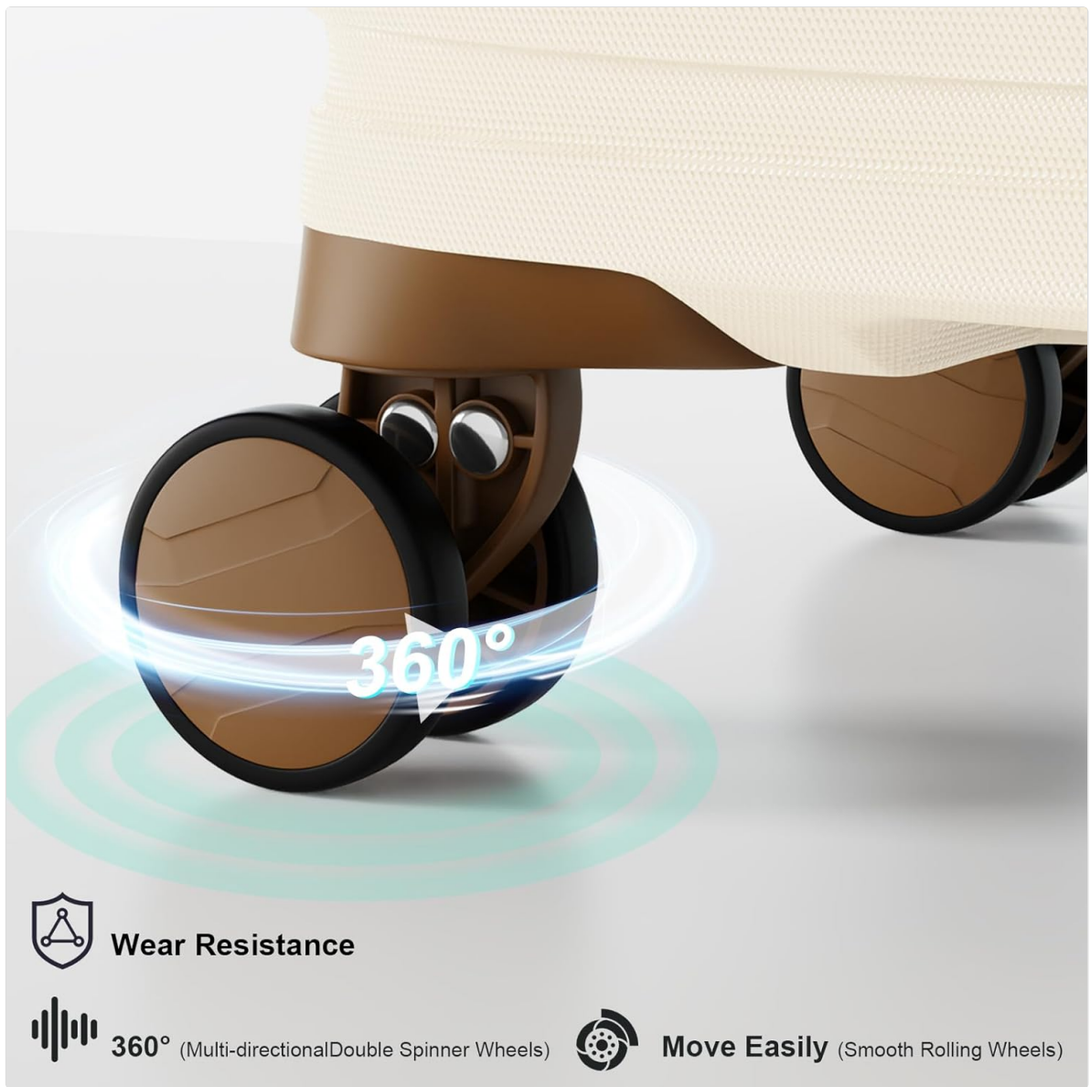
Image 5.1: Close-up view of the multi-directional double spinner wheels, emphasizing their wear resistance and smooth rolling capability.