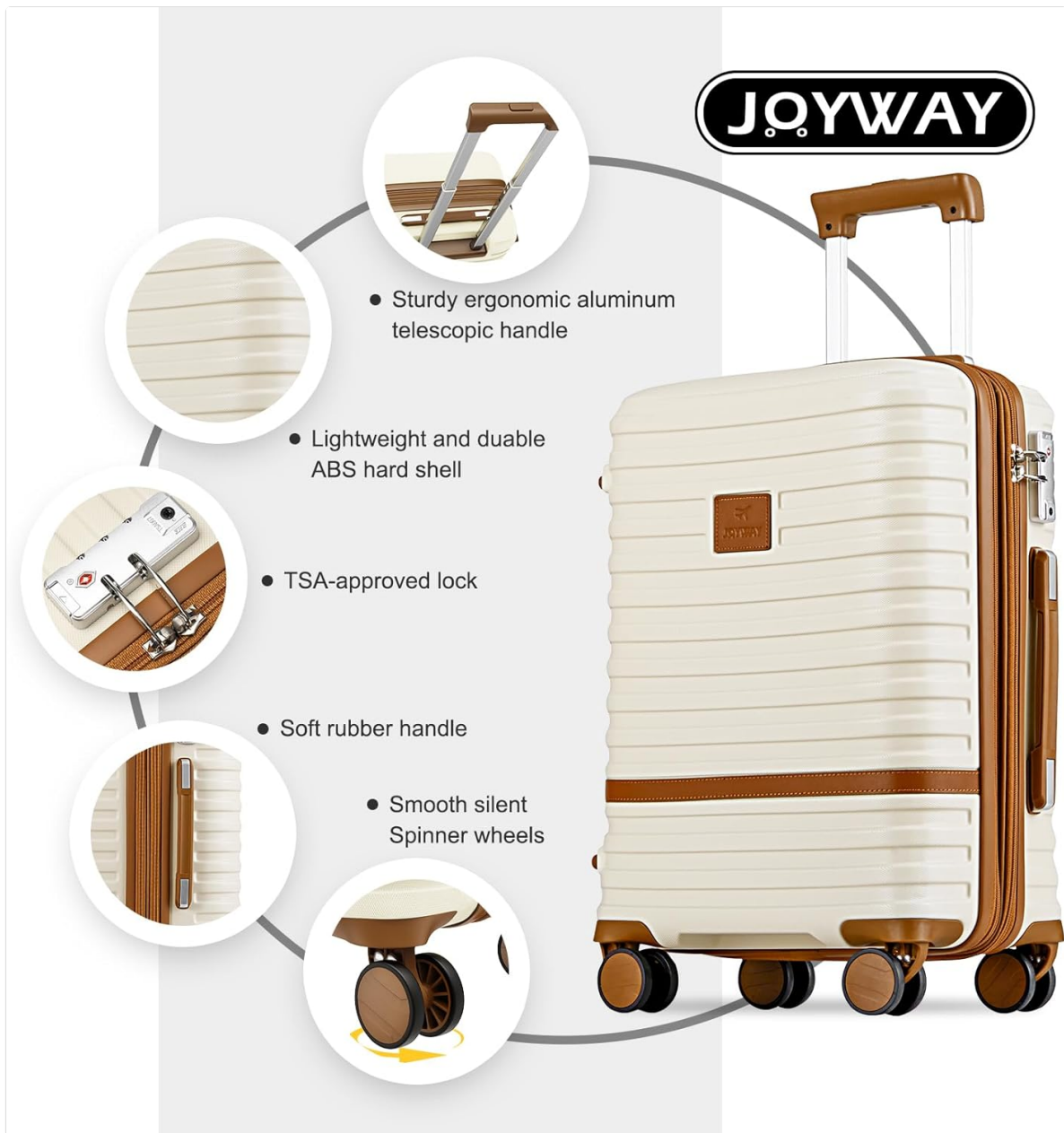
Image 3.1: Diagram highlighting key features such as the sturdy ergonomic aluminum telescopic handle, lightweight and durable ABS hard shell, TSA-approved lock, soft rubber handle, and smooth silent spinner wheels.