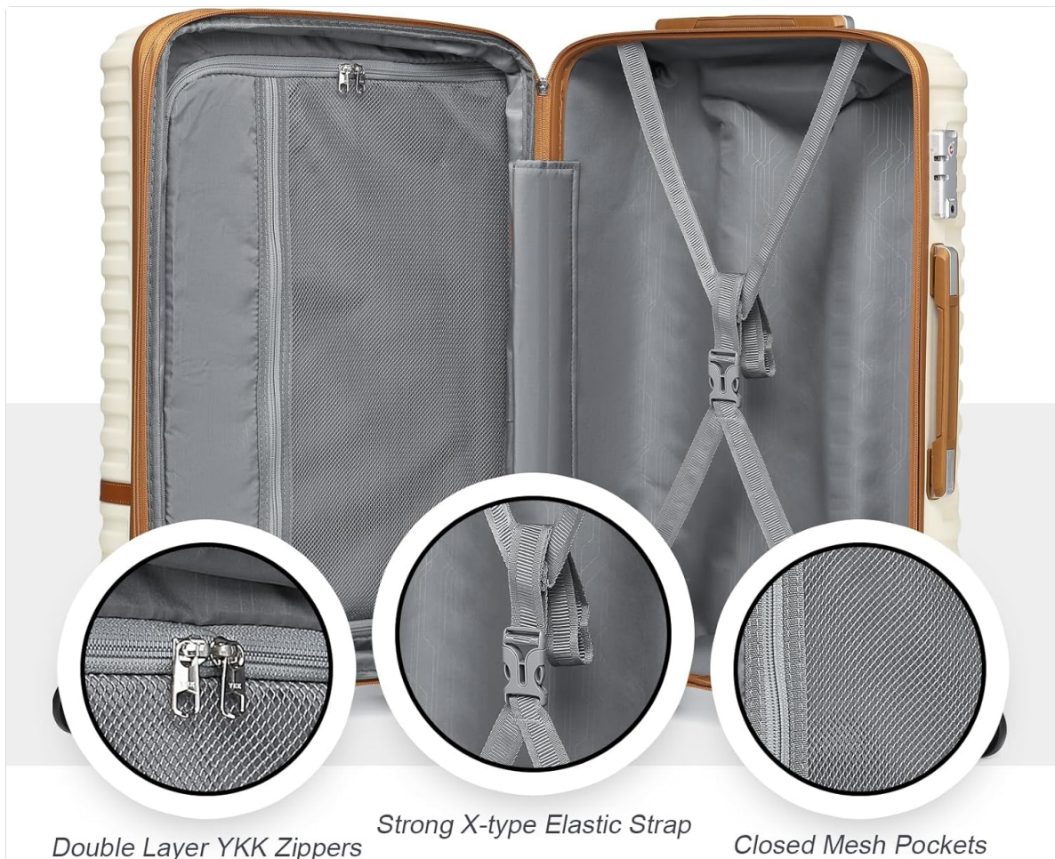
Image 3.3: View of the luggage interior, showcasing the double-layer YKK zippers, strong X-type elastic straps, and closed mesh pockets for organized packing.